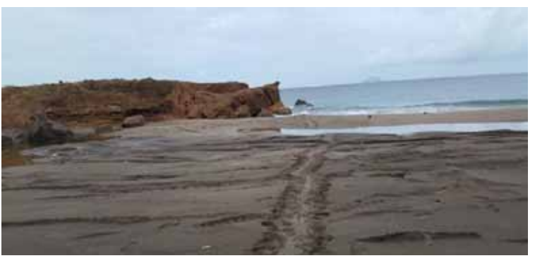
Turtle tracks on Carr's Bay beach.

Meanwhile, discussions have been taking place between the Montserrat Government and UKOTCF regarding best practice in turtle conservation. Tentative plans are being made to conduct a gap analysis to identify priorities for implementing effective conservation measures and the resources that will be needed to deliver these.