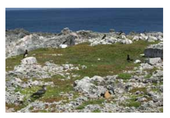
Sombrero

In May this year, Anguilla's Ministry of Infrastructure, Communications, Utilities and Housing announced that the island of Sombrero had officially been designated as a Wetland of International Importance under the Ramsar Convention. This accolade recognises Sombrero's international significance, and should help attract resources for management and conservation initiatives. Listed as a proposed Ramsar Site by UKOTCF's review for UK and UKOT governments and an Important Bird Area since 2005 and a Nature Reserve Marine Park since 2007, Sombrero lies 65 km to the northeast of Anguilla. It has an area of 38 ha and acts as a stepping stone for wildlife halfway between Anguilla and the British Virgin Islands. Important residents include the bridled tern Sterna anaethetus , brown booby Sula leucogaster , masked