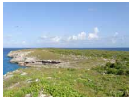
Prickly Pear Cay

There is good news from Anguilla's Prickly Pear Cays, where a rat eradication project led by the Anguilla National Trust, with support from New Zealand-based Wildlife International Management Ltd, has achieved complete eradication of the invasive rodents from the east and west cays. Using a network of 435 bait stations and 870 monitoring stations, the team of young Anguillians successfully eliminated all sign of rats from the fragile ecosystems of the islands. The removal of the rats should be a great boost for the native wildlife, particularly the nesting bird species that occur in this Important Bird Area. The team will continue with periodic checks for evidence of rats over the next year, and are asking visitors to be especially careful not to reintroduce inadvertently any rats to the cays.