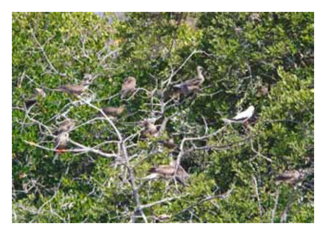
Red-footed and brown boobies at Booby Pond, Little Cayman

The Cayman Department of Environment (DoE) put forward ten new sites for possible designation as Protected Areas. The sites span all three Cayman Islands, and host rare fauna and flora in need of further protection. They include Tarpon Lake on Little Cayman, one of the best preserved inland natural areas on the island, which is home to tarpons and fiddler crabs and visited by a wide range of migratory bird species. One of the nominates sites on Cayman Brac is the Eastern