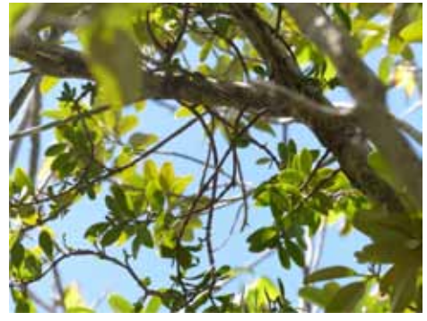
First photographic evidence of Dendropemon caymanensis.