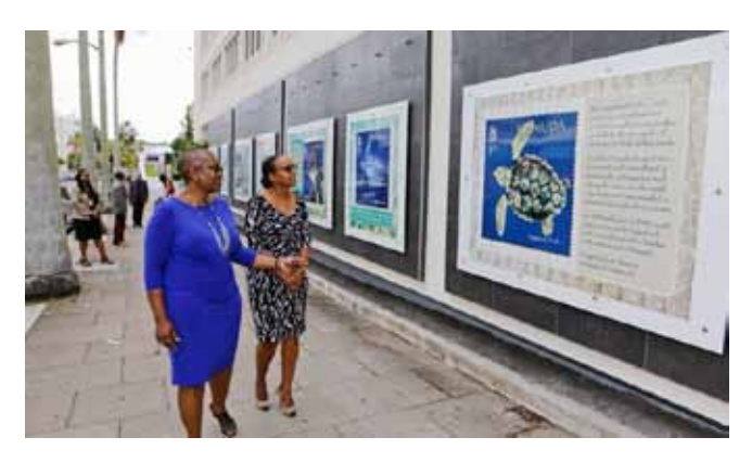
The Bermuda Postal Office unveils the 50th Anniversary Bermuda Turtle Project Postal Panels

In Bermuda, research has continued into the ecology of the island's turtle populations as part of the Bermuda Turtle Project, now in its 50th year. During 2018, 259 green turtles and one hawksbill turtle were captured at study sites around the island. Of these, 91 had been previously tagged, one as long ago as 2002! Particularly encouraging was the recapture of a green turtle that had been rescued in 2012 after swallowing a fish hook and being stranded near Jew's Bay Dock. Surgery was successfully completed to remove the fish hook and the turtle was released at Shelly Bay in October 2012. When the same animal was recaptured this year, it had grown