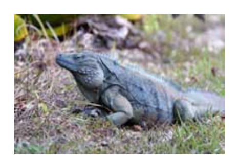
Blue iguana.

The Cayman Islands' Blue Iguana Recovery Program celebrated a huge milestone this year with the successful release of the 1,000th blue iguana into natural habitat. In 2002, only 10-25 blue iguanas were left in the wild, but the hard work of the Recovery Program has brought the species back from the brink. Recent challenges have included an outbreak of a Helicobacter bacterial infection, which left 14 blue iguanas dead, and predation by dogs that had intruded into the site of the captive breeding programme at the Queen Elizabeth II Botanic Park. However, the Recovery Program team have taken steps to improve security at the Botanic Park and to screen individual animals for any sign of bacterial infection before they are considered for release into the Salina Reserve, which is now estimated to boast a population of over 1,000 free-living blue iguanas.