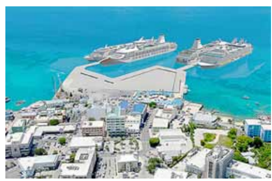
Schematic of the proposed cruise dock development in George Town, Grand Cayman

Opinion remains firmly split regarding plans for the development of a new cruise and cargo port on Grand Cayman. The Cayman Government has been pressing ahead with the tendering process, citing the importance of the new facility for the islands' economy. The Government says that the increased capacity for berthing 'mega' cruise ships will provide a boost to visitor numbers and spending. However, critics continue to raise concerns regarding the environmental impact of the project, with up to 15 acres of coral reef set to be destroyed by dredging. The National Trust for the Cayman Islands has stated that there are 'too many unanswered questions' about the proposals, and