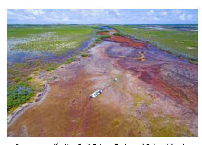
Sargassum affecting East Caicos, Turks and Caicos Islands

On the open ocean, Sargassum provides important habitat for a range of sea creatures, including shrimp