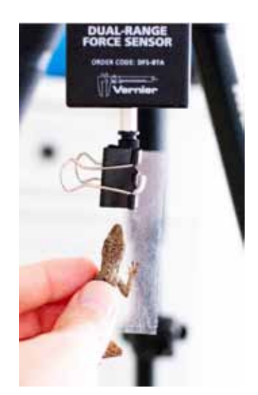
The gripping strength of a lizard is measured with this apparatus. Lizards with larger toepads were able to grip more strongly.

A study published in the scientific journal Nature has highlighted the surprising consequences of Hurricane Irma on lizards in the Turks and Caicos Islands. The researchers, from Harvard University, UC Santa Barbara, UC Davis and Washington University in the USA and CNRS in France, report that the hurricane acted as an agent of natural selection on the lizards. Having been on the islands carrying out a survey of the population of the endemic lizard Anolus scriptus just before the hurricane struck, the researchers decided to return six weeks after Irma to see what effects they could observe in the lizards. Fascinatingly, those lizards which had survived the hurricane tended to have larger adhesive toepads and longer forelimbs, which would have helped them cling to trees more effectively in high winds. The same observations held true on both Pine Cay and Water Cay, and the next generation of lizards on both islands will all be the offspring of parents with large toepads and long forelimbs, representing an evolutionary shift in the average body dimensions of the species as a whole. Overall, the team's evidence strongly suggests that hurricanes could be important drivers of evolution in island lizard body shape.