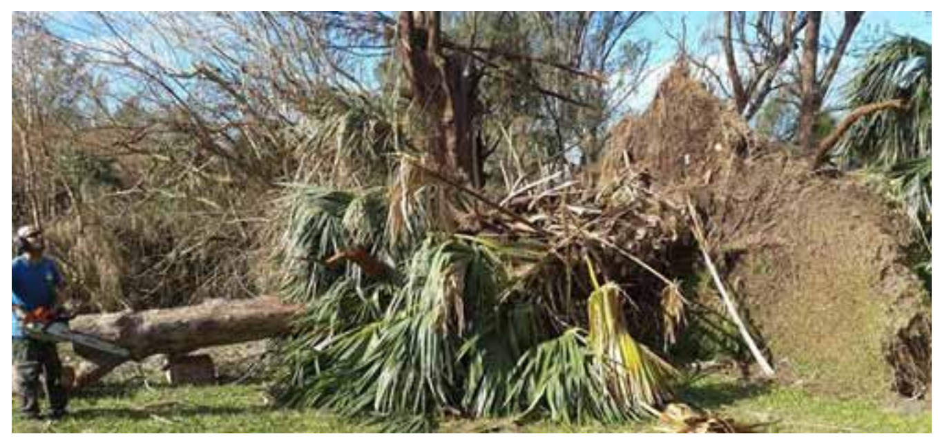
The Horsfield team attacks downed Palmettos

Just as Bermuda thought it had escaped the hurricane season, it was hit by two hurricanes in the space of a week last October. Hurricane Fay hit first, and took the people of Bermuda totally by surprise - weather forecasters still can get it wrong, it seems. Lack of preparation added to the damage, but the worst damage was to the trees, and especially to the nature reserves with thousands of trees down. Only six days later Hurricane Gonzalo made a direct hit, which vastly compounded the damage.