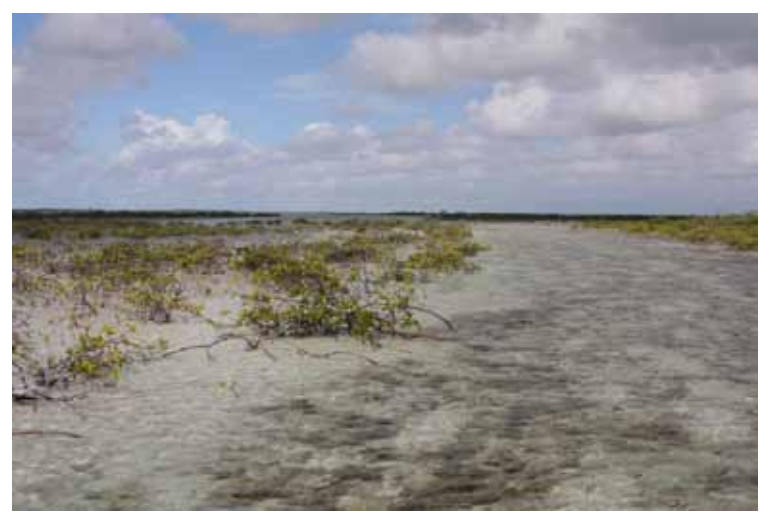
Tidal flats on East Caicos

The importance of East Caicos as the most unspoilt wetland complex in the region seems to be completely undervalued. Good governance would dictate that any major development such as this would require an open, transparent and public Environmental Impact Assessment (EIA). Sadly this has not been the case in previous developments in TCI, and there are concerns that a proper EIA will not be conducted for the current proposal. However, as it has been stated that the EU funds are going to be used to kickstart this project, it is hoped that before any development occurs, a complete, transparent and independent EIA would take place, a requirement of EU-funded projects. Such an EIA should take account of the ecosystem