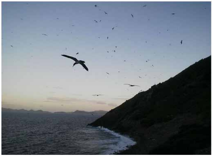
Great Tobago National Park has a regionally and globally significant population of magnificent frigatebirds.

magnificent frigatebird nests in BVI is a good example of a significant threat encountered by seabirds. Tracking of frigatebirds in BVI will help to determine areas where the birds come into contact with this fishing line. April 2014 saw 3 magnificent frigatebirds, Atoya, Clive and Boyd, fitted with satellite tags. A live map of their movements can be seen at http://www.atlanticseabirds.org/mafr-maps.