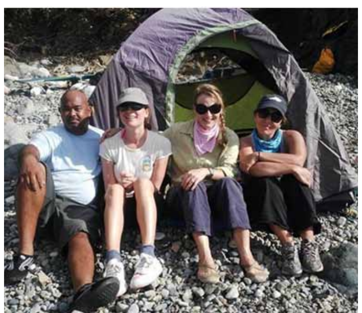
Trip to Great Tobago National Park to collect GPS transmitters from frigatebirds.

Both Anguilla and BVI are home to globally important populations of seabirds. Examples include brown booby Sula leucogaster and sooty tern Onychoprion fuscatus populations in Anguilla and roseate tern Sterna dougallii and magnificent frigatebird Fregata magnificens populations in BVI. Unfortunately, seabirds such as these face a multitude of threats, from competition with fisheries to marine pollution and climate change. The presence of monofilament fishing line in