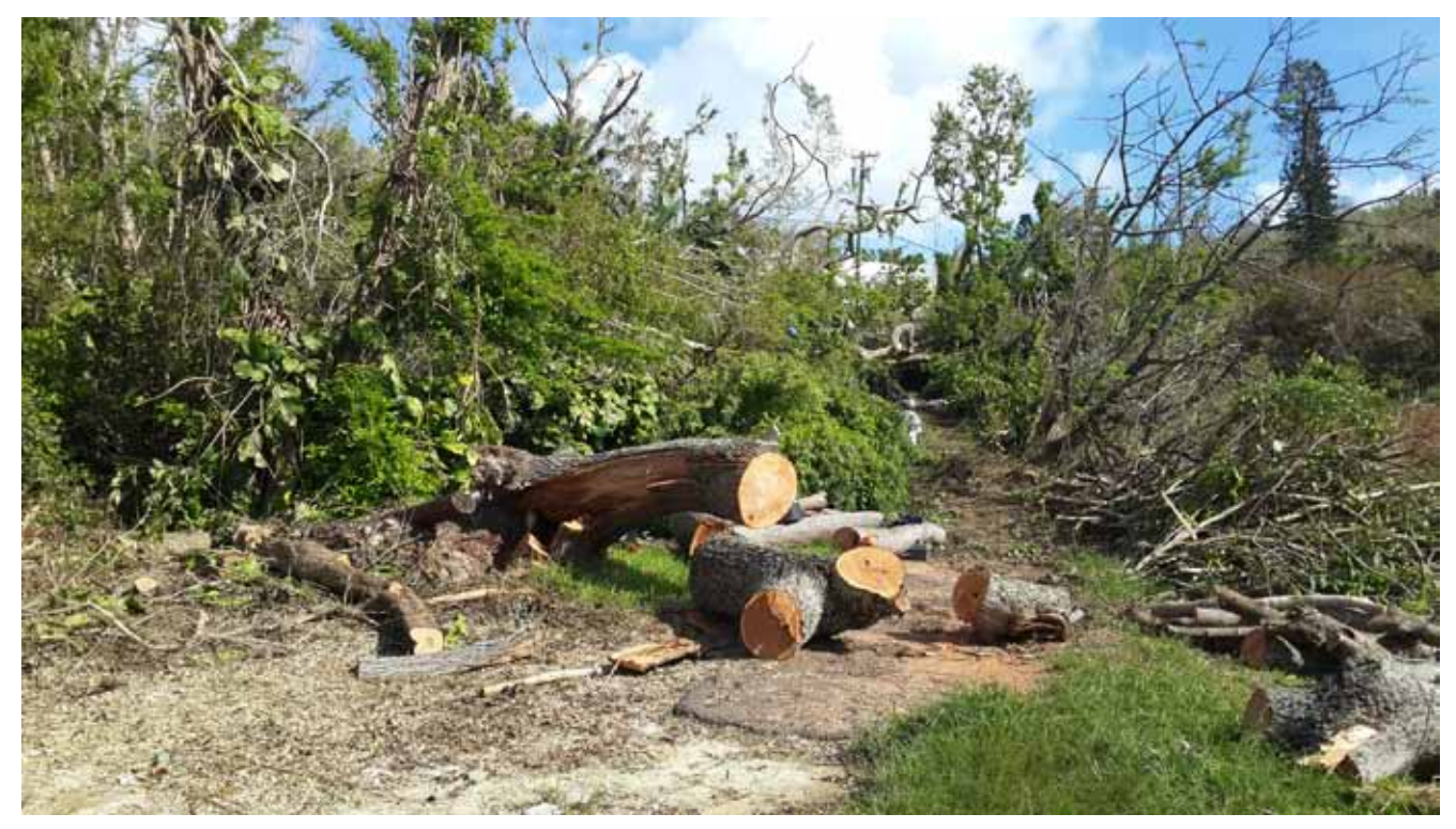
Clean-up in progress at the Trust's Paget Marsh reserve

The Bermuda Audubon Society, whose 60+ acres of nature reserves were similarly damaged, has had the help of professional landscaping firms, Sousa's and Horsfields.