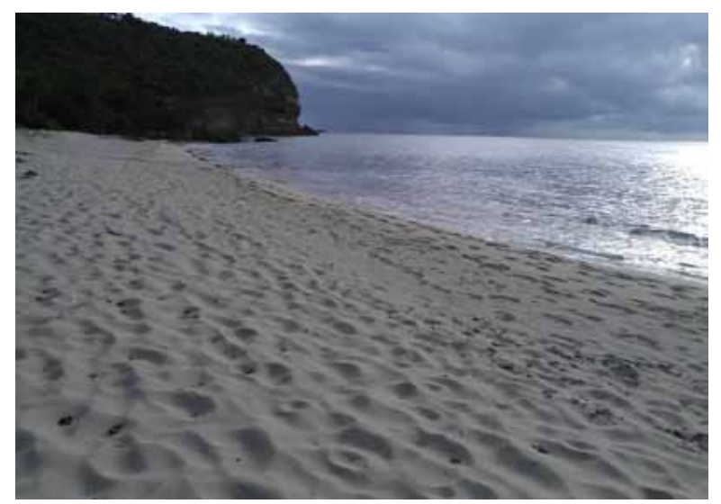
Katouche Bay, Anguilla

The long-term impact of this collaborative project will be to protect the biodiversity and ecosystem services of both marine and terrestrial habitats, through the implementation of protected area networks in the two territories. By project completion, institutional capacity will be increased, networks of protected areas will have been developed, and these will be managed so as