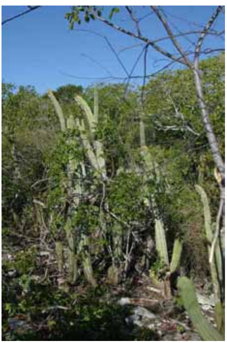
Dry woodland on East Caicos

East Caicos is a superb complex of natural coral reefs, tidal flats, mangroves and marshlands which provide a haven for wildlife, as well as the natural basis of the fisheries and tourism industries. There are important caves and dry tropical forest. It is clear that the whole of this uninhabited island should be included in the Ramsar site, and this was recommended in a 2005 review of potential Ramsar sites conducted by