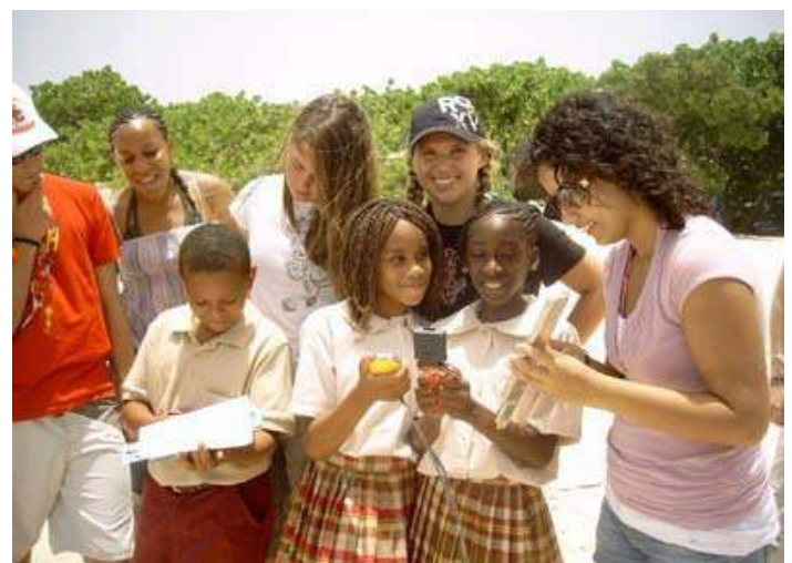
Students of Robinson O'Neal School, Virgin Gorda, measure air temperature and current direction for Sandwatch.