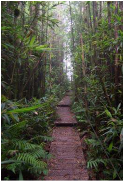
A forest of bamboo surrounds the boardwalk leading up the Dew Pond Path.

nana Bridge" was added to Cronk's to cross a ravine and was later replaced with a bridge lowered in by a RAF helicopter in 1982. Like Cronk's, Elliot's Pass begins at Garden Cottage but circles Green Mountain at 2400 feet. It was built by the Royal Marines in 1840 and includes several tunnels and lookout caves. One can circumnavigate the top of the mountain by walking Elliot's Pass, and continuing to the other side of the mountain via Bishop's Path.