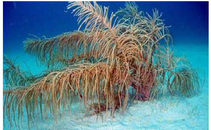
The huge soft coral Pseudopterogorgia acerosa, common in the BVI and eastern Caribbean.

Coralpedia contains over 1,000 photographs of these main reef groups. They can be arranged by taxa or by shape and each