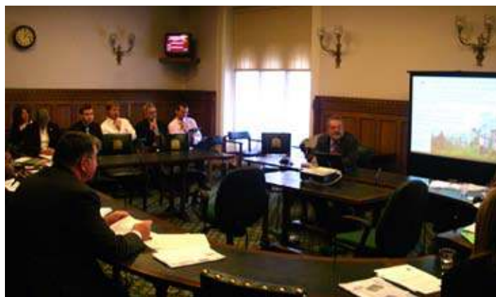
UKOTCF's Chairman gives a presentation on the biodiversity of UKOTs, and the need for more adequate resourcing by UK Government, to the All Party Parliamentary Group on Wildlife & Conservation, in a seminar organised with IUCN, April 2008.

Effective conservation rarely flourishes without supportive measures at policy level. The joint responsibility between UK and UKOT governments for environmental issues in the Territories, and the range of different UK Government departments with responsibility for activities which impinge on environmental matters in the UKOTs, provide particular challenges in this respect. A major advance was made through the development of the Environment Charters, which the Forum strongly encouraged during the drafting of UK Government's 1999 White Paper Partnership for Progress and Prosperity – Britain and the Overseas Territories . In September 2001, Environment Charters were signed by the governments of the UK and many UKOTs. These documents lay down the principles of good environmental management required to protect biodiversity and the natural heritage of the Territory concerned, to underpin sustainable development, and to fulfil