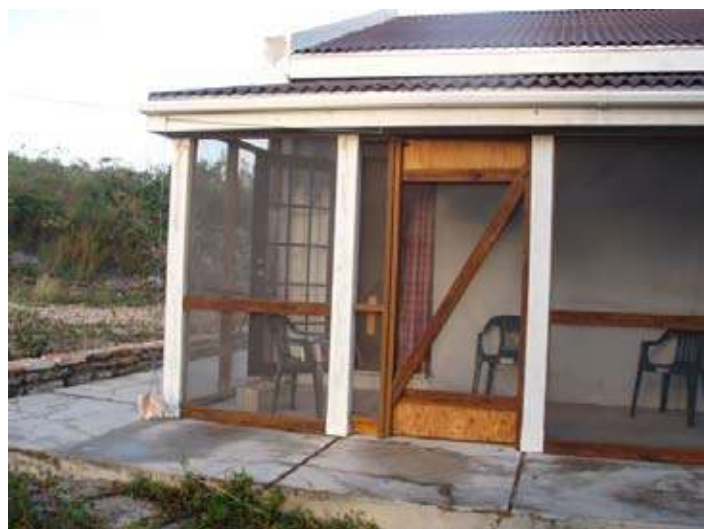
Residential side of the building, with its new insect screening. Part of the new wall to deflect water and mud slides is visible on the left.