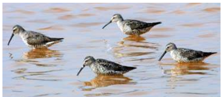
Stilt Sandpipers, on migration between arctic Canada and South America, at the internationally important salt-pans at Salt Cay, on which they depend to feed to fuel their flights.

Concerns are not limited to residents of TCI. National Geographic has placed TCI on a watch-list of countries whose ecosystems are being endangered by unsustainable tourism. Providenciales came 119th out of 121 destinations, lower than all its neighbours, and was rated as "in serious trouble". Comments included: "immediate eco-action is needed" to restore the damage; "rampant development" with "little attention to ecosystems"; "once a raw, romantic coastline, now a strip of mega-hotels on an increasingly crowded beach"; "some native islanders fear that development is at the expense of the Islands' identity and culture"; "the silver thatch palm exists only here and the Bahamas but the six-foot trees are the first things to go when bulldozers move in." Local residents feel unable to stop the devastation of their islands, and members of a current inquiry by a Committee of the UK House of Commons expressed concern at the number of complaints received from TCI residents regarding problems in local governance.