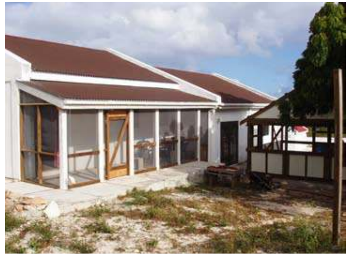
Before and after the work on the second visit. On the left, Judnel and Mary clear drainage, level the ground (as much as possible), glean gravel and set the level frame for the new decking. In both pictures, the accommodation part of the building is on the left and the display area on the right. In the right picture, the new veranda is nearly complete on the new decking. Looking through it, the infamous laundry and public washroom building can be seen a little way away.

it's completely disappeared; the only thing keeping the wheel on is the split pin through the wheel nut. Steve does what he can with a pair of pliers. A hire 'van' is organised, and TCNT staff member Edison is fetched as he has tools and access to some spare bits. Wall building is curtailed somewhat, as sand cannot be fetched except in a dustbin in the van. Nevertheless, after a couple of days hard work, a stone wall is completed with a small storm drain which should do the job.