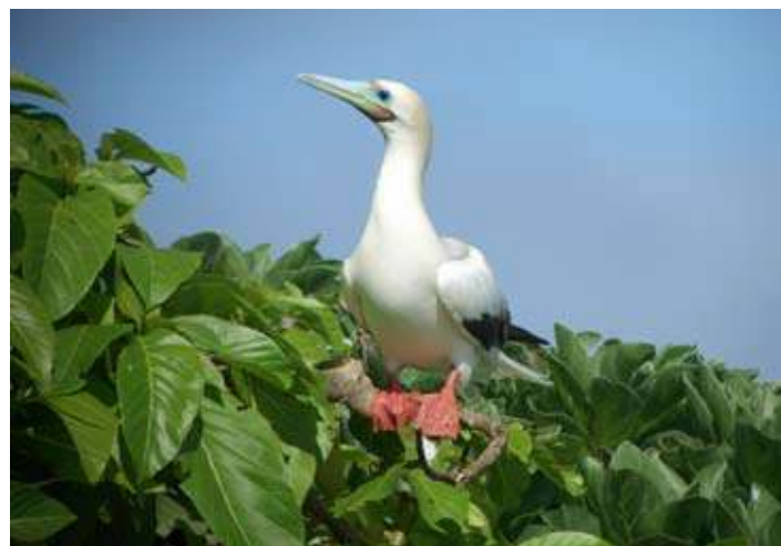
An adult Red-footed Booby on the nest

By extrapolating data from 116 10m x 30m quadrats, it has been calculated that, in May 2005, there were a total of 4370 breeding pairs of Red-footed Booby Sula sula , and, in November 2007, from 105 similar sized quadrats, a total of 203 breeding pairs. On both expeditions, nest-building, egg-incubation, small helpless chicks, large independent chicks and recently fledged juveniles were found. These results indicate that, in the Chagos, Red-footed Boobies breed throughout the calendar year, with a peak in productivity between January and July. This has implications when calculating breeding populations in the Chagos of this species, based upon counts from one visit (repeated annually in the same month). It is possible that previous estimates of the breeding populations for this species from throughout the Chagos have been underes-