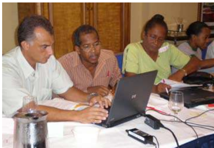
Workshop in which Montserrat's pioneering experiences in economic valuation was discussed with other UK Overseas Territories

amounts. The responses reveal the strength of people's preferences for different characteristics of the Centre Hills. A total of 342 respondents completed the questionnaire, which constitutes 10% of the adult population. The results show that Montserratians are willing to pay significant amounts to address the following ranked scenarios: 1. Control invasive species; 2. Protect native species; 3. Maintain trails in the Centre Hills; 4. Conserve forest cover.