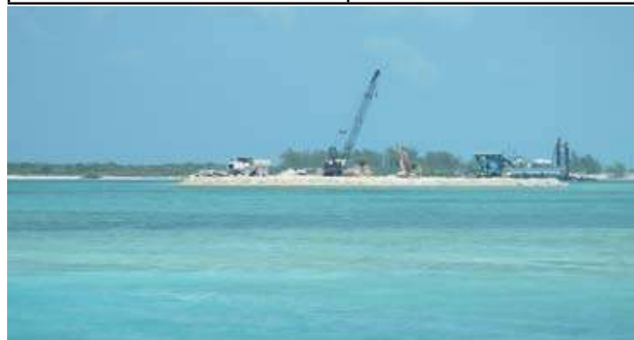
Artificial island being created by pumping dredgings on to the sea-grass beds in the Princess Alexandra National Park, adjacent to the Nature Reserve islands (behind workings and out of view near camera position).