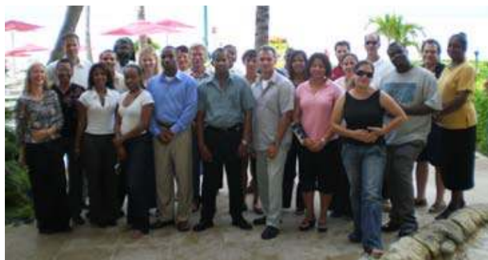
Participants at the economic valuation workshop in Grand Cayman.

Environmental Economics with the UK Overseas Territories in the Caribbean (EEWOC) is an