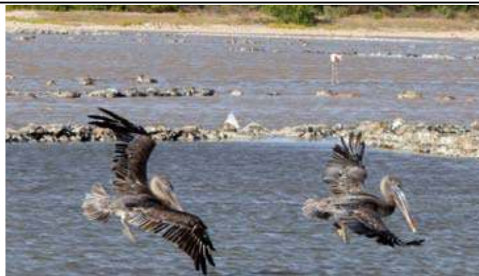
Brown Pelicans and Flamingos feeding on Town Salina, Grand Turk in the middle of the capital. Like other salinas, it is being in-filled, so that the birds will not be able to use it.