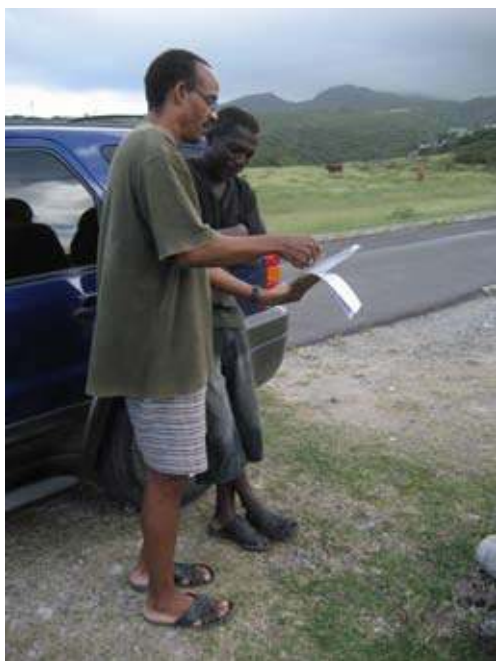
Survey work carried out in the Centre Hills

From mid-November to mid-December 2007 a 'choice experiment' survey was conducted to estimate the values of services provided by the Centre Hills. In the choice experiment questionnaire, respondents were asked to choose between three alternative policy scenarios costing different