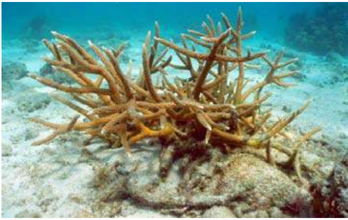
Acropora cervicornis, the Caribbean staghorn coral, now greatly depleted throughout its range.

developed a comprehensive source of identification for the main reef occupiers and builders of Caribbean reefs, namely corals, soft corals and sponges. This was a cross-territories project and the result was 'Coralpedia'.