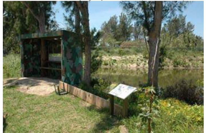
The reserve pond, bird blind and interpretive sign at Buy Back Bermuda's new nature reserve at Somerset Long Bay

The Society decided to approach the Bermuda National Trust for support, and formed the "Buy Back Bermuda" campaign. The response by the community was immediate and generous. Within eighteen months, well ahead of our three-year plan, we not only attained our goal but also overshot it with enough extra funds to provide an endowment for long-term maintenance and seed money for another project. The Bermuda Government was likewise inspired to contribute $300,000 towards the purchase price of the reserve because, lying adjacent to the public beach park, it