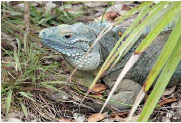
Endemic Grand Cayman Blue Iguana at the Botanic Gardens, one of the field-visit options during the conference.