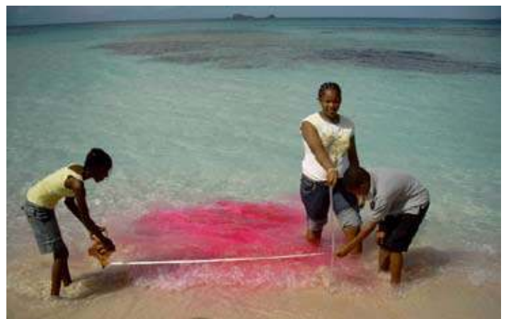
BVI Sandwatch team measure current speed with dye.

to foster a real sense of community within its members. Project participants world wide often have their data and photographs posted on-line within 24 hours of it being emailed to us. Their data is posted on their own "national homepages" within the overall Sandwatch Website ( www.sandwatch.org ). These home-pages are also theirs to customize as they see fit, and often contain additional information on their local school, community, culture and related environmental projects that they may be involved in.