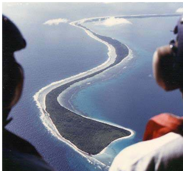
Barton Point Important Bird Area, a bird's eye view looking south. The Red-footed Booby colony extends along both shores past the limits of the photograph.

timated. The May 2005 Red-footed Booby breeding population at Barton Point exceeds the qualifying criteria of 3000 breeding pairs of this species required for Important Bird Area status.