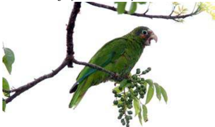
Grand Cayman's endemic subspecies of parrot, on the Mastic Trail, one of the field-visit options during the conference.