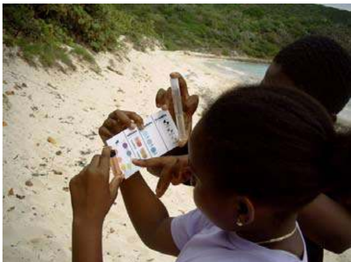
BVI Sandwatch team test sea-water for contamination.

One of the main strengths of the Sandwatch programme is its ability