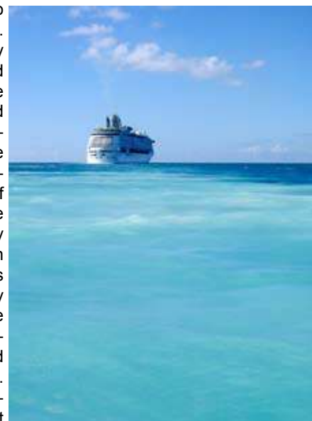
Sedimentation plume following the passage of a mega cruise ship in Bermuda's North Channel.

The project is of immediate interest due to the increasing ship traffic and renewed use of an existing channel on the outer rim of the lagoon, referred to as the North Channel. This passage is rarely used, and has remained for this reason a pristine coral reef. Its proposed use for larger ships involves widening of the channels, as well as cutting through sections of the reef. The alternative proposal is to modify the well travelled South Channel, which has been exposed routinely to sedimentation – to the extent that coral species have adapted and composition has altered. This alternative proposal attempts to restrict sedimentation effects to one already impacted passage, rather than