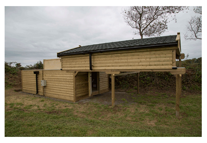
The new Sark Observatory, with the roof closed in the first photo, and open in the second.