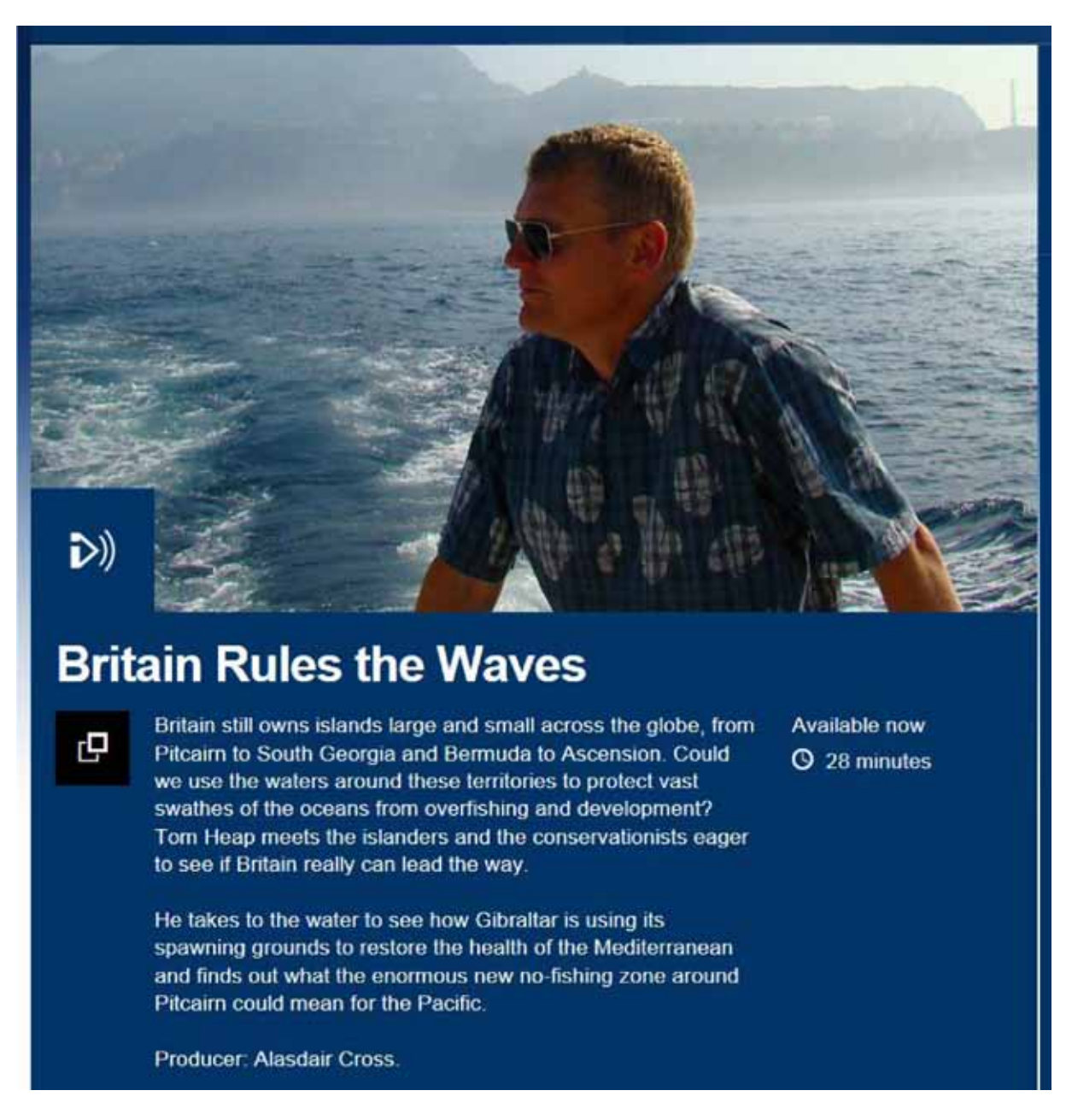
Costing the Earth - Britain Rules the Waves: BBC iPlayer

In September 2015 Gibraltar's Environmental Research and Protection service was featured in the BBC Radio 4 programme Costing the Earth . The programme, made at UKOTCF's suggestion during the conference, investigates the work being undertaken by the Gibraltar Department of the Environment to protect marine habitats and prevent overfishing in Gibraltar's waters. New Marine Protection Regulations have allowed the Territory to push forward with ambitious marine projects, and the implementation of effective patrol and enforcement measures is helping to secure a sustainable future for its marine resources. The programme is available to listen to here: <a href="http://www.bbc.co.uk/programmes/b069rvb8">http://www.bbc.co.uk/programmes/b069rvb8</a>