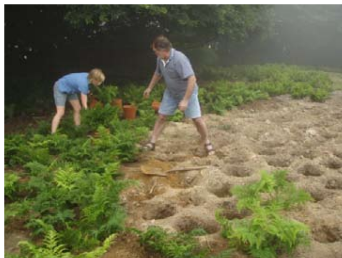
Restoration site on Green Mountain.