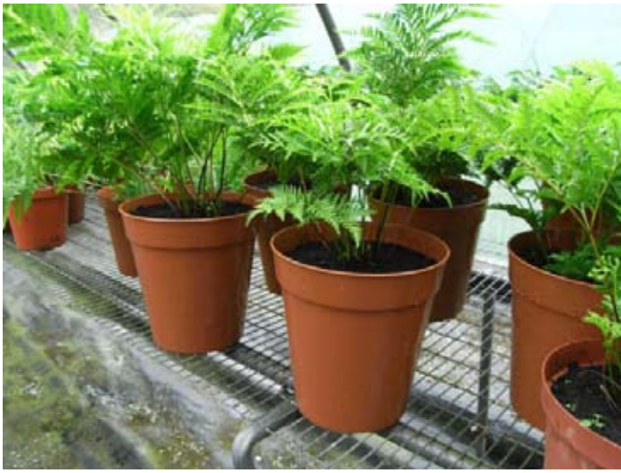
Pteris adscensionis in cultivation at Green Mountain nursery