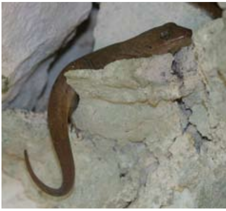
Caicos Barking Gecko, an endemic species thought to be extinct until rediscovered as part of the work co-ordinated in TCI by UKOTCF to underpin conservation and the development of trails, visitor centres and other interpretation, to provide the basis both for eco-tourism and education.

evidence, which led to Defra's welcome change of position and increased funding from them to JNCC for UKOT work.