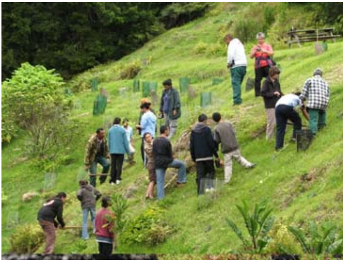
Prince Andrew School students learning how to plant critically endangered endemic trees.