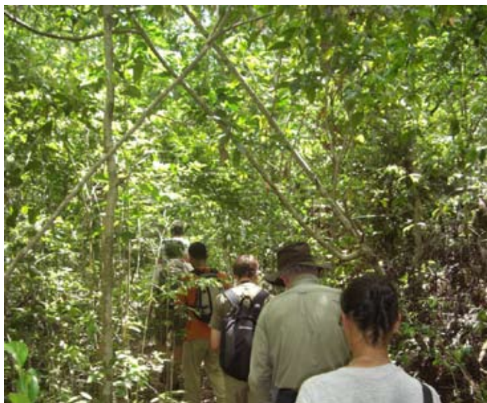
The conference field-visit to the Mastic Trail

The Mastic Trail Reserve represents part of the only remaining subtropical, semi-deciduous dry forest on Grand Cayman. Many rare endemic species such as the ghost orchid can be found there. The National Trust for the Cayman Islands has devoted considerable effort to maintaining and safe-guarding the trail. At present, 754 acres are managed by the Trust, forming the Mastic Reserve. The trail is thought to have been used as a passage around the dense mangrove wetland that forms most of the interior of the island. Before the development of the coastal roads, the trail was used as a major thoroughfare. After this time, the trail became overgrown as alternative transport routes were found. The National Trust received some funding in the early 1990s, which meant that some work on clearance and restoration could begin. In April 1995, His Excellency the Governor, Mr Michael Gore, opened the trail to the public. Mr Gore was thrilled to return to the Trail with the conference party to enjoy it as a visitor.