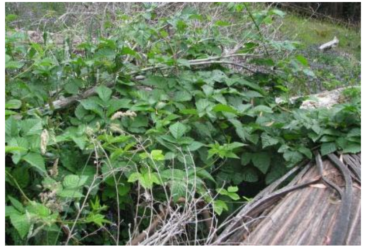
Vigorous growth of Loganberry Rubus loganobusacc

The once productive orchard appears to be in an advanced state of decline with many trees dead or dying. The main reason seems to be the old age of the trees and a long history of neglect; there has been no pruning for many years, if ever, and the fruit on the remaining apple trees were very small, probably as a result of this. In addition, woolly aphid and mealy bugs occur and probably weakened the trees further, although individuals that were still alive displayed lush foliage.