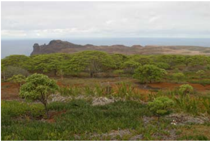
The Millennium Forest on St Helena, a local initiative with support from many partners. This is well on the way to making the survival of the endemic Gumwood secure. St Helena has many species (and even genera, the next highest classification) of plants and invertebrates which occur nowhere else in the world. Local effort, small project funds from HMG and lots of help from NGOs has demonstrated the practicality of conservation actions. What could be done if real recovery funds were available?

The Governor of Anguilla sought confirmation as to whether the UKOT natural environment remained a high priority for UK Government, in view of some signs that this might not be the case.