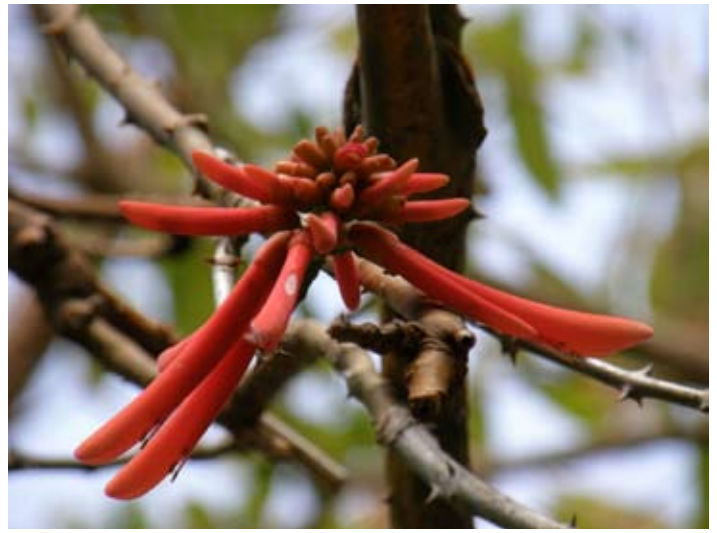
Cockspar Erythrina eggersii

including several endangered endemic species such as the Cockspar Erythrina eggersii , Thatch Palm Coccothrinax alta and the Sour Prickle Pear Opuntia rubescens . On the steep slopes of Little Jost, the research team discovered the Simple-leaf Bushweed Flueggea acidoton , a new species for the Virgin Islands. Alongside development, the island's enormous population of free-roaming goats are the primary agents of change for the island's vegetative communities. The subsequent erosion caused by unfettered goats pose a serious threat to many of the island's plant species.