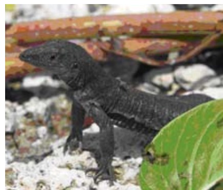
The Black Lizard, endemic to Sombrero, Anguilla, mid-way to BVI, still survives, as do other endemic species and important seabird colonies there. There is always pressure from inappropriate developments in the small and sensitive areas of the UKOTs and CDs. Much progress has been made by HMG and UKOTCF

These changes seem unfortunate, especially at a time when JNCC staff have remarked on their capacity being inadequate to manage all the funds that they have been awarded for work in UKOTs – and as the document indicates that FCO's staffing in this area, heavily reduced in 2006, has been further decreased from one post to 0.5. To make best use of limited resources, it would be valuable to involve those organisations with most experience in this area, and UKOTCF looks forward to being able to make a positive contribution in future, so that its 20 years of work can be built upon. In this context, UKOTCF is encouraged by the Minister's answer to an enquiry at the Cayman conference that UKOTCF and its mainly NGO network will have a strong role in helping to co-ordinate future work. Given the scale of the environmental challenges faced by the UKOTs, a good deal of work will be required to turn the new policy document into a strategy that will meet fully the needs of the Territories. UKOTCF remains happy to assist in this, in line with the Minister's comment, and looks forward to possible support from the increased resources to continue its highly valued work.