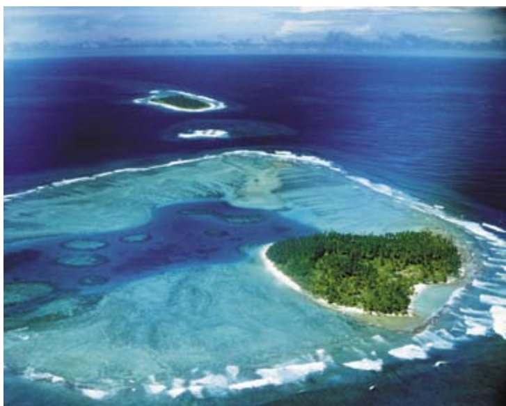
Middle Brother, one of the myriad islets of the Chagos Archipelago

Because it is so remote and relatively undisturbed, BIOT has some of the cleanest seas and healthiest reef systems in the world,