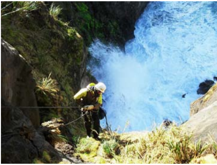
Tristan Conservation Officer Norman Glass descending cliff

the planned future mouse eradication include the capture and captive care of the critically endangered Gough Bunting and endangered Gough Moorhen. Without captive populations, both species could be at risk from an eradication operation.