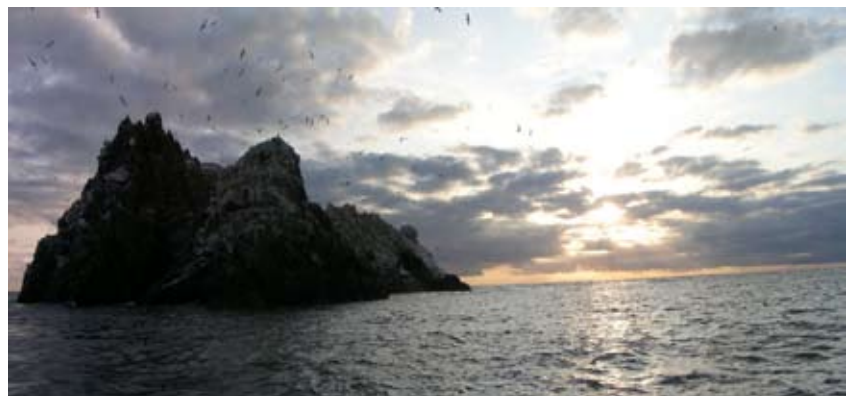
Despite their small area, the tiny islets of Les Étacs (pictured here at sunset) and nearby Ortac, off the coast of Alderney, support around 2.4% of the world's population of gannets.

Visit the AWT website: www.alderneywildlife.org