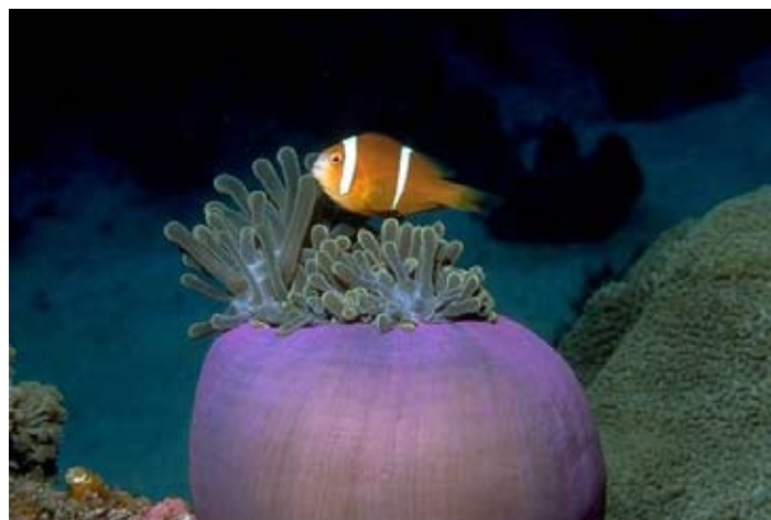
A Clown Fish, endemic to the Chagos, over coral

The Chagos Archipelago is a very special and very rare place – a relatively unpolluted and undisturbed part of the ocean, with