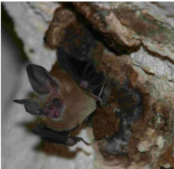
Big-eared Bat at roost in the internationally important cave system in Middle Caicos, Turks & Caicos Islands. TCI Government volunteered to develop the pilot strategy to implement the Environment Charters, an exercise which UKOTCF facilitated.

In further exploring the way forward, the 2nd September meeting confirmed that, despite the various changes that had occurred within individual Departments in the years since the Environment Charters were signed, HMG remained very conscious of the Charters and their importance. Reference to the Charters provided a valuable means of assessing proposals for targeted work in the Territories (e.g. under OTEP); in this context, further facilitation work to develop local strategies for Charter implementation could be useful, including to help assess projects against a Territory's own priorities - the preferred approach of both HMG and UKOTCF. It was important for the Territories to lead the Charter process.