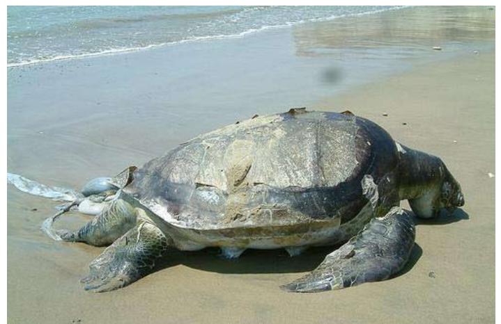
Dead male Green Turtle at Curium beach, 27 August 2009

David and Linda Stokes, coordinators of Episkopi Turtlewatch Email: info@episkopiturtlewatch.com