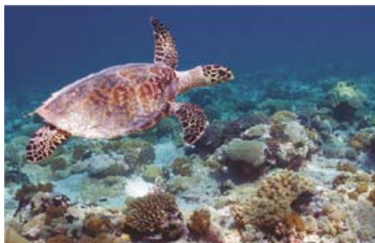
A Hawksbill Turtle swims in the clean sea of the Chagos.

oceans benefiting from full protection." The consultation presents three broad options for an MPA. The first involves the declaration of a full no-take marine reserve for the largest area possible. The other options offer more limited protection, or relate to a smaller area.