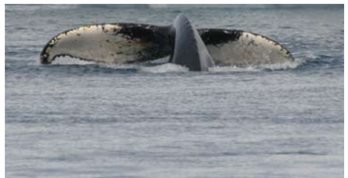
Humpback whale

other species. It is hoped that contacts with other MOU signatories, including Australia and New Zealand will assist in follow-up surveys and exploring opportunities for responsible whale-watching as part of a developing tourism industry on Pitcairn.