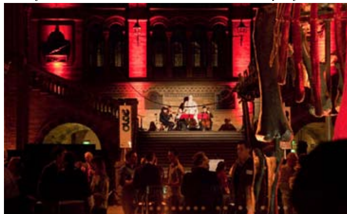
At the launch of IYB-UK, on the 150th anniversary of the publication of On the Origin of Species, musicians under the statue of Charles Darwin entertain the participants below the dinosaur skeleton at the Natural History Museum, London.

UKOTCF would like to encourage its partners in the Overseas Territories and Crown Dependencies to mark the International Year of Biodiversity (and the annual International Biodiversity Day, on 22nd May) with their own local awareness raising activities. Please let us know what you have planned: oliver@dipsacus.org For information on IYB-UK, visit: www.biodiversityislife.net