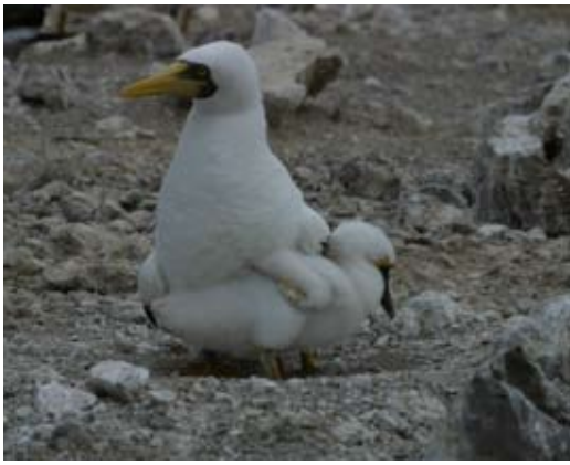
Masked Booby and chick on the main island of Ascension, 2004. From its formation in the 1980s, UKOTCF made many attempts to find resources to re-establish on the island seabirds restricted to offshore stacks because of

introduced cats on the main island. Funding was finally secured by FCO, and then UKOTCF Member RSPB took the lead, later handing over to the Ascension Conservation Department (established as part of the same process). This remains the only occasion on which major recovery funding was provided by HMG, this being secured because an FCO-funded non-environmental project could not proceed.