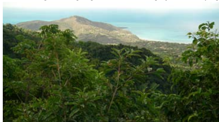
The vegetation and soil of Montserrat's hills provide the island's main water reservoir (as is the case for some other islands, such as St Helena). Work on biodiversity conservation and ecosystem services is based on long co-operation between Montserrat government and NGOs, working with UK bodies, from the FCO/UKOTCF biodiversity survey project of 1995, through emergency work by outside bodies coordinated initially by UKOTCF after the start of volcanic activity, to the current collaborative work on the Centre Hills.

In the UKOTs, environmental sustainability is typically threatened by habitat destruction and degradation of ecosystems (generally due to built developments), invasive species, over-exploitation of natural resources and other factors. These threats, combined with the lack of resourcing noted above, mean that endemic species are still being lost, despite pilot work in small projects identifying