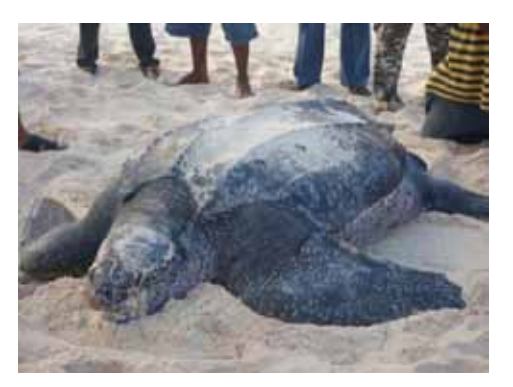
The leatherback turtle in Anguilla.

This recent news article demonstrates the importance of global efforts and a consistent conservation strategy to protect sea turtle populations. Nearly eight years ago a female leatherback turtle nested on Captain's Beach, Anguilla, and an identifying tag was put on one