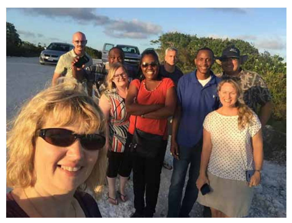
Participants at the GIS remote sensing workshop, in TCI.

More information about the project can be found at: https://www.gov.tc/pressoffice (scroll to entry for 15 June 2017) and photos of the workshop at https://www.facebook.com/naqqi/posts/10154766272057362