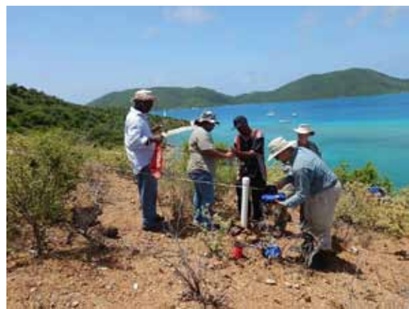
Vegetation monitoring workshop. Photo: NPTVI

https://www.facebook.com/pg/NPTVI/photos/?tab=albums