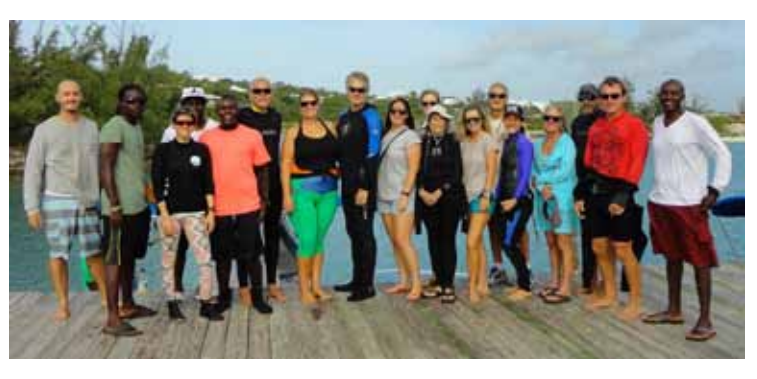
The participants in the AGRRA training in TCI.

Nine volunteers for the Turks & Caicos Reef Fund (TCRF) and six staff from the Department of Environment and Coastal Resources completed a week-long training course on coral reef monitoring last week. Three trainers from the