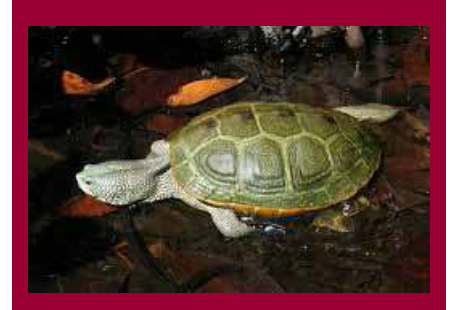
The diamondback terrapin is now protected under the new legislation.