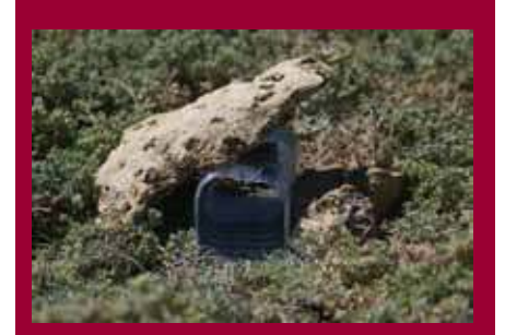
Rocks are used to hold the bait stations (made from recycled plastic bottles) in place.