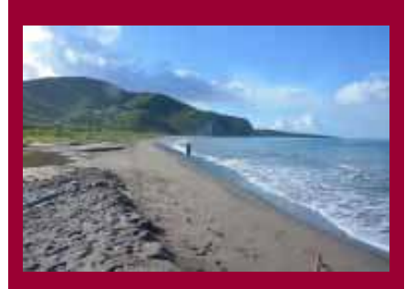
Isle Bay Beach

Study of Isle's Bay Beach - relating to sand mining