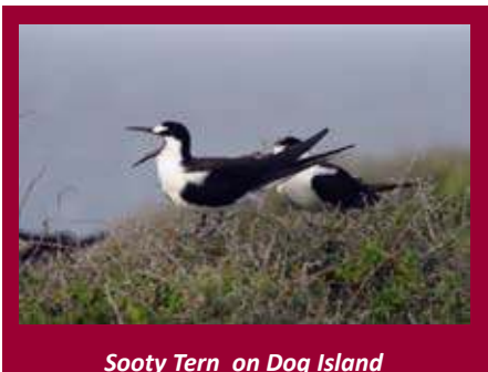
Sooty Tern on Dog Island