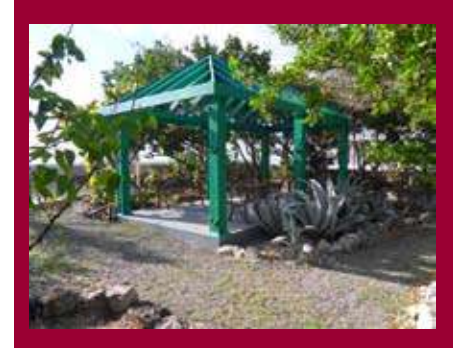
The Ramada in the Botanic and Cultural Garden

the development of the cruise ship dock on Grand Turk, and the need to raise local awareness of the importance of the salinas, the bird tours were seen as providing a facility for tourists, and well as raising local appreciation of their importance. Lack of completion was not due to shortage of enthusiasm, but simply of funding. There was never enough funding to get the project "off the ground" despite the donation of many days of work by UKOTCF.