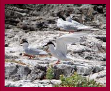
Roseate Terns were found breeding on Big Sand Cay on the Turks Bank