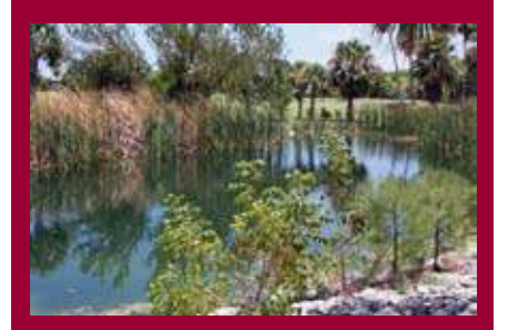
The pools on the Provo Golf Course provide good bird watching opportunities