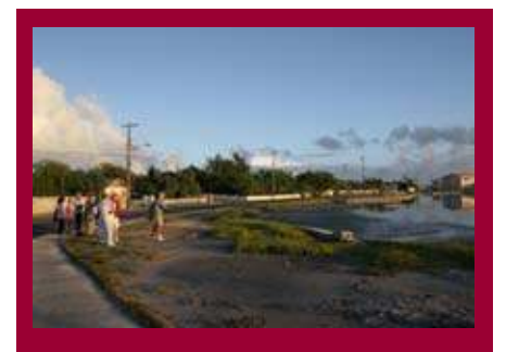
Grand Turk Bird Walk Tour being tried out in February