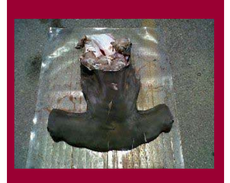
Hammerhead shark head in Cayman market

Hammerhead Shark meat sale causes concern