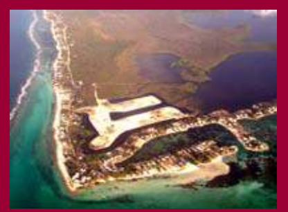
Area of cleared mangroves, Grand Cayman