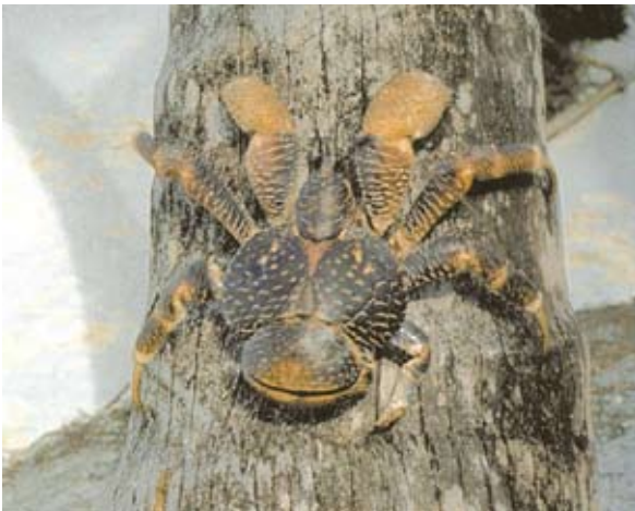
Endangered Coconut Crab, Chagos Archipelago. Many respondents to the consultation noted the urgent need also for ecological restoration and conservation on the land areas.

"I have taken the decision to create this marine reserve following a full consultation, and careful consideration of the many issues and interests involved. The response to the consultation was impressive both in terms of quality and quantity. We intend to