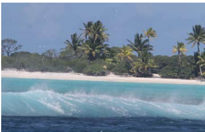
One of the smaller waves crashes on to the reef surrounding Oeno Island.