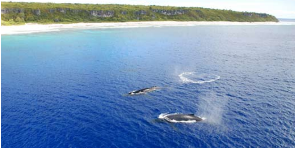
Humpback Whales close to Henderson Island.

Pitcairn now has a buzz and dynamic atmosphere. The Islanders produce some of the best honey in the world (which can be purchased online or from Fortnum and Mason's), and have thriving arts and crafts industries, selling on cruise ships and through their websites. We look forward to continuing to work with them on helping to conserve their unique wildlife which, together with their cultural heritage, is the basis of the future economy and well-being.