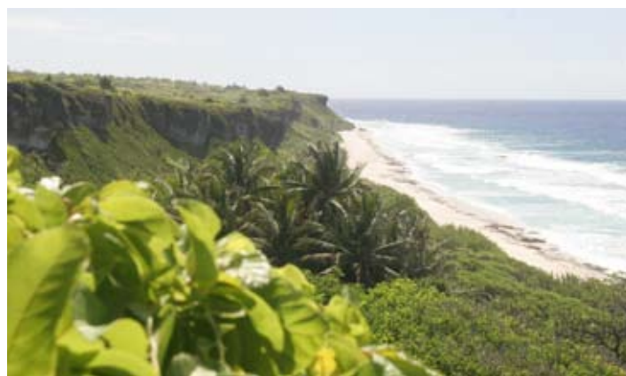
The plateau (raised atoll) at the north end of Henderson Island, above the reef, beach and beach-backing vegetation.

RSPB and partners are preparing for an operation to eradicate rats from Henderson Island. This project will provide resources to employ and equip the leaders of an expert eradication team. If the operation is successful, it will contribute to preservation of the island's World Heritage status and secure the long term future of Henderson's endemic wildlife and breeding seabirds which are threatened by Polynesian rats through predation, competition for food