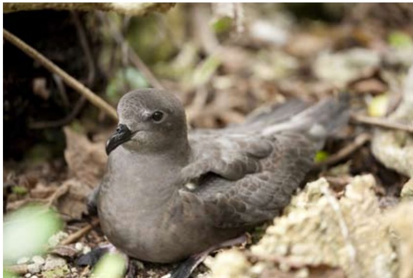
Henderson Petrel on its nesting grounds on Henderson Island.

Even though Henderson Island is one of the world's most remote and hard-to-reach places, its wildlife is under severe threat from the impacts of invasive Pacific rats Rattus exulans . Nesting seabird numbers have already dropped from an estimated 5 million pairs before rats arrived, to only 40,000 pairs today.