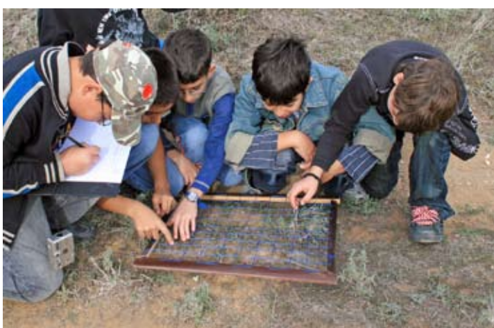
School students look at the exhibits at the Centre and participate in the botany educational programme.