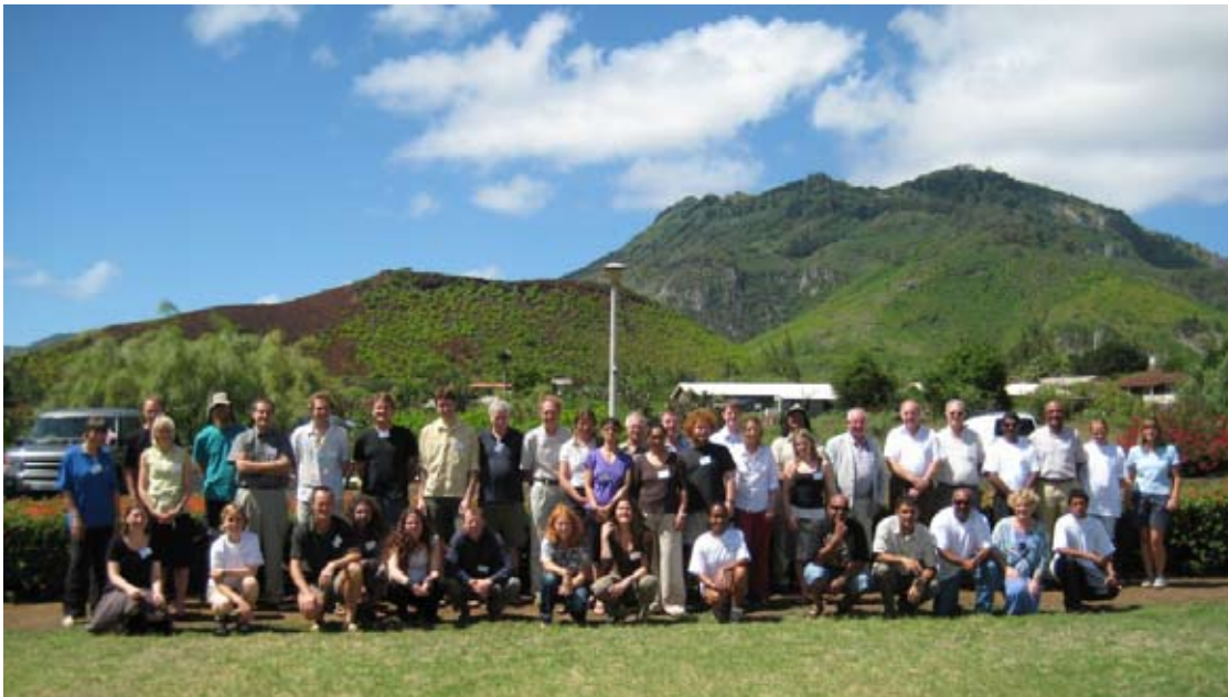
SAIS Strategy workshop attendees on Ascension Island.

to work in the South Atlantic UKOTs, and I hope to be involved in many other successful projects in the coming years.