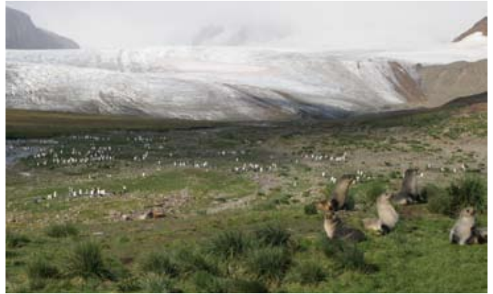
Glaciers, mountains and coastal inlets divide South Georgia into smaller "islands" of unglaciated land.

With the clock ticking, over the last five years, the South Georgia Heritage Trust has been co-ordinating studies, developing plans and raising funds for rodent removal. Proposals have been submitted to the Government of South Georgia & the South Sandwich Islands for approval, which was conditionally granted in early June 2010. The Operational Plan for 2011 seeks to eradicate rodents from Greene and Thatcher Peninsulas, and a headland west of Mercer Bay, three blocks of land on the north coast of the island. From a logistics base to be established at Grytviken, the work is to be