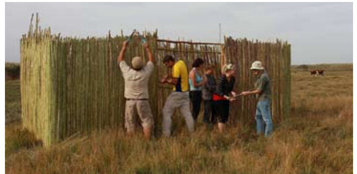
University students building a bird hide with reeds.

Akrotiri Environmental Education & Information Centre, 4640, Akrotiri village, Cyprus. Tel.: +357 25826562; Fax: +357 25826563; akrotiricentre@cytanet.com.cy; www.english.akrotirienvironment.com