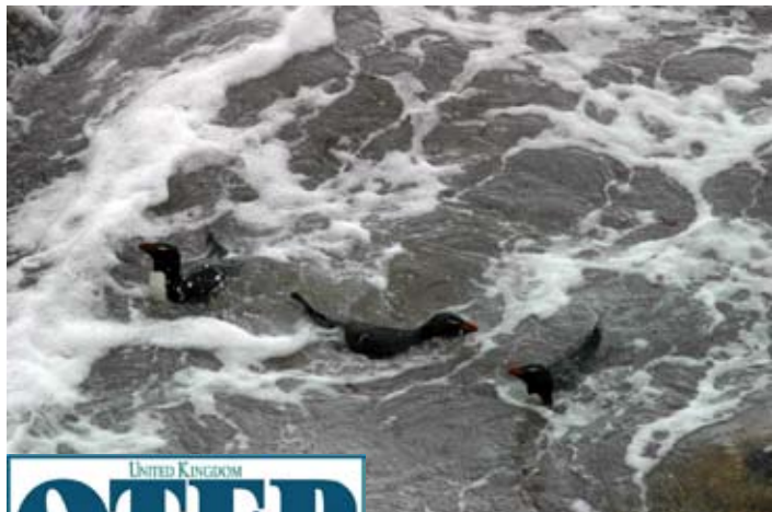
Rockhopper Penguins swim at New Island, Falkland Islands.

This project will produce a Species Action Plan for the southern rockhopper penguin in the Falkland Islands. It will progress priority conservation actions for this Vulnerable (IUCN 2009) seabird, with its rapidly declining populations, and will address recommendations from the International Rockhopper Penguin Workshop (2008) that have implications across its breeding range. The capacity of Falklands Conservation to advise government and industry on mitigation measures and undertake direct conservation activities will be substantially enhanced.