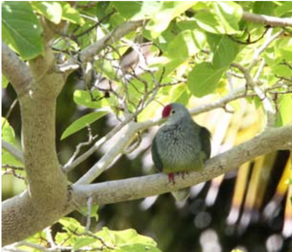
Henderson Fruit Dove (left) and flightless Henderson Rail, two of the Island's endemic bird species