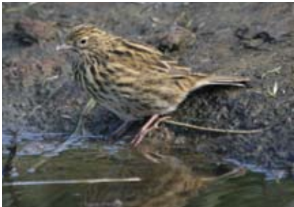
Endemic South Georgia pipit.

Careful studies have suggested that it is feasible technically to rid South Georgia of rodents. In recent years, the size of islands on which eradication projects have been successfully undertaken has gradually increased. South Georgia is many times larger than any other tackled to date,