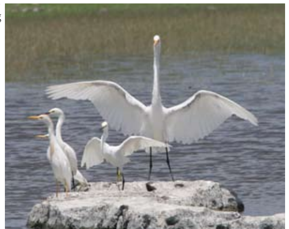
Great, Snowy and Cattle Egrets at North Wells, Grand Turk - one of TCI's important wetlands.

Bird Monitoring - Establishing a regular bird monitoring programme for TCI, including outreach to encourage public volunteer monitoring efforts.