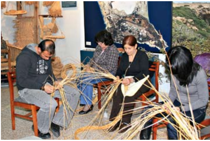
Basketry lesson at AEEIC.

At the same time, the Centre is open to visitors, Cypriot and international, who have a chance to find out about the unique wildlife and historic value of the area. The Centre is also participating in European programmes, such as Leonardo da Vinci, where University students and others, from Cyprus and other European countries, share practical experiences and skills in many disciplines, including conservation, culture, forestry, and archaeology. The focus of all these programmes is conservation within the SBAs, integration with the local community and promotion of European values and culture.