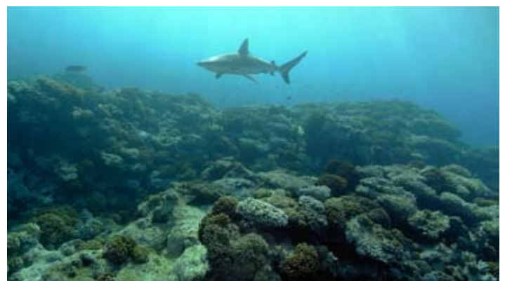
Gray Reef Shark patrols over the coral reef and below SV Southern Cross, Ducie Island.