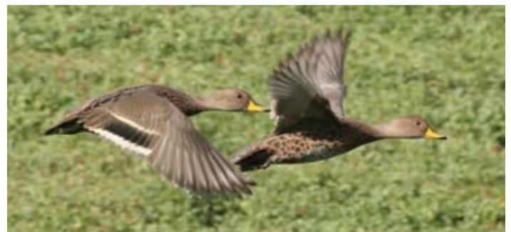
Pair of endemic South Georgia pintails.

The Environmental Impact Assessment can be found at: http://sgisland.gs/download/SGHT/EIA.pdf