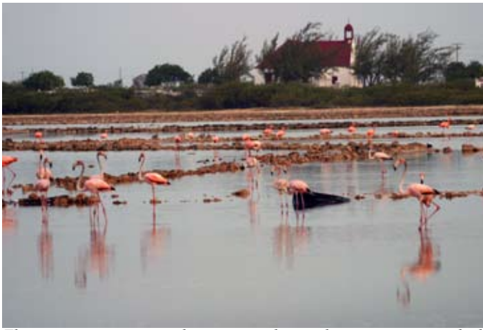
Flamingoes are amongst the many resident and migrant species which depend on the Grand Turk Salinas and other internationally important wetlands in TCI.