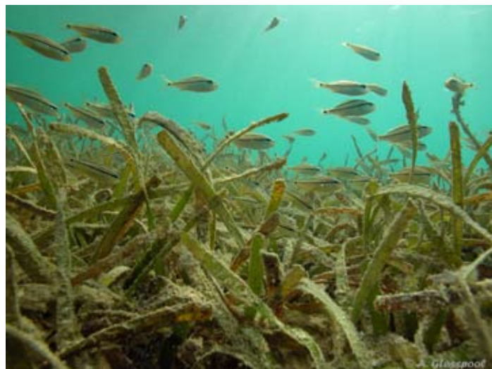
Seagrass meadow, Walsingham Bay, Bermuda.