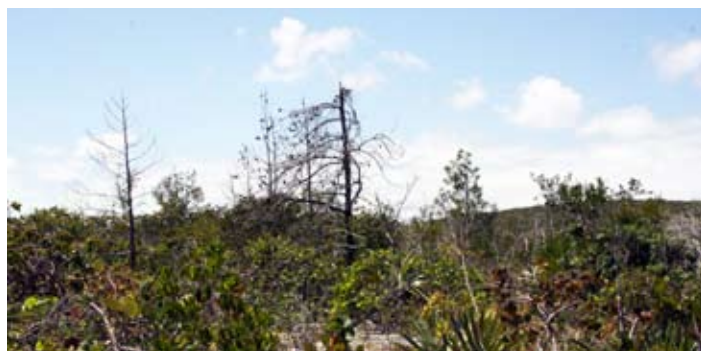
Caicos Pine trees killed or damaged by the introduced pest, Middle Caicos.