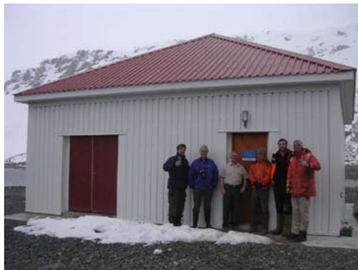
Opening the South Georgia Quarantine Store.