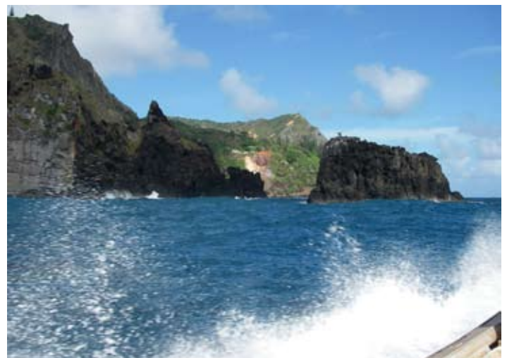
Adamstown and Bounty Bay come into view, as the longboat rounds the rocks.