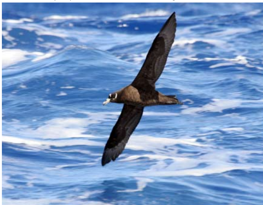
Spectacled Petrel, one of two bird species breeding only on Inaccessible Island, and of several only on the World Heritage Site of Gough and Henderson Islands, Tristan da Cunha. More funding is urgently needed for conservation work to safeguard the unique wildlife of this Site.

Aware of the lack of in-house expertise on UKOTs/CDs available to the Department, and of the new Government's wish to make more use of NGOs, UKOTCF remains available to assist DCOMS with consideration of proposed additions to the TL and to promote World Heritage status for UKOT/CD sites.