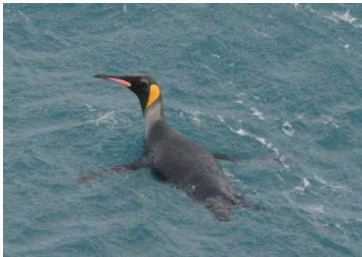
King Penguin in feeding areas at sea off South Georgia.