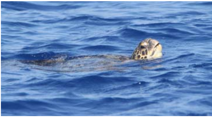
Green Turtle at sea off Oeno Island

about the challenges the island faces, and how enterprising Pitcairners are working to address issues. A major constraint is the small number of people available to undertake work and projects. There are currently just over 50 people living on island, and everyone we met had at least two jobs. Another constraint is the high cost of transport of people and freight, and the infrequency of transport links. Currently, a visit overseas means a long absence from Pitcairn.