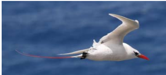
Red-tailed Tropicbird at the breeding colony on Pitcairn Island