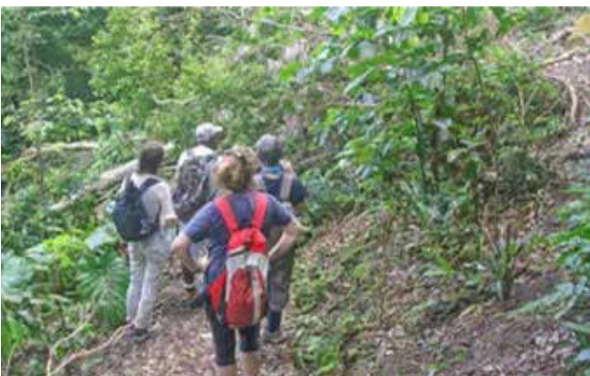
Blockages on the Oriole Trail caused by trees felled by Hurricane Irma.