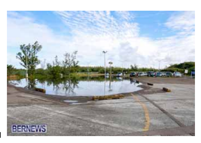
High tide flooding in Bermuda, on November 4th.

high tides due to eddies in 2002 and 2011 as well. This happens when a warm eddy spins off the Gulf Stream and surrounds the island; warm water takes up more space, so tides rise. However, this current flood situation has lasted longer than previous occurrences. David Wingate noted that the 2002 event raised the water-table enough to drown the old Bermuda cedars in Paget Marsh, so it will be important to see what effect this one has on habitats. The usual consequence of a hurricane is actually a fall in sea temperature for a short time; the low pressure centre causes upwelling of colder deep ocean waters.