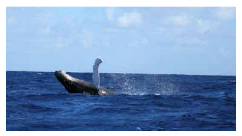
Humpbacked whale, Salt Cay.

Salt Cay was severely impacted, and struggled for many days with desperately short supplies of food and freshwater. A huge community effort, overseas fund-raising, aid from the UK military and TCIG, and reconnection to power supplies after 60 days (thanks to hard work by the Fortis team) has seen Salt Cay well on the way to recovery. Coral Reef Grill and Bar, Salt Cay Divers, and other local enterprises and accommodations are open for business. The humpback whale watching season is just around the corner, in January and February, so then would be an excellent time to visit. See the Spotlight on Salt Cay Facebook Page, Salt Cay Divers Facebook page, or email scdiivers@tciway.tc for information.