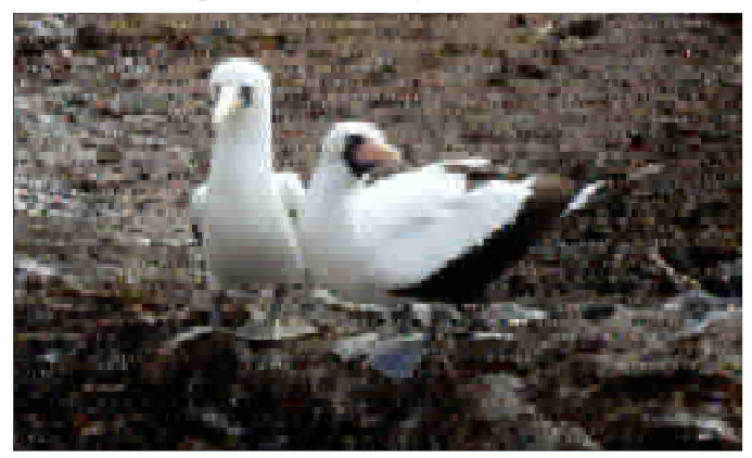
Masked Boobies. One of the most major UKOT conservation successes, the re-establishment of globally important seabird populations on Ascension, is among the projects threatened by UK Government's proposed U-turn

We reproduce also a statement by HMG. This does not appear to answer the question as to why HMG considers that the