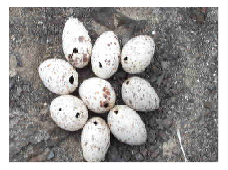
Eggs predated by Myna. The birds destroy many more eggs than they eat.

Tel. +44 1980 843 467 Wideawake@rasuk.org.