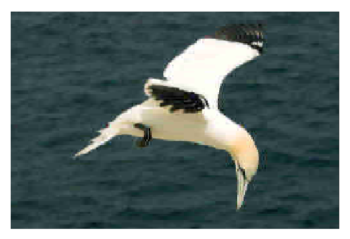
Gannet at Ortac within Alderney's new Ramsar site