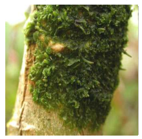
The endemic liverwort, Dendroceros adglutinatus on a branch of the endemic black cabbage tree Melanodendron integrifolium

studied. The survey has shown that the bryoflora is more diverse than previously thought, though not notably rich (which is hardly to be expected on such a remote island). The present survey has so far added nearly 70 species to the flora, at least four of which are new to science. The collections may well reveal more.