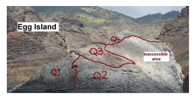
Egg Island one of the offshore islands monitored on a monthly basis by boat, with some counting areas marked

The purpose behind this project was to establish information of the breeding season of the seabirds around the island, along with the population status. Running parallel with this