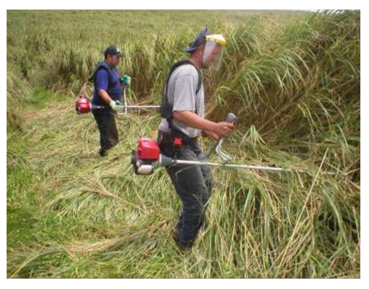
Field workers clearing the overgrown paths. At one time this would take the islanders weeks to dig out; now with the equipment purchase under the OTEP project it takes only days.

In May 2001 the same hurricane that hit Tristan also caused severe damage on Nightingale island, 24 of the 46 camping huts (shacks) were destroyed and debris covered the NE side of the island and landing area. The Tristan Government asked for assistance to help clear the rubbish which consisted of plastics, wood, roofing material etc, but we were unsuccessful and little could be done with its small boats, without help from outside the island. Then in 2004 we received funding from the Overseas Territories Environment