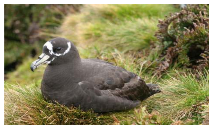
Spectacled Petrel, Inaccessible Island

A repeat of the 1999 census was conducted in 2004, by Peter Ryan of the University of Cape Town, in an OTEP-funded