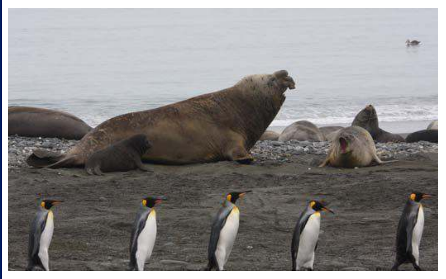
(King penguins march past elephant and fur seals, Salisbury Plain, South Georgia)

The Government of South Georgia and South Sandwich Islands (GSGSSI) has announced the establishment of a large sustainable use Marine Protected Area (MPA) covering over 1 million \rm km^2 of the South Georgia and South Sandwich Islands (SGSSI) Maritime Zone.