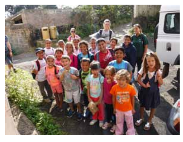
Ascension Explorers on an excursion

The summer months have been busy on Ascension Island, with the Conservation Department holding summer activities for children to enjoy during their holidays. The idea behind these is to encourage a greater awareness of the island's incredible fauna and flora. Many photos of the children enjoying the 'Ascension Explorers' activities can be found on the Conservation Department Facebook page which can be accessed via the following link:www.facebook.com/AscensionI slandConservation/?ref=page_internal