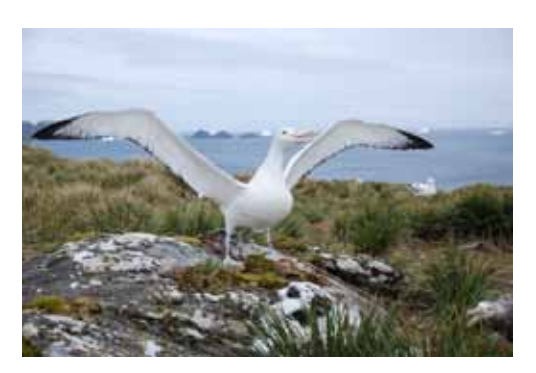
Male wandering albatross

The journal Biological Conservation has recently published a review of threats and conservation actions required for the 29 albatross and large petrel species that are covered by the Agreement on the Conservation of Albatrosses and Petrels (ACAP). The study indicates that there were declines in the global population numbers in 38% of the species, between 1993 and 2013.