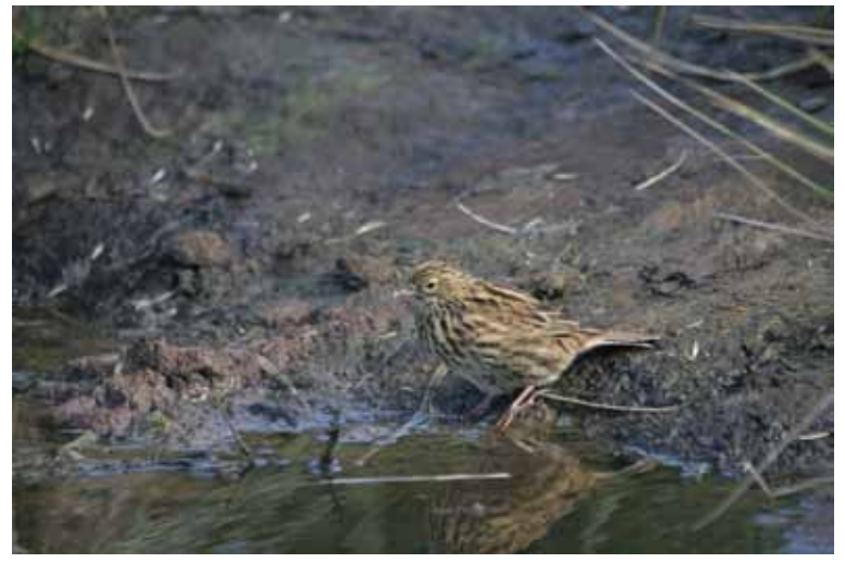
South Georgia Pipit, with tiny food item from the water

The population numbers approximately 3000 to 4000 pairs at present. Food sources consist primarily of invertebrates, including small insects and marine invertebrates from the tideline. The latter source is consumed particularly when the ground is covered in snow.