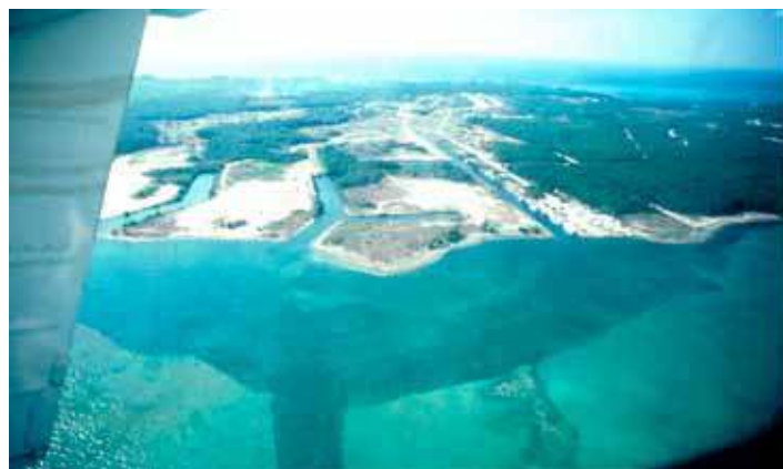
A common Caribbean threat to biodiversity and ecosystem services: built development destroying land and marine ecosystems, in this case at Grand Cayman.

Project activities are aimed at two problems, which will be addressed by an integrated approach. One consists of the threats to critically endangered ecosystems and the other is the lack of alternative types of economic development to high-impact ones (including tourism). This project will forge a dual path to biodiversity protection through management of protected areas and stimulation of land-based eco-tourism which is currently under-developed. The elements which constitute this project have been piloted in the BVI, CI and TCI. Each territory will be able to build on these, enhanced by the sharing of expertise and training between the environmental trusts located in the three countries. Linkages will be facilitated by UKOTCF.