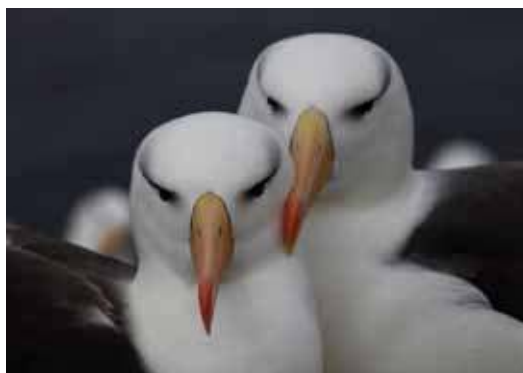
Black-browed albatross pair