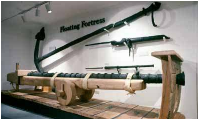
Part of the armaments found on the Molasses Reef Wreck

UKOTCF to help establish bird-watching tours throughout Grand Turk, especially along the many salt ponds, which also need protecting. These salt ponds are home to a unique variety of birds, and in situations in which water-birds regularly approach people much more closely than almost anywhere else in the world.