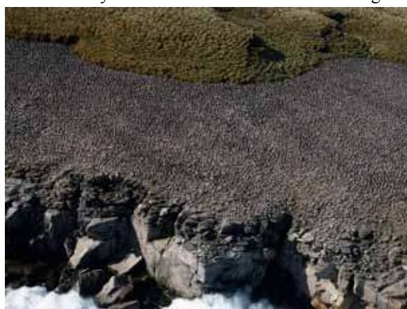
Black-browed albatross colony at Beauchene West taken during the aerial survey.

population in the Falkland Islands is presently doing well and is not in decline. Hopefully, this is a rewarding note to all those landowners and individuals who have supported this view from their own observations in the Islands over the years. It has also been especially gratifying that our independent surveys and the methodology used are being recognised and given support, not just by many individuals, but by organisations such as FIFCA (Falkland Island Fishing Companies Association). We can only hope that larger conservation lobbying organisations, who have a strong voice in the conservation world, will see the wisdom in presenting the reality of the Falkland population of black-browed albatross in a better light. Being included continually as part of the declining albatross population view does little to support the conservation efforts that are made in these Islands.