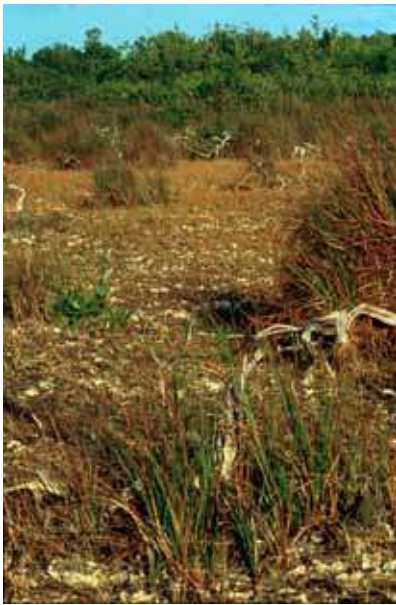
Salina Reserve.

with a protected area, the first being at the Booby Pond Nature Reserve on Little Cayman.