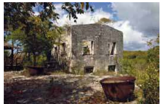
Wade's Green main house.

Two opinions have been given concerning the treatment of the trees growing inside the Great House. TCNT