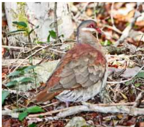
Key West quail-dove, one of the special birds at Wade's Green dry tropical forest, Turks & Caicos Islands.