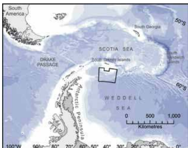
The South Orkney Islands Southern Shelf MPA hosts a rich biodiversity of benthic organisms, comparable to known sites such as the Galapagos.

The MPA covers a large area of the Southern Ocean, south of the South Orkney Islands. The MPA was the result of four years of development work. It is just less than 94,000 square kilometres,