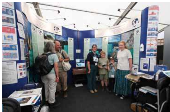
Young competition winners receive their prizes while other visitors look on.

This year we decided to do something a bit different to attract people to the UKOTCF stand. On each of the three days, we had a quiz which tested the great British public on their knowledge of the UK Overseas Territories. The winners received books, postcards and drink bottles as well as a year's free subscription as a Friend of the UK Overseas Territories. A flag from each Territory and Crown Dependency displayed on the stand aroused much interest from visitors. This did lead to the question: Where is the flag for Ascension? Have you forgotten it? (Selection of a flag