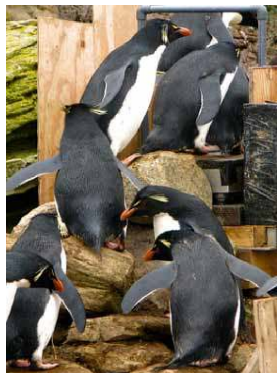
Rockhopper Penguins passing through the electronic weigh-bridge being used to gather some of the data for this project.

Diet composition of rockhopper penguins at New Island is determined mainly by stable isotope analysis. Using different tissues formed during the breeding season (egg membranes, chick down, blood samples), during moult (adult feathers) and during winter migration (toe nails and blood taken on arrival of the birds at the start of the breeding season). These allow us to identify differences in diet composition and areas used for foraging during the non-breeding season.