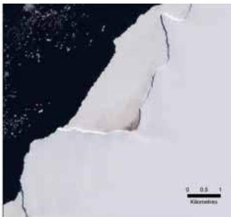
Figure 1: Landsat image showing guano stains from penguins on the ice.

The emperor penguin Aptenodytes fosteri is an iconic symbol of Antarctica. So it may come as some surprise to discover that our previous knowledge of the bird's breeding distribution and population was very poor; but you only have to look at the species breeding behaviour to see why. Emperor penguins are unique as they are the only bird to breed in winter on the vast expanses of sea ice around the coastline of Antarctica. In this environment, with its severe cold (down to -50°C) and wind (often of hurricane force) fieldwork is challenging and expensive.