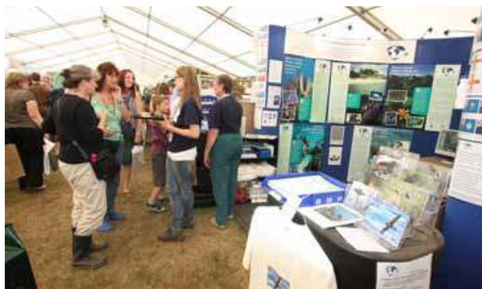
Caribbean rum punch and conversation at the stand

was interrupted a few years ago when UK Government cancelled local democracy, but has since resumed.) We also had a cocktail hour which only lasted about 30 minutes due to the success of the breezy beverage. Offering a chilled refreshment definitely helped to raise the profile of the UKOTs, as people couldn't resist the taste of the Caribbean while discussing the plight of the Cayman Island parrot or the Montserrat oriole! Remember: it is a bird-watchers' convention, after all. The final attendance over the three days was announced as 22,400. Both the Friday and Saturday were slightly quieter than last year but Sunday was the busiest ever. We had better be prepared and mix more cocktails for 2011: put 19-21 August in your diary.