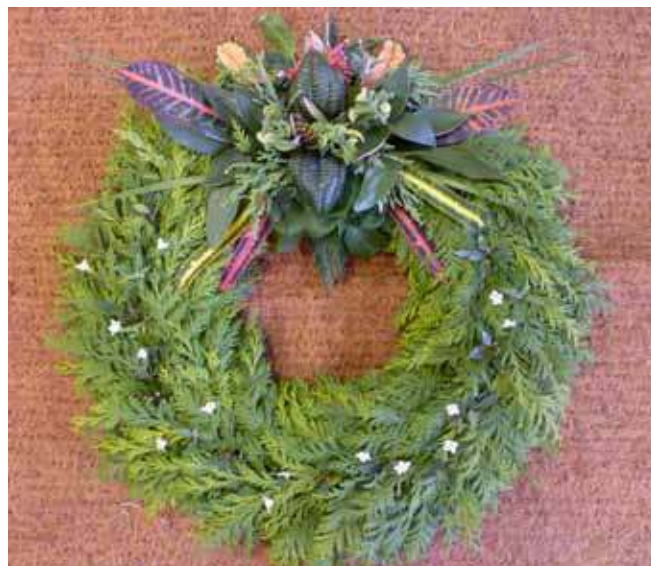
Remembrance wreath