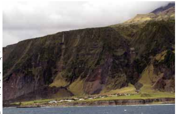
Right: Edinburgh of the Seven Seas, the settlement at Tristan da Cunha, with the 1962 volcanic cone to the left.