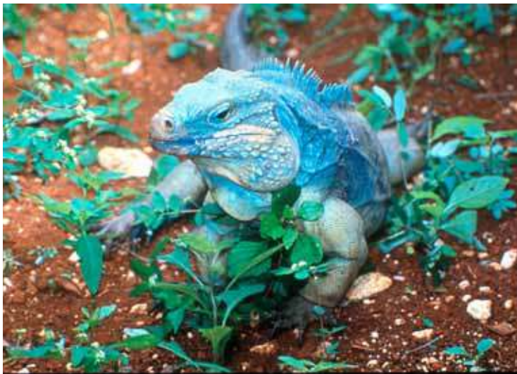
Grand Cayman blue iguana.

Like many other UKOTs, the British Virgin Islands (BVI), the Cayman Islands (CI) and the Turks & Caicos Islands (TCI) are particularly rich in biodiversity (of much greater global importance than that of the UK, despite their small extents). This biodiversity has served to underpin