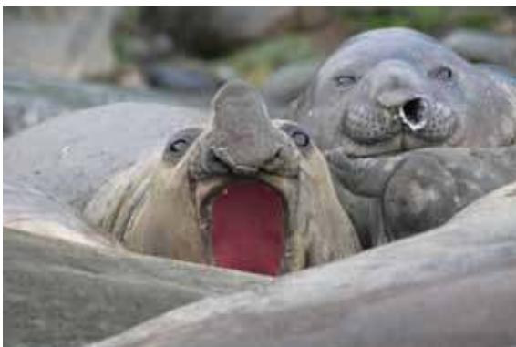
Left: Elephant seals rest on the beach at Grytviken, South Georgia.

If you are interested in visiting either the UK Overseas Territories of South Georgia, the British Antarctic Territory and the Falkland Islands – or participating in an Atlantic Odyssey expedition cruise to the British Antarctic Territory, South Georgia, Tristan da Cunha, St Helena and Ascension Island, please go to www.ukotcf.org/oceanWide/index.htm and complete the form (without commitment).