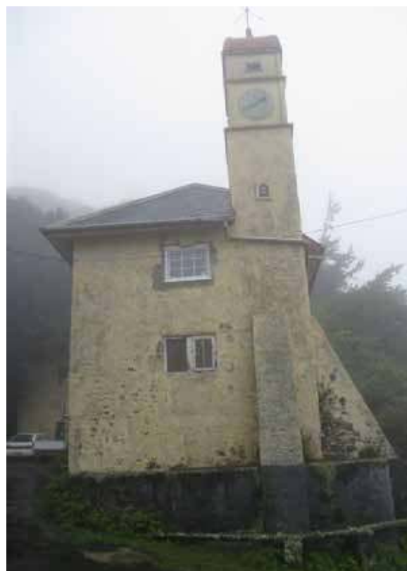
(Left) Green Point Visitors Centre before the restoration work and after (right)

environmental site of importance on Ascension Island and has an international reputation. The ground floor of the building has been converted into a display area to demonstrate the work carried out during the OTEP Endemic Plants Project and the EU South Atlantic Invasive Species Project. A section of the ground floor is being used as an exhibition centre and is open to the various organisations