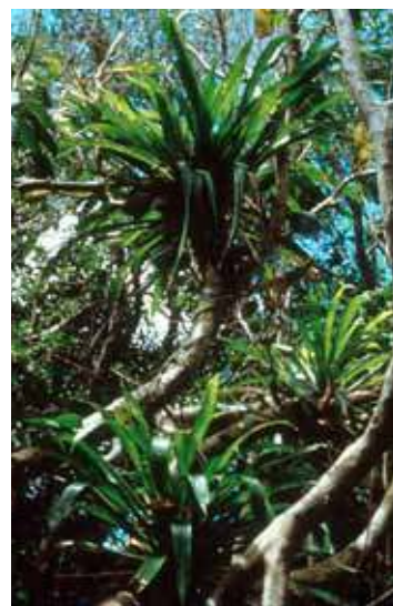
Forest at Sage Mountain National Park, Tortola.

As part of this project, NTCI and its partners will develop and commence implementing formal management plans for the Salina Reserve and the Mastic Reserve. Together with the Cayman Brac and Little Cayman protected areas, and the Cayman Islands' Marine Parks system (which is managed by the Cayman Islands Department of Environment), these will provide a Protected Area System context for a Management Plan for the new protected area (see below).