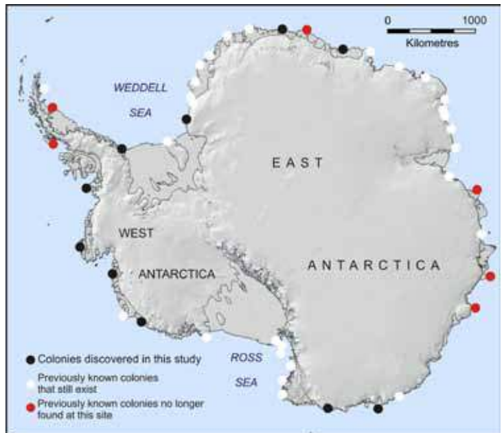
Figure 2: Distribution map for the penguin species

The first part of our study was to find all the emperor penguin colonies. We used medium resolution Landsat imagery that is freely available around the whole continent. This imagery has a resolution of 25m in the colour bands and on it penguin colonies show as brown guano stains on the ice. The sea-ice on which emperor penguins breed is just frozen sea water, so unlike glacial ice it has few impurities. The brown stains were unique indicators of emperor colonies (Fig. 1). We spent several months examining imagery from the whole coastline of Antarctica; the results were published in the journal Global Ecology and Biogeography in June 2009. In this paper, Penguins from space: Faecal stains reveal the location of emperor penguin colonies , a new distribution map for the species was presented, revealing the locations of ten new colonies (Fig. 2).