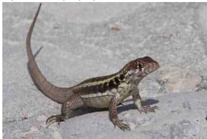
Curlytail Leiocephalus psammodromus, endemic to the Turks & Caicos Islands.