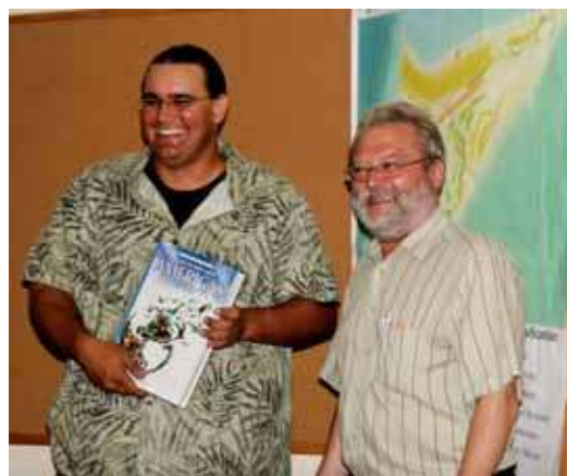
Senior Conservation Officer of the TCI National Trust, helped with much of the field-work.