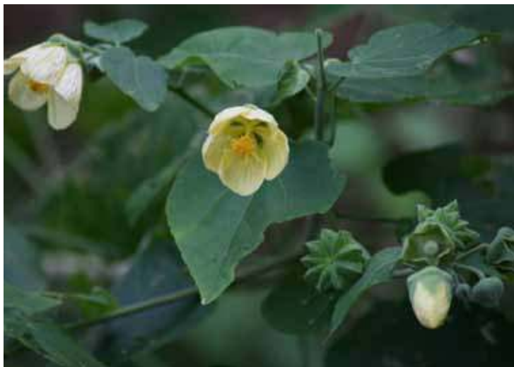
Abutilon pitcairnense flowering in cultivation at the National Botanic gardens of Ireland, Glasnevin.

The World's botanic gardens community come together every three years at the Global Botanic Gardens Congress organised by Botanic Gardens Conservation International (BGCI). BGCI is a membership organisation providing a Secretariat for the world's botanic gardens and those working to ensure plants are protected from the many threats facing them today. BGCI has 700 members in 118 countries ( www.bgci.org ). European institutions with active UKOTs programmes and collaborations, including RBG Kew and the host of the Congress, the National Botanic Gardens of Ireland, Glasnevin are BGCI members. Within the UK Territories,