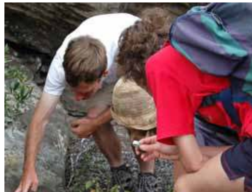
Surveying lichens during fieldwork

Control of invasive species presents an extraordinary problem for conservation managers. Appropriate action is often impeded by a lack of ready information with which to assess and deal with the discovery of novel species in the local environment. Implementation delays may be further compounded by a lack of public understanding. Shifting baselines and a lack of awareness amongst members of the public can result in well-intentioned efforts