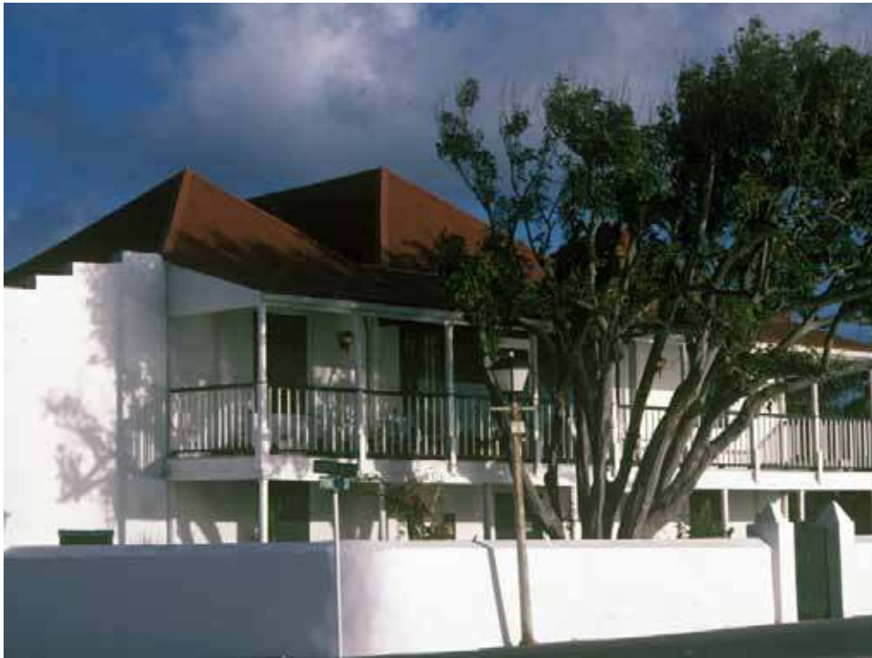
The Turks and Caicos National Museum housed in the Guinep House, named for the large Guinep Tree

One of the premier exhibits in the Museum concerns the Molasses Reef Wreck. About 1513, on a reef located on the southern fringe of the Caicos Bank some 20 miles south of the island of Providenciales, a ship sank. This ship, known only as the Molasses Reef Wreck, is the oldest European shipwreck excavated in the Western Hemisphere. The Museum's first floor is dedicated to what archaeologists, scientists, and historians have discovered about this wreck.