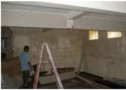
Work begins on the interior of Green Point Centre.

a workshop and storage area. The first floor has been converted into a lecture theatre and a class room facility.