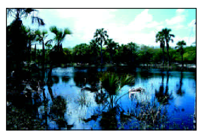
View from one of the field-roads under development of one of the seasonal fresh-water ponds which burst into life when the water-table in the limestone rock reaches the surface.

The Forum has been working closely for several years with its member organisation, the Turks and Caicos National Trust, on a major programme to develop effective conservation management and sustainable use to the benefit of the local communities of Middle and North Caicos. This area includes the East, Middle and North Caicos "Ramsar" Convention Wetland of International Importance, which is the fourth largest of some 160 designated by UK and its Territories. Its natural ecosystem transitions and mosaics are some of its outstanding features. These, and their ease of viewing through facilities being developed by this programme, were described by a recently visiting Ramsar official as "even better than Costa Rica" – something of a gold standard in eco-tourism!