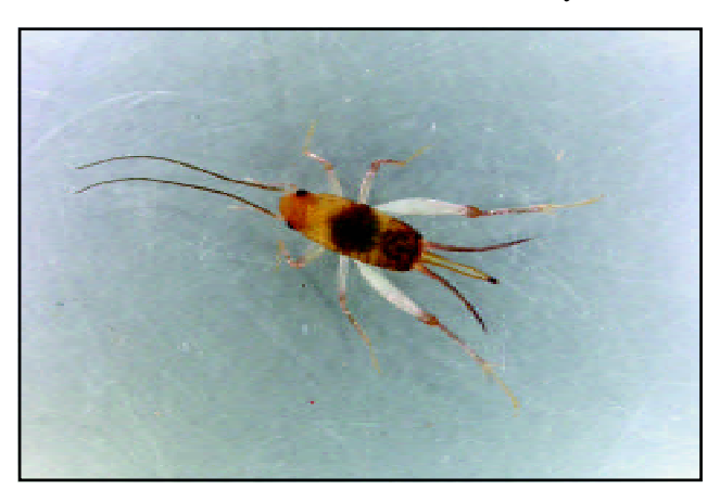
A mogoplistine cricket recently discovered by Philip and Myrtle Ashmole and not yet described

Most of the endemic invertebrates of St Helena have been found in the humid high part of the island where there are remnants of the endemic vegetation. However, on Prosperous Bay Plain, in the arid area in the east of the island, some 55 endemic species have been found. More than 20 of these have been found only here and nowhere else on the island, and