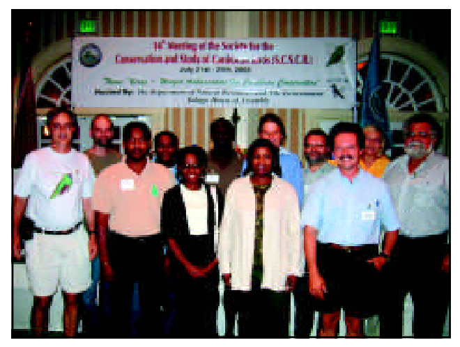
Participants of the SCSCB in Tobago

Forum member organisation, the Royal Society for the Protection of Birds, part-funded 10 participants, representing each of the Wider Caribbean UKOTs, to attend the 14<sup>th</sup> meeting of the Society for the Conservation and Study of Caribbean Birds (SCSCB) in Tobago from the 21<sup>st</sup>- 25<sup>th</sup> of July 2003. With a packed agenda, covering 3