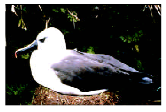
Yellow-nosed albatross Diomeda c. chlororhynchos

The south-west side of the Island is still rat-free.