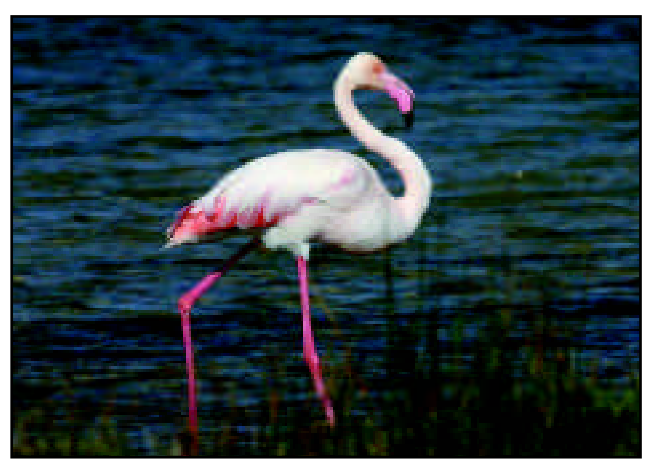
Greater Flamingo at Akrotiri Salt Lake - one of more than 20,000 which winter on the Lake.

The SBAA is working with the Cyprus Government in the preparation and implementation of a Management Plan. They are involving all those people concerned,