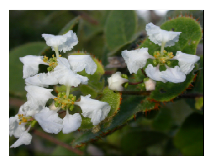
Malpighia woodburyana, an endemic of the Puerto Rican Bank referred to as "bulldog" on Anegada, this endagered plant were found flowering for the first time during fieldwork as part of the Darwin Initiative Assessment in 2003.

Two projects based in BVI have attracted funding under OTEP, one for a mangrove wetland interpretive centre, and another for the assessment and improved management of new and existing Marine Protected Areas.