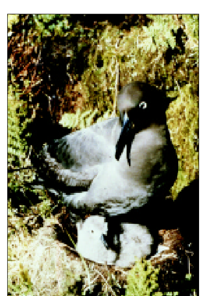
Sooty Albatross, Phoebetria fusca, nesting in the Tristan group

protection for the globally threatened Tristan Albatross and Atlantic petrel, the Black-browed Albatrosses Falkland waters, and the Wandering Albatrosses South Georgia. The Group was delighted to hear on 2 April 2004 that this ratification, including Falkland Islands. South Georgia and the South Sandwich Islands, and the British Antarctic Territory. had been effected.