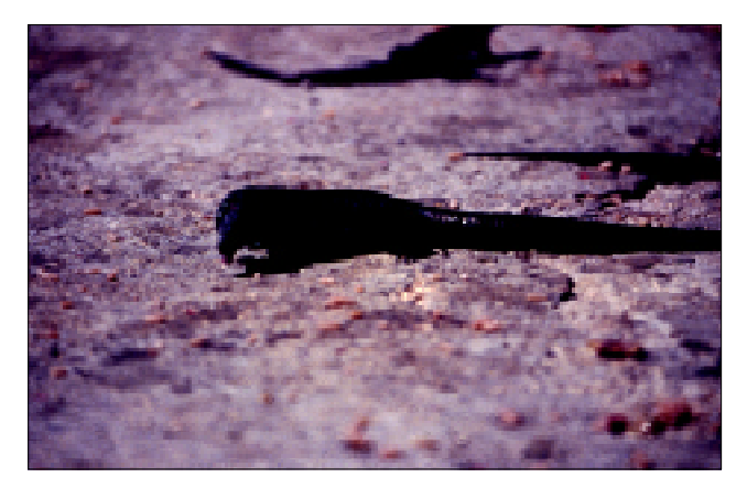
Sombrero Lizard Ameeiva corvinet

Amongst the projects that were recently successful in attracting funding under OTEP was one to provide technical assistance for drafting environmental and conservation legislation that will enable appropriate Multilateral Environmental Agreements to be extended to Anguilla.