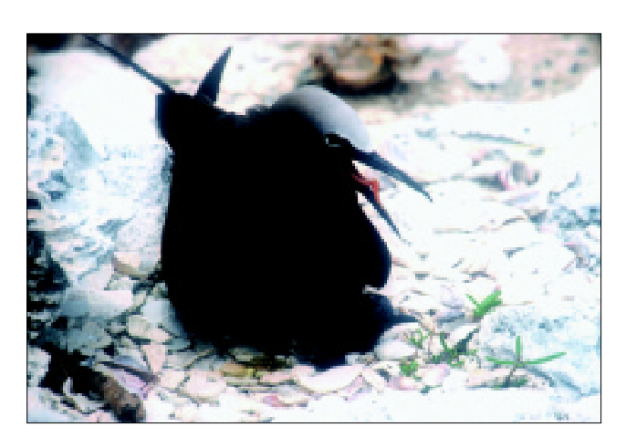
A Brown Noddy shelters its chick from the intense sun; the small cays of TCI are some of the most important colonies in the Carribbean for several tern species

The Territories have also been beset with natural problems. On 12<sup>th</sup> and 13<sup>th</sup> July 2003 the dome of the Montserrat volcano collapsed, spewing several centimetres of ash all over the island. On 5 September 2003 Hurricane Fabian hit Bermuda. Work to assess and repair damage to both these events is continuing.