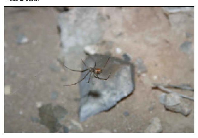
Large numbers of night-emerging Brown Widow Spiders are part of the extremely rich invertebrate biodiversity of Prosperous Bay Plain, St Helena, which will need careful protection if the plans for an airport proceed

invited by the Darwin Committee, was turned down. This was the second time that the Darwin Fund had specifically invited an application for this widely acclaimed work, the resulting application being unsuccessful in both cases. Similarly, as this report was completed, Falklands Conservation heard that its bid for invertebrate studies to Defra's Darwin Initiative had been unsuccessful, for reasons that are factually incorrect. Thus, this is another round with no successful UKOT projects. These are not isolated examples re UKOTs, and it has been noted that colleagues in UKOTs have a low opinion of the Darwin Initiative, partly because of its apparent disregard of the value of the limited time available to UKOT personnel; in some cases these UKOT personnel have indicated that they are disinclined to make further applications to the Darwin Initiative. These matters and the generally low support for UK's globally most important biodiversity, i.e. that in the UKOTs, are being explored with Defra.