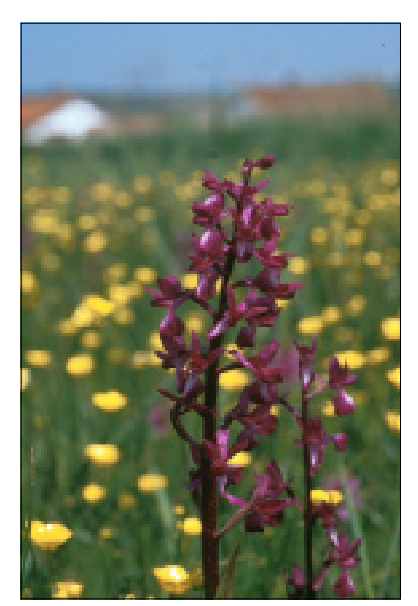
Loose flowered or Jersey orchid once widespead, now confined to two sites in Jersey.

had ever attended" according to one senior FCO official), delegates indicated overwhelming wish another for conference in the future. Although many wanted a shorter time-period, a three-year time interval thought be to appropriate, so that could work progress in the mean time but that the gap was not too long that the momentum was lost. A venue in or