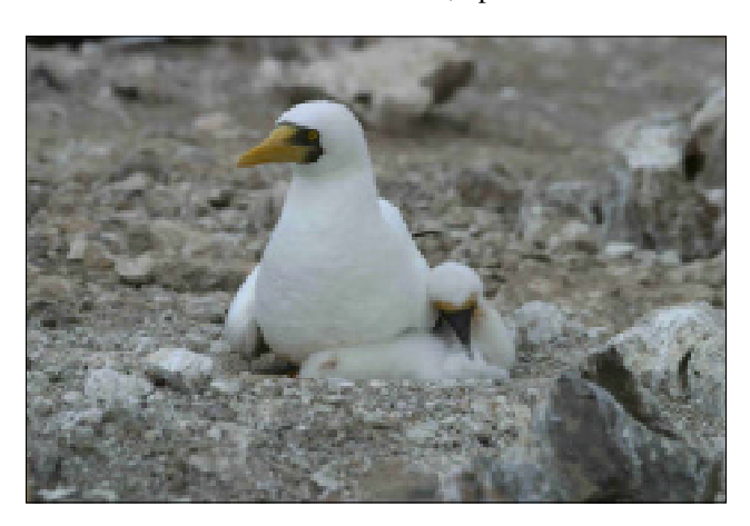
Masked Booby and chick in the newly established Ascension mainland colony, following removal of feral cats

Proposals were assessed by a nine-person selection panel comprising: officials from FCO, DFID, Defra and the Joint Nature Conservation Committee; specialists from UK