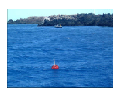
Illegal fishing close inshore to Ascension

Worryingly, illegal fishing activities seem to be on the increase, and were a serious issue for St Helena, Tristan da Cunha, and particularly off Ascension Island. One vessel here laid hooked lines to within a mile offshore. These proved a danger to turtles as well as seabirds. Strenuous efforts on Ascension were made to remove the lines, reduce the impact and record the event. However, attempts to follow this up in the UK in order to identify the vessel involved and deter future incidents of this type have met with no success to date. The Group awaits information on the extent of the