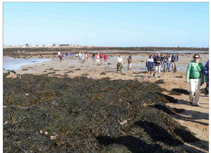
Delegates from the conference in Jersey walk across the seabed revealed by the low tide on Jersey's first Ramsar site.

Topics for the conference included environment charters and strategic planning with an overview of progress, examples from several territories on their approaches, and contributions from HMG departments and agencies on how they can help. The conference featured many OTEP-supported projects, demonstrating the importance and success of this small-projects