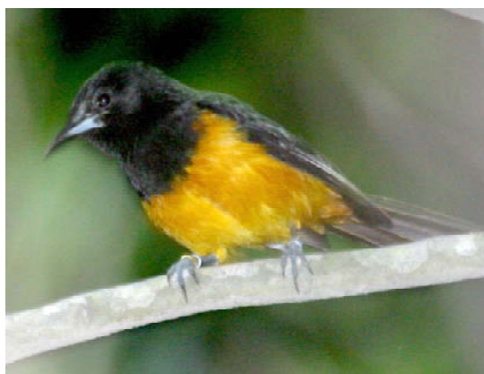
Montserrat oriole Icterus oberi inhabits a small area on the island and has been classified by IUCN as critically endangered.