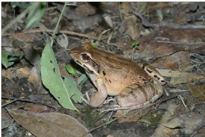
Mountain Chicken, the large frog endemic to Montserrat and Dominica