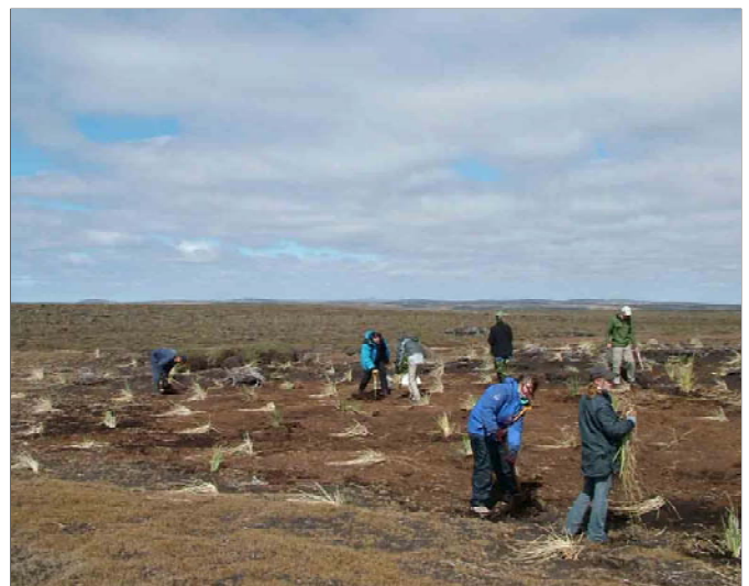
6 th Form students planting Tussac Grass in the Falklands as part of the OTEP-funded Environmental Education project, Community Environmental Awareness and Citizen Programme, a multi-territory programme involving the Falkland Islands and Ascension Island.

Falklands Conservation has continued penguin monitoring. The count of king penguin chicks at Volunteer Point in November 2006 totalled 533, the highest ever recorded at this venue since the programme began. Gentoo and Magellanic penguins also had good