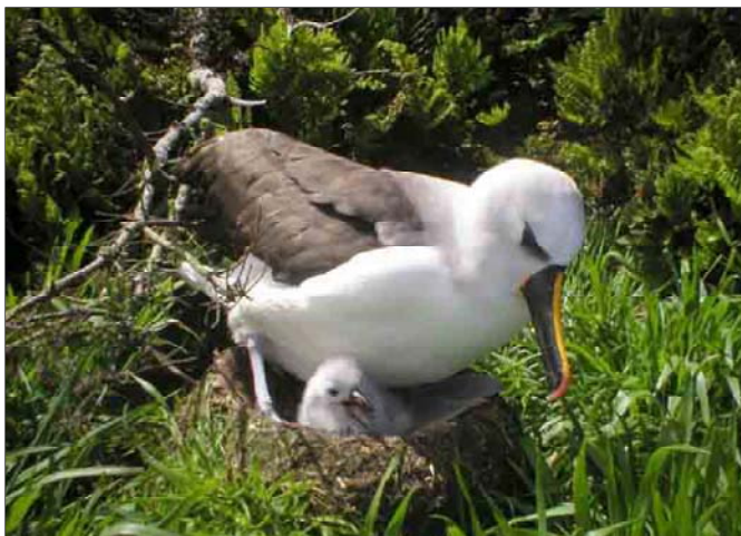
Yellow-nosed albatross Thalassarche chlororhynchos and chick on Tristan da Cunha

UKOTCF was very pleased when the International Agreement on Conservation of Albatross and Petrels (ACAP) was officially extended to Tristan da Cunha on 13th April 2006. The Biodiversity