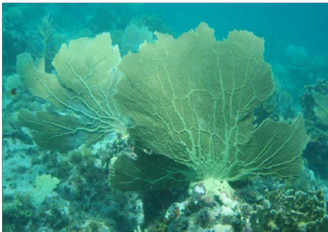
Corals in Shoal Bay Anguilla

In an effort to improve the Marine Park system through better management and information, the Anguilla National Trust and the Department of Fisheries and Marine Resources have collaboratively developed a project that will assess the status of the ecological integrity of the marine Parks and other key near shore sites.