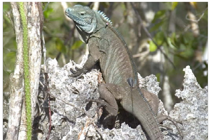
The Blue Iguana Recovery Programme has succeeded in stemming the catastrophic decline of the Grand Cayman blue iguana.

This year saw the welcome reopening of the Governor Michael Gore Bird Sanctuary, renovated by the National Trust following extensive damage to the site by Hurricane Ivan. The wider Darwin Initiative project In Ivan's Wake... has made good progress, including environmental education activities and use of satellite images of marine and terrestrial environments in the development of a comprehensive habitat classification and mapping system. This will underpin the development of a National Conservation Action Plan, the requirement for which is likely to be amongst the