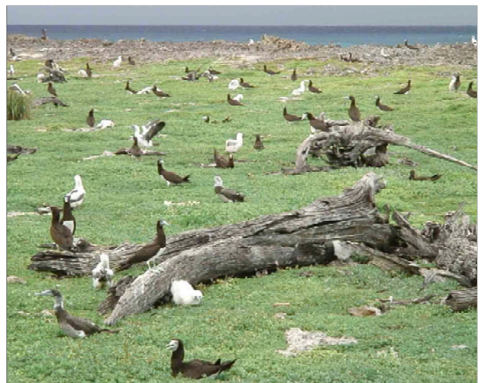
Brown Boobies have a thriving colony in the Three Brothers islands.

For the longer-term future for nature conservation in BIOT, a priority is implementation of our proposals for extensive new Ramsar sites. The Working Group was encouraged by the support for this on 30 April 2007 from Mr Barry Gardiner, Defra Minister. We have also welcomed other indications, for example from JNCC and DCMS, of more 'joined-up' Government in support of BIOT conservation, a cause for which UKOTCF valuably campaigns.