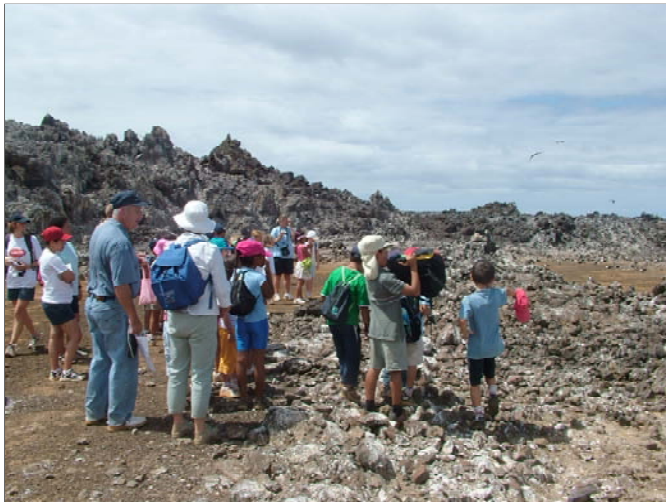
Visiting Sooty Terns on Ascension as part of the OTEP-funded Community Environmental Awareness and Citizen programme.

It is encouraging to note that seabird populations have shown increases after the very successful restoration project on Ascension. The last known feral cat was found in February 2004. All pet cats on Ascension are now neutered and micro-chipped. Even a small number of semi-feral cats in evidence during the Army Ornithological Service bird survey proved to be on the cat database, which is getting smaller each year.