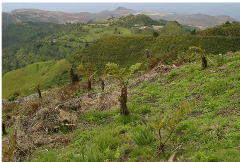
Clearance of invasive flax (remaining stand in middle ground) and related management are allowing tree ferns (foreground) and other native species to recover in St Helena. Access to UK Lottery funding would allow a much greater potential for these sort of proven conservation techniques, as well as protection of other natural and cultural heritage in the UKOTs.

UKOTCF has used several opportunities to attend meetings in a European Union (EU) context to highlight the UKOTs. These included a meeting of the European Parliament Intergroup on Climate Change, Biodiversity and Sustainable Development "Island and Overseas Entities contribution to biodiversity conservation and the fight against climate change" which took place in December in Brussels. There were some interesting presentations, especially from the Commission on EU funds available and used by especially French territories inside the EU, but also regarding BEST (see elsewhere), with the representative