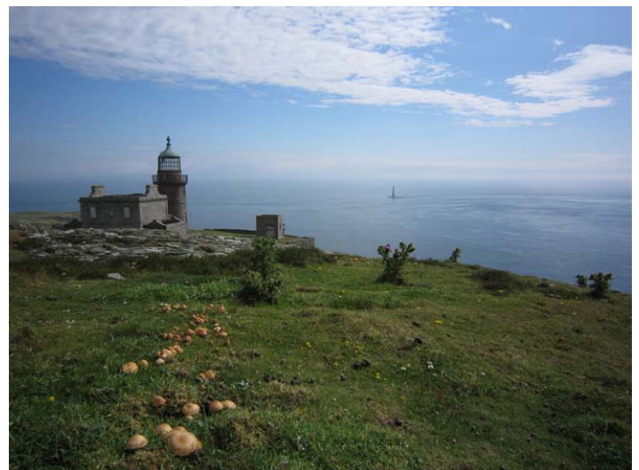
The Calf of Man, the nature reserve islet off the south of the Isle of Man, looking south to the Chicken Rock lighthouse.

In September 2011, the marine nature reserve was designated