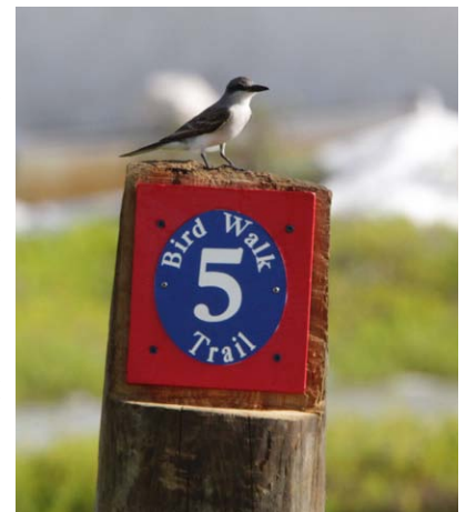
Gray kingbird (as well as human residents and visitors) finds some benefit in the work of Turks & Caicos National Museum and UKOTCF in establishing the bird trails at Grand Turk.