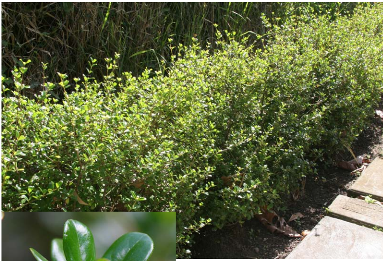
The Pribby (inset) is restricted to Montserrat and is critically endangered because of loss of habitat and feral livestock. Montserrat National Trust's Botanic Gardens has grown a good stock, including this hedge. Development of the Botanic Gardens and other conservation projects here and elsewhere were partly supported by OTEP. UK Government has now discontinued grants from this

programme being available to NGOs, thereby losing a very cost-effective set of potential conservation projects.