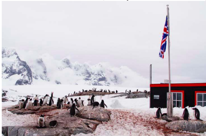
Antarctic Peninsula: Gentoo penguins display and nest in colonies around the historic Port Lockroy Station, now managed by UKOTCF new Associate, UK Antarctic Heritage Trust.

The Royal Botanic Gardens, Kew (RBGK) project with Falklands Conservation and local business, Stanley Growers and Nurseries,