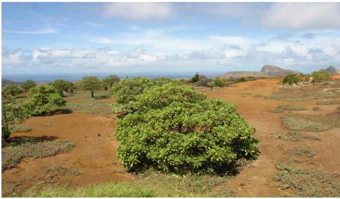
St Helena's ground-breaking Millennium Forest is re-establishing the previously threatened gumwood tree, one of the many species found only on St Helena.