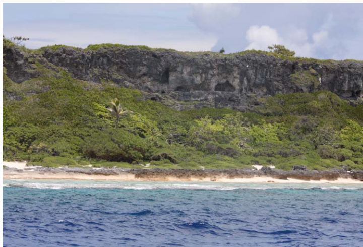
The north shore (and usual landing area) of Henderson Island. UKOTCF welcomed the grant to Pitcairn Council and RSPB for the rat-eradication exercise. Strangely, when announcing this at the Conference of the Parties to the Convention on Biological Diversity at Nagoya, the UK Secretary of State for the Environment did not mention that this uniquely important World Heritage Site is a UK Overseas Territory.

“We will also continue to give priority to the UK Overseas Territories (OTs) Biodiversity Strategy, through a co-ordinated