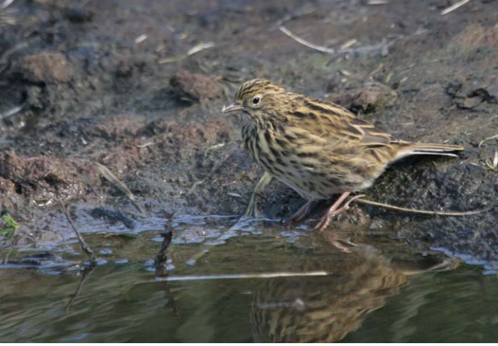
Endemic South Georgia pipit.

In September, the annual stakeholder meeting was held in London (see main report).