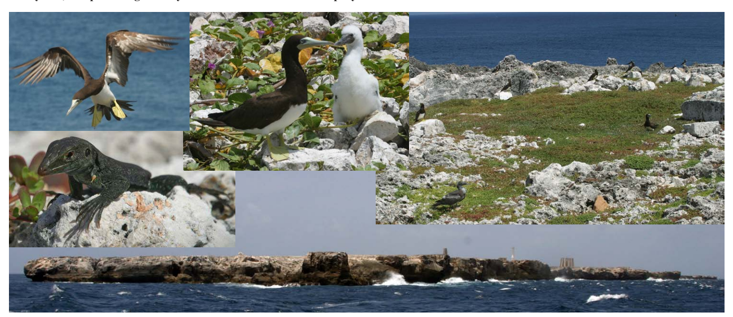
For many years, UKOTCF has facilitated and encouraged the designation and sustainable management of Wetlands of International Importance under the Ramsar Convention. It has also been long involved in efforts to conserve the important island of Sombero, which is half-way between Anguilla (to which it belongs) and the British Virgin Islands. Sombrero sits on its own bank and has been separated from other islands for a long period of geological time. Consequently, it is important for endemic species such as the Sombrero black lizard (illustrated) as well as several species of breeding seabird (including brown boobies, illustrated). The site was included in UKOTCF's review, for UK and UKOT Governments, of actual and potential Ramsar Sites (www.ukotcf.org/pubs/ramsarReview.htm). The Government of Anguilla has recently decided to ask UK Government to designate this under the Ramsar Convention.

Key roles of the Forum have always included building capacity in UKOTs and CDs, facilitating the exchange of expertise between territories, and identifying common interests and needs, as well as trying to do something about these. Territories have long stressed the high value of the occasional conference for practising conservationists, and called for UKOTCF to organise another. Unfortunately, the UK Government has not felt able to support one since 2009. In summer 2014, UKOTCF was able to announce that it had secured funds, mainly from HM Government of Gibraltar, for