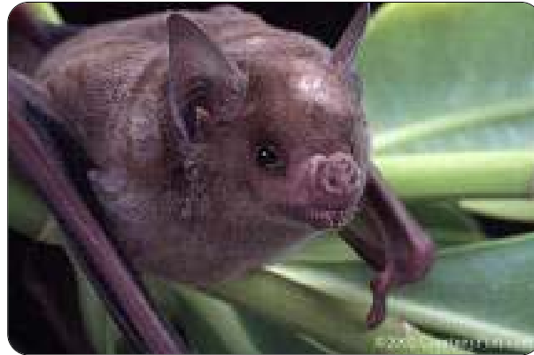
Antillean Fruit and Nectar Bat Brachyphylla nana, an obligate cave dweller, pollinates numerous Caribbean plants and also disperses seeds throughout native forests

The Cayman Islands are very isolated and not part of the Eastern island chain. Migrating birds have been finding Wild Figs Ficus aurea and other wild fruits here to sustain them for millennia. The loss of this forest would be a severe blow to them, as well as to indigenous birds.