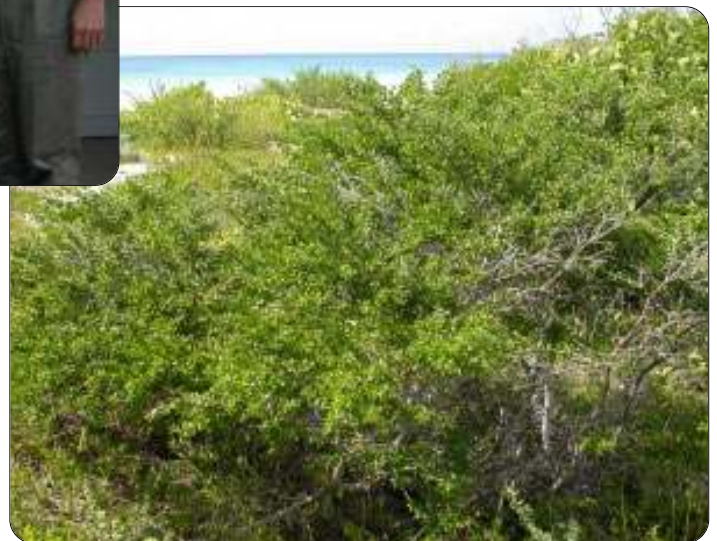
Acacia anegadensis growing in the sand dunes at the western end of Anegada

Three further endemics listed as Critically Endangered were Acacia anagadensis (Fabaceae) a small tree found only on Anegada, Calyptanthes kiaerskovii (Myrtaceae), a small tree limited to Virgin Gorda, and the scrambling cactus Leptocereus quadricostatus (Cactaceae), found on Anegada and Puerto Rico. Two Puerto Rican Bank endemic trees were listed as Endangered: Calyptanthes thomasiiana (Myrtaceae) and Zanthoxylum thomasiianum (Rutaceae), both of which are on the US Federal Endangered List.