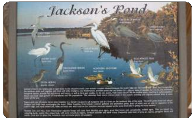
Interpretative sign for Jackson Pond. The image on the sign is built up with 12-15 ceramic layers each fired to 1500°C and then sealed with clear glass.

Each Island has a small museum and an interpretative centre. Cultural and historic sites include houses, boat yards, accessible caves (many still used as hurricane shelters), the mass grave from the catastrophic 1932 hurricane, and, on Little Cayman, remains of the 1880s phosphate industry (mule pen, railway) and 17 th century site of the first settlement in the Cayman Islands. All have interpretative signage; other sites describe the life history of birds (boobies, frigatebird, parrot), faunal biodiversity and forest and wetland ecology.