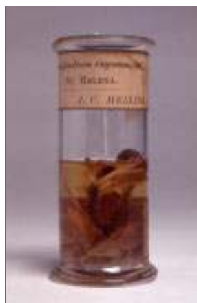
Spirit collection of leaves and flowers of Commidendrum rugosum (Economic Botany Collection (EBC) no. 51476) from St Helena

Topographical Description of the Island , published in 1875) in the second half of the nineteenth century, and were in the British Museum until 1983. Among them are small pieces of wood from species such as the extinct green ebony Trochetiopsis melanoxylo n and the tree of bastard gumwood Commidendrum rotundifolium which was blown down at Longwood in 1897. There is also a small piece of wood collected in 1997 from the last wild specimen of St Helena's olive Nesiota elliptica .