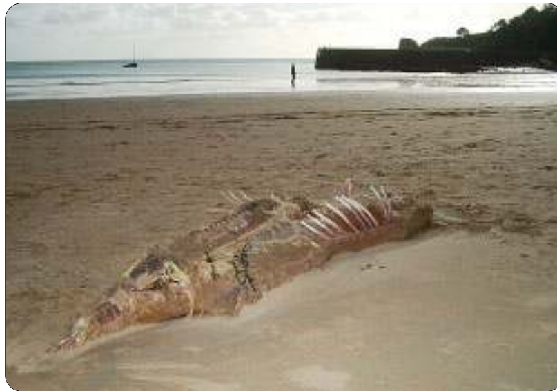
Unidentified Cetacean St Brelade Jersey

A ban on pair trawling in the English Channel can only be imposed at European level and