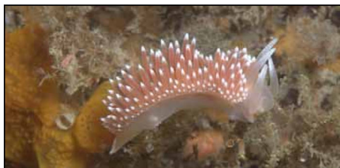
Sea slug or nudibranch Flabellina sp at Stromness