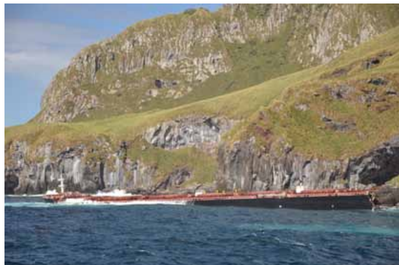
MS Oliva shortly after running aground on Nightingale Island

Around 3,700 Northern rockhopper penguins were brought to