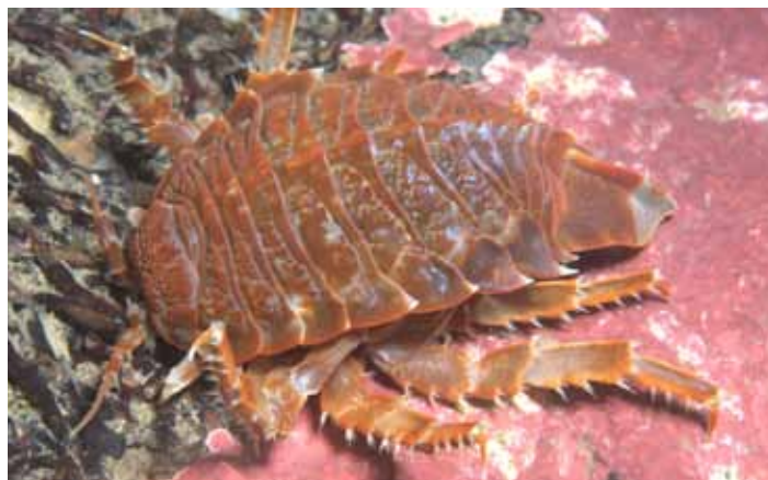
Giant isopod Glyptonotus antarcticus at Husvik

The data suggests that the ecological implications of environmental change to the marine ecosystem here could be severe. If sea temperatures continue to rise, the team suggests that changes will include depth profile shifts of some fauna towards cooler Antarctic Winter Water (90–150 m), the loss of some range-edge species from regional waters, and the extinction of some of South Georgia's endemic species that are only just being recorded.