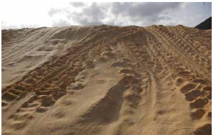
Turtle tracks found on Ascension.

Previous work by the University of Exeter has shown that Ascension Island is of global importance for marine turtles, and that these species are vulnerable to global climate change. This project will produce an updated status and management plan for