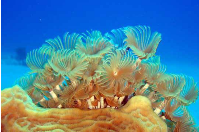
Tube worms are filter-feeders living in colonies of up to twelve – pictured at Boat Cove.

The Turks and Caicos Reef Fund (TCRF, www.tcreef.org ) was established in 2010 to help preserve and protect the marine environment of the “Beautiful by Nature” Turks and Caicos Islands - an environment that draws so many visitors to the islands and is critical to the survival of the islands themselves. TCRF is raising money, primarily through voluntary donations from island visitors, for marine environment-focused research, education and preservation projects.