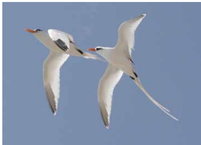
Pair of white-tailed tropicbirds display over Big Sand Cay during the seabird count.