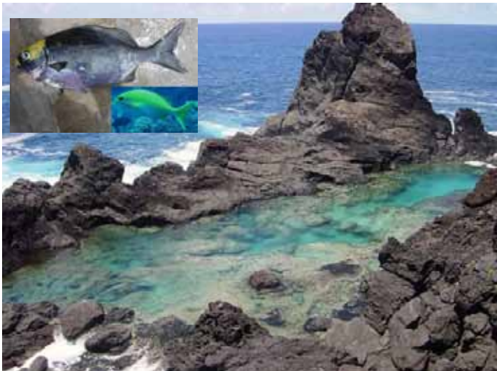
St Paul's Pool is a popular location for swimming and snorkelling by the local community and could be utilised as a SCUBA training pool. Inset: drummer fish with yellow variation.

The principle aims of this project are to: engage and collaborate with local and international stakeholders to consolidate earlier marine survey data, fisheries and environmental reports and local community knowledge to produce a baseline report publication; establish an equipment pool on Pitcairn Island for diving and fishing monitoring and other activities; undertake preliminary marine surveys at selected sites to evaluate basic ecological status of the corals, fish and invertebrates; and, in collaboration with the Pitcairn Island Council, develop a Darwin Initiative main project application to establish a future conservation and management plan for the fisheries and marine and coastal biodiversity of the Pitcairn Islands for submission in 2011.