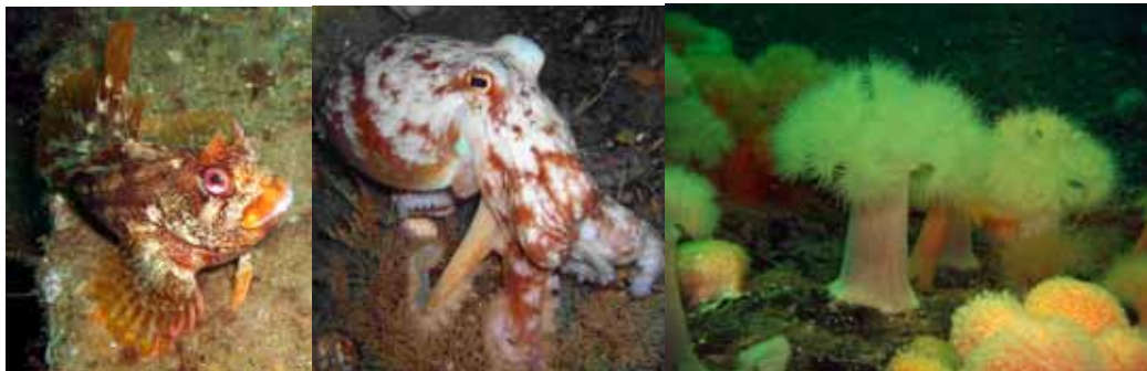
Illustrations of a little of the biodiversity of the Isle of Man. Clockwise from top: choughs ; cliff seabird colony ; bee orchid at Airport ; wood vetch ; maerl bed with sea anemones in Ramsey Bay ; white plume anemones on long stalks, octopus, tompot blenny.