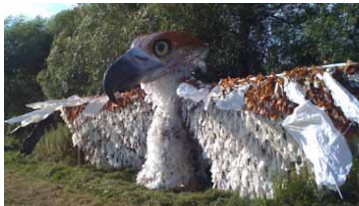
The osprey with its 40 ft wingspan was star attraction at the Bird Fair.

The quizzes and Caribbean Rum punch "Happy Hour" (both now becoming something of a UKOTCF tradition at the Bird Fair) were very successful. So, look out for us next year at the British Birdwatching Fair (17-19 August 2012).