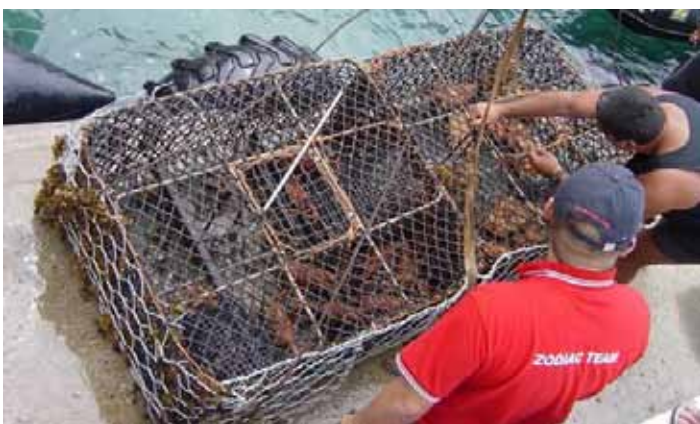
Lobster fishermen on Pitcairn.

During the stay, the visit of the cruise ship Hanseatic provided an opportunity for the Pitcairners to sell or trade their marine resources, mainly in the form of fresh fish, or live lobsters. This was an opportunity to evaluate the lobster fishing activity, which