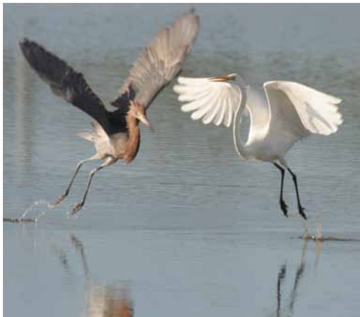
Reddish and great egrets hunting for fish on one of the salinas still needing protection, in the town of Grand Turk.

Since 2004, UKOTCF has been developing bird-watching trails on Grand Turk, focused on the salinas. A particular feature of the birds on the Grand Turk salinas is that waterbirds that are usually shy elsewhere allow close approach here – offering outstanding bird watching opportunities, even for novice bird watchers. This feature offers opportunities for the development of local ecotourism businesses for the large number of tourists, as well as a way of raising local awareness of the importance of the salinas. However, despite repeated promises from TCI