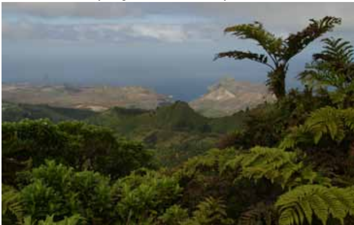
Aspects of the tremendous biodiversity of St Helena. Foreground: the cloud forest of the Peaks; the background, only 5 km away, the desert of Prosperous Bay Plain with many endemic invertebrates.