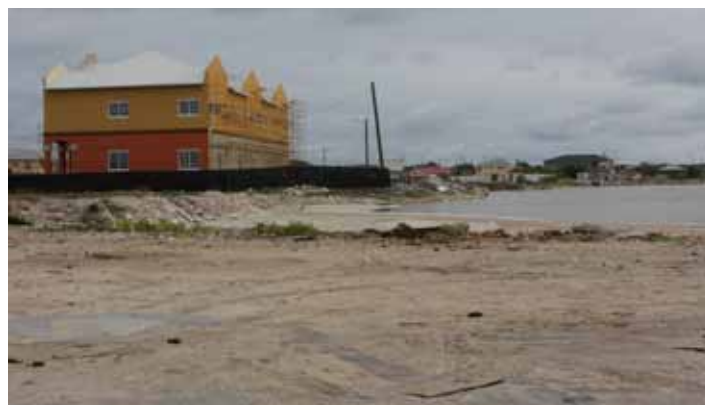
The now protected Town Salina was, until recently, still subject to piecemeal destruction by infilling for building construction; other salinas remain under threat.

Another initiative during this period was the collaboration between UKOTCF and the Turks and Caicos Education Department on the development of environmental education materials. At the suggestion of the Director of Education, the theme of Wonderful Water was decided upon. A successful application to OTEP provided part-funding for this project, which is running until 2012. The objective is to help school students understand the crucial importance of water resources in TCI, which has low annual rainfall. The project is developing a curriculum-linked teaching programme on water resources in TCI for the upper primary and the first years of high school. As well as highlighting the important wetland ecosystems in TCI, it addresses the increasing needs for scarce water resources, and how these needs can be met. The teaching materials will also include the hydrological systems which enable fresh water to be accessed through artesian wells,