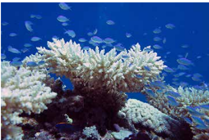
Chagos coral bleaching, April 2016.

UKOTs are unlikely to be able to make any dent in the reducing in CO 2 emissions needed to stop global sea-temperature rise. Dr Turner acknowledges that all is not lost and there are things that can be done at a local level, which can build resilience: for example, reducing the impact of, and/or management of, other human activities.