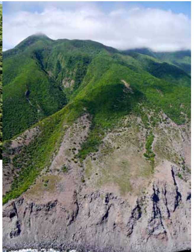
Helicopter views of the south: (above) the rich forest area at Roche's; (right) area further south showing high erosion and desertification related to feral animal grazing.

tourism in the form of tours and trails in the forest that can also encompass built heritage. Obviously, this would need integration, not just with the safety requirements but also with the conservation plans. While there are a number of logistical constraints associated with this idea, such as health and safety permissions from MVO, DCMA and the Police, with the correct procedures in place and sufficient resourcing and management then this could be a viable and profitable option that promotes Montserrat's environment.