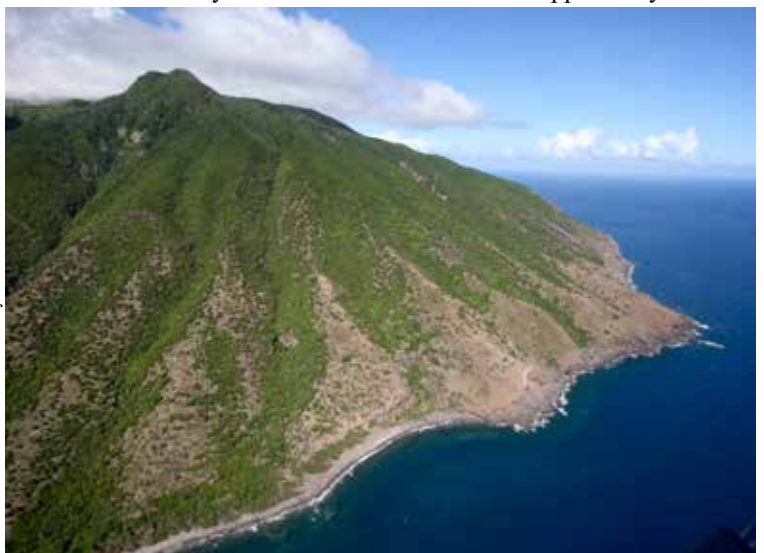
Aerial view of Montserrat from the south.