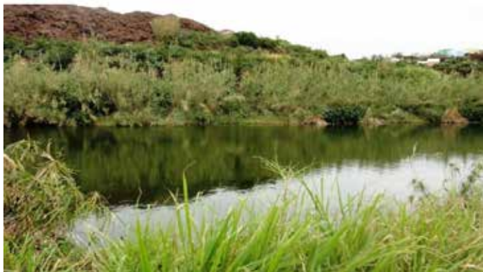
Pembroke Marsh Ramsar Site is home to a pea clam and freshwater limpet only found in Bermuda.

The importance of having a suite of protected sites was underlined in a most painful way in late March, when a fire destroyed all the vegetation in the east basin at one of Bermuda's proposed Wetlands of International Importance, Devonshire Marsh.