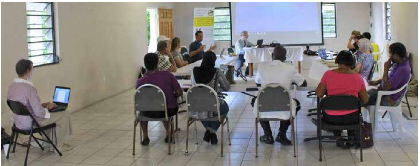
The workshop in session.