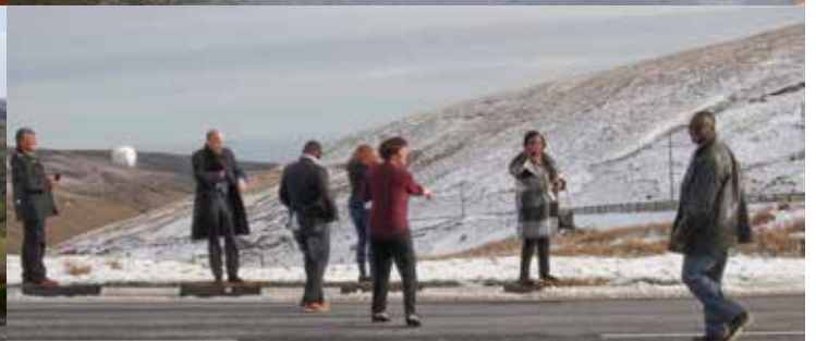
The final half-day site-visits included: (top left) Tynwald - the oldest continuous Parliament in the world, (top right) the view northward from the hills, over Ramsay and its Bay to the dune system at the Ayres; and Peel (middle right). The visit coincided with the coldest week of the winter, with snow on the hills. Some Caribbean Ministers rose to the challenge by engaging in a brief snow-ball contest.