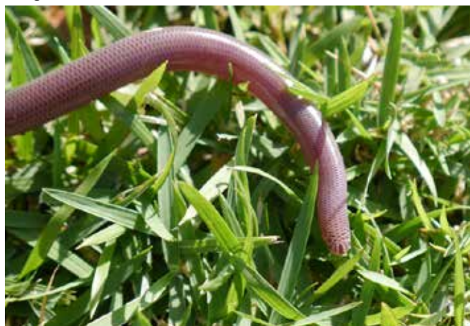
Above: endemic coffin borer blind-snake Antillotyphlops monastus (this individual about 28 cm long); below: head of alien, potentially invasive blind-snake, probably Indotyphlops braminus (with millimetre scale).

Here, we report first a new invader and another potential one, and then a possible approach to addressing one already here but now posing a serious threat.