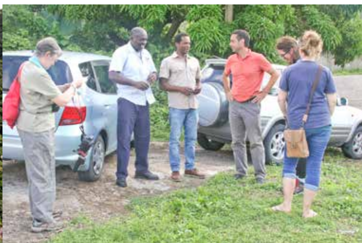
The sports field at Cork Hill, cleared of invasive blackberry by the Cork Hill Reunion Committee (aerial view left), discussed (right) by the Cork Hill and Adopt a Home for Wildlife project teams on the ground.