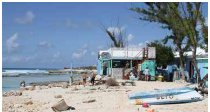
The cafe and dive centre at Salt Cay. The left part of the building (previously supported by the free-standing blue pillars) was washed away by wave action in March 2018. This was because the short segment of the breakwater, which had linked the long section parallel to the shore to the shore and which had been destroyed by the September hurricanes, had not been repaired even by 6 months later. The line of the missing segment can be seen by the small section showing above water on the left of the image. Part of the harbour, which is rapidly becoming unuseable as another result of the loss of the break-water segment, is in front of that wall fragment.

In the limited time available, UKOTCF was not able to visit South Caicos, the easternmost of the Caicos Islands, which had suffered damage comparable to Salt Cay. We are pleased, however, that our colleagues in the Turks & Caicos Reef Fund have managed to secure modest funding to help facilitate some of the residents there to build up small businesses based on low-intensity sustainable tourism on the nature paradise of nearby East Caicos. (This had been part of a project proposed by TCRF and UKOTCF some