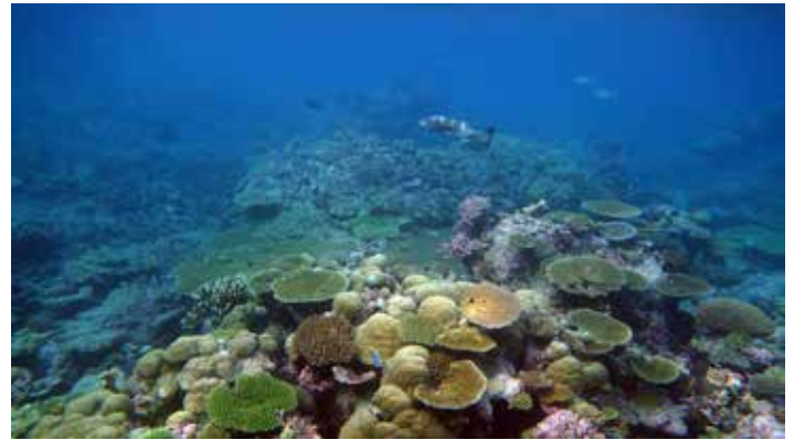
Coral garden.

Management of marine resources in order to maintain normal functions of a reef ecosystem is vital for their survival. One such management option is marine reserves whereby fishing of reef-grazing fish, such as parrotfish, is prohibited. Allowing them to perform their important function of controlling algal growth on the reef can reduce the rate of reef-decline.