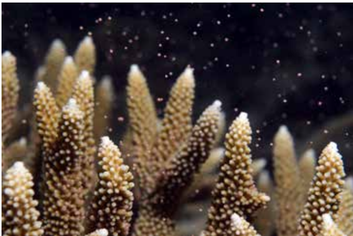
Above: Staghorn coral spawning. Below

Partnerships between governments and their agencies, non-government organisations with largely volunteer efforts, and even tourist companies are vital components in successful coral-reef