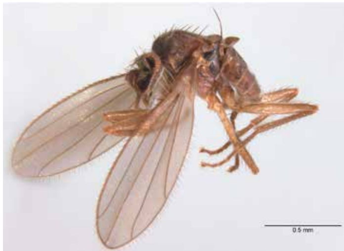
Female specimen of Chimerothalassius runyoni . Reproduced under Creative Commons Attribution License http://creativecommons.org/licenses/by/3.0 from Brooks, S.E. & Cumming, J.M. (2018) New species of Chimerothalassius Shamshev & Grootaert (Diptera: Dolichopodidae: Parathalassiinae) from the West Indies and Costa Rica. Zootaxa 4387 (3): 511-523, DOI: https://doi.org/10.11646/zootaxa.4387.3.6 . © 2018 Magnolia Press

Chimerothalassius runyoni has been providing a service to the island, unpaid, by eating the larvae of pest species such as mosquitos, for some time. This tiny public servant now has a name and should be cherished for the contribution it makes to human well-being.