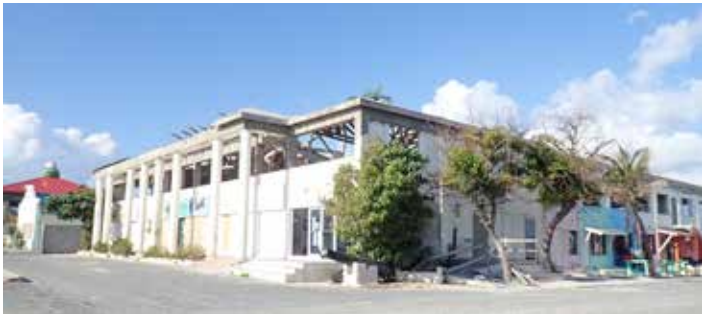
Above: building in central Grand Turk still needing a new roof. Below: migrant shorebirds back in Town Salina but, behind them, continued illegal infilling of this protected area still threatens.