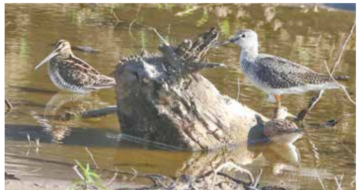
Some of the migrant shorebirds at Old Road Bay: snipe (left), greater yellowlegs (right), with pectoral sandpiper (in front and, closer; below). These species breed in North America. In the case of the pectoral sandpiper, the breeding range spreads from high arctic Canada, through Alaska and across Siberia. It has been discovered recently that individual males may range widely over this arctic range to breed with several females. In some cases, this is across both continents, with one male recorded as travelling 8000 miles within one breeding season.

Mr Dwayne Hixon, a local developer, has two Adopt a Home for