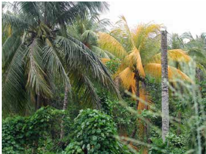
Cocos nucifera : (left) healthy; (right) leaf yellowing symptoms due to lethal yellowing.