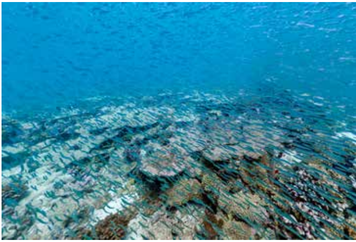
CoralReefs, Nelson Island, Chagos.

of coral and related habitats. We will increase engagement with ICRI and work with OTs to encourage the adoption of best sustainable management practice of coral reefs, as well as their associated ecosystems. We want to provide sustainability for fisheries and ensure food security while upholding social and cultural wellbeing.”