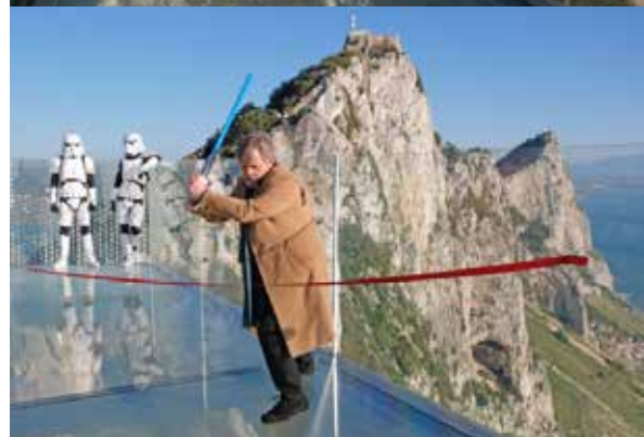
Mark Hamill, with Chief Minister Fabian Picardo and an unusual honour guard, open the Skywalk.

The new Skywalk links other sites including the Windsor Suspension Bridge and Apes' Den with the Upper Reserve via a series of walking trails. It is expected to attract many visitors particularly thrill seekers and lovers of Star Wars !