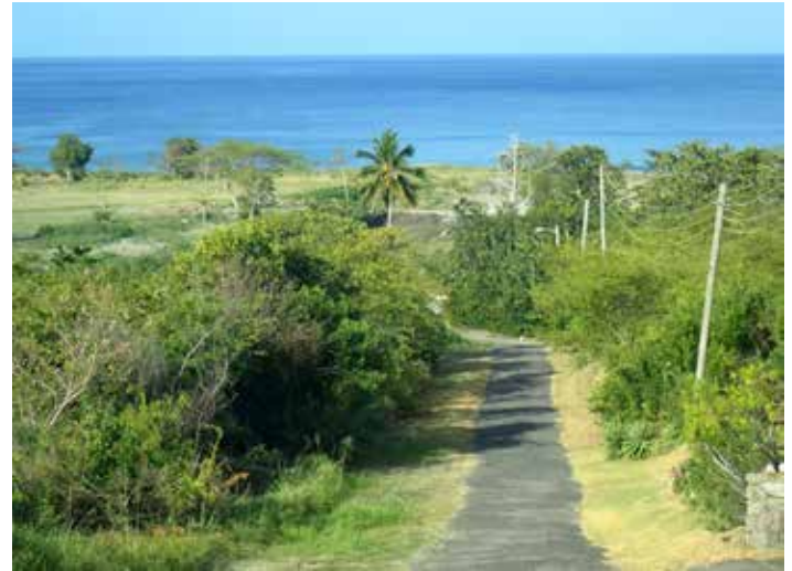
View from the hill at Old Towne down the road to the site, with the pond hollow between the trees almost in line with the road, and the planned golf course to the left in front of the sea.

This area to the north of the lot should be protected from most of