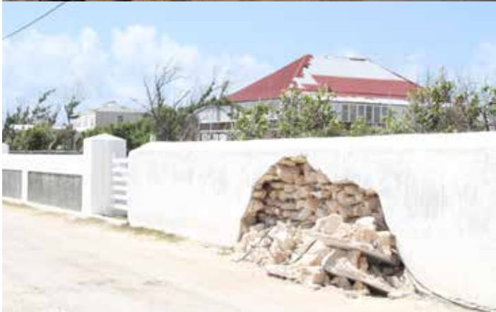
Severe damage to roofs, doors, windows and walls is under repair at the famous White House (above: the centre of the historic salt business) and other buildings in Salt Cay.