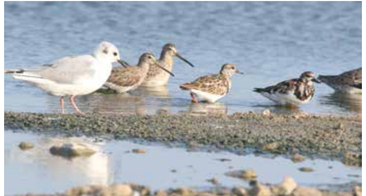
Laughing gull, short-billed dowitchers and ruddy turnstones on the old salt-pans at Grand Turk.

been largely left to its own devices to overcome the challenges, apart from a welcome visit from the Royal Navy personnel some time after the hurricane. They had re-roofed the airport building and the school. Since then, the islanders themselves had re-roofed most of the dwellings.