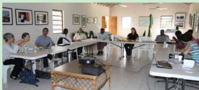
Round-table discussions.