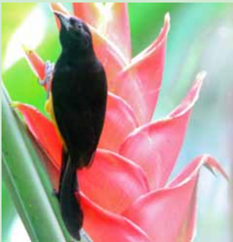
Male Montserrat oriole, Montserrat's national bird on red heliconia, Montserrat's national plant.

Welcome to the third issue of the newsletter about the new project entitled Maximising long-term survival prospects of Montserrat's endemic species and ecosystem-services . This is a good and reasonably concise title for technical use - but is a bit of a mouth-full for everyday use. So we thought that, for the latter, we might try something shorter - but meaning much the same thing, as well as trying to capture also the wider aspects. You see it above. It has not skipped our notice that it does lend itself to an abbreviation relevant to the urgency and importance of the matter: SOS Nature of Montserrat .