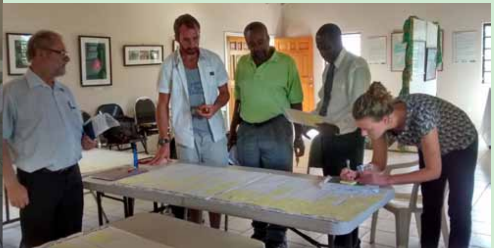
Workshop participants hard at work in groups.