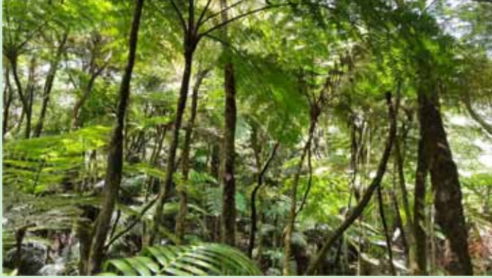
Left and right: Views of a visit to the Roche's area.