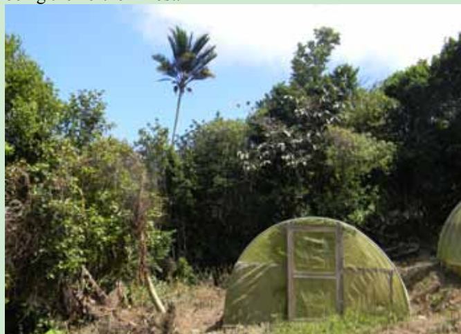
Overtop palms: (left: overtopping the canopy, with foreground greenhouse indicating scale; top: crown; above: seedling).