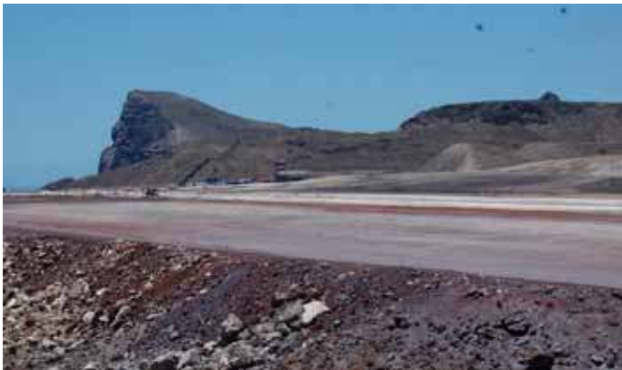
Airport site, Prosperous Bay Plain 15/01/2015.