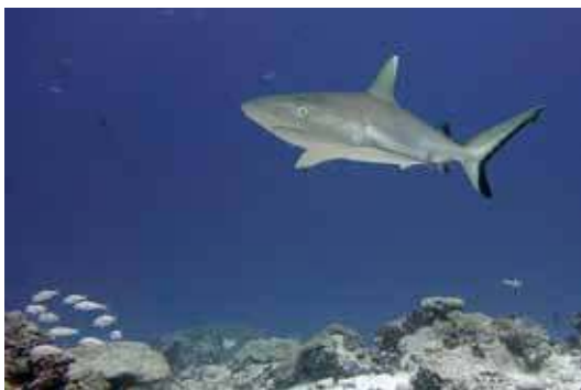
A grey reef shark spotted while some of the team were diving.

The Darwin 2015 Chagos Expedition is the third of a series of three, the purpose of which has been to achieve the objectives of a Darwin Initiative project Strengthen the World's Largest Marine Protected Area, Chagos Archipelago . The main aim of this three-year project is to provide scientific knowledge for effective management which will allow the Chagos Marine Protected Area (MPA) to be strengthened. It will also allow the development of a strategy that engages with potential stakeholders.