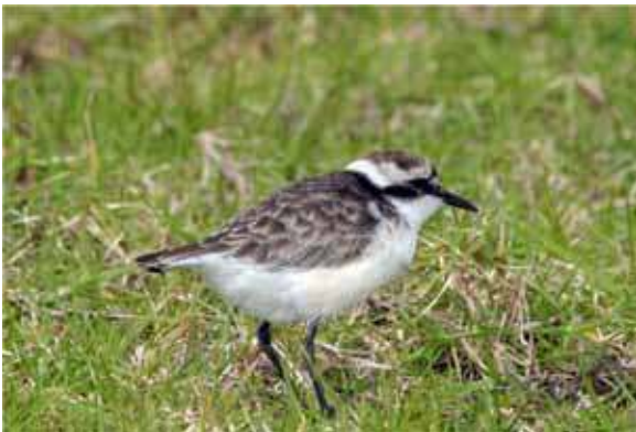
St Helena wirebird or plover Charadrius sanctaehelenae.

Various ecological considerations had to be addressed throughout the airport project. As there is very little flat land on St Helena, choosing the airport site was challenging. It was finally decided that Prosperous Bay Plain would be the site. This is the only desert-like habitat on the island and is therefore a site that is very important ecologically. One ecological issue that had to be addressed by the project was the fact that the site is a significant habitat for the wirebird, St Helena's only endemic bird. While the airport construction plan