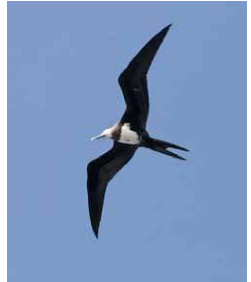
Male Ascension frigatebird (above) and immature Ascension frigatebird (left).