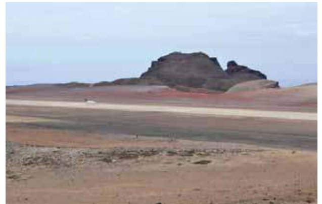
First plane landing, 15/09/2015.

Tuesday 15th September 2015 is a memorable day for St Helena. On this day, the first plane landed at St Helena's new airport – an incredibly historic moment. The aircraft in question was a Beechcraft King Air 200 which had flown over from Angola. Calibration tests were then conducted, with the final test completed on the 23rd September. An assessment of the test findings will now be made.