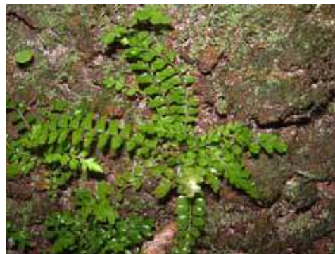
The Ascension Island spleenwort Asplenium ascensionis has a Species Action Plan.

For now, the BAP focuses on priority species, habitats and ecosystems requiring conservation action. This is due to limited resources and time. The BAP therefore currently targets 13 endemic and indigenous species, including the Ascension Island frigatebird (see article on p3) and