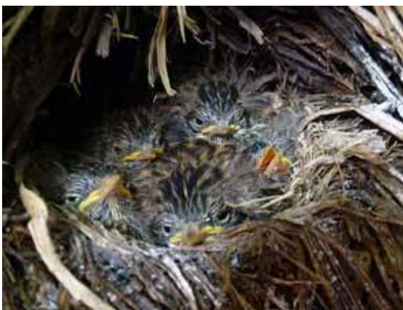
The first South Georgia pipit nest discovered in a place cleared of rodents thanks to the Habitat Restoration Project.

In March 2015, rodent bait was deposited for the last time as part of the South Georgia Habitat Restoration Project. The project had involved more than 800 loads of bait and three seasons of fieldwork. During this time, more than 1000 km 2 of land was treated. It is amazing to think that South Georgia may now be free from such destructive invasive species, which should have never been there in the first place.