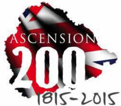
The Ascension Island Bicentenary logo.

A program of events has been planned for the whole Island community to celebrate this special Bicentenary year. The Bicentenary Weekend will be held from 22-25 October 2015, with events including; a concert with the Royal Marine Band, a flag raising ceremony, and the official opening of the Bicentenary Park. We hope that this special occasion runs smoothly and we look forward to seeing lots of photos!