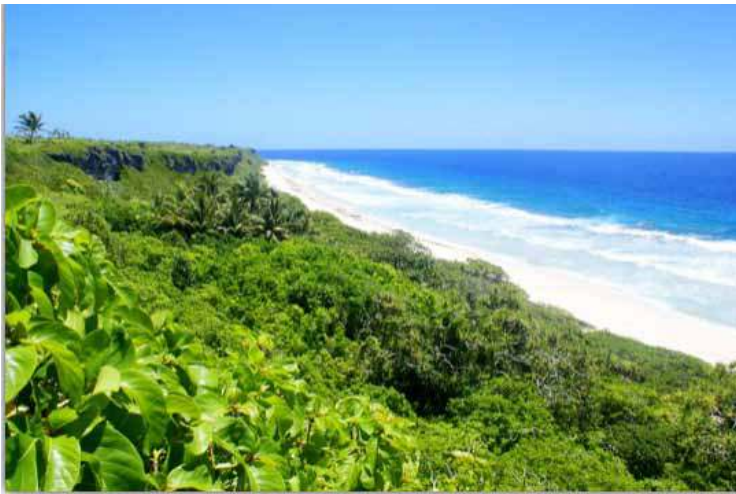
Henderson Island, Pitcairn.

An RSPB expedition team landed on Henderson Island on 22nd May 2015 in order to commence a six-month research expedition. The team set out from Pitcairn Island and, upon arrival on Henderson, spent the next two days unloading research equipment ready to commence work into better understanding the ecology of the island. The team worked until the end of August, so as to gather data on the vegetation, rats, seabirds and landbirds of Henderson.