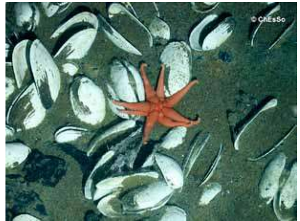
Eight-armed starfish on the East Scotia Ridge.

An international team of scientists has published an article in the April 2015 edition of the Zoological Journal of the Linnean Society to report the incredible discovery of a new family of deep-sea starfish. These were discovered in the warm waters surrounding a hydrothermal vent in the East Scotia Ridge, Antarctica. This starfish family, known as Paulasterias tyleri , is unusual in that specimens have six or eight limbs as opposed to the usual five.