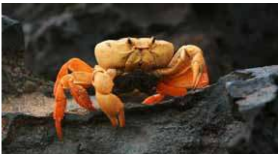
The land crab Johngarthia lagostoma is one of two invertebrates on Ascension Island with an action plan.

www.ascension-island.gov.ac/government/conservation/projects/bap/