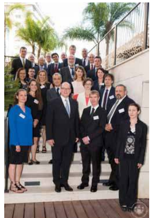
The Monaco Assessment Group with HSH Prince Albert II of Monaco.

One outcome of this meeting was The Monaco Assessment . This is a statement by the meeting participants, on conservation in the Antarctic and Southern Ocean region in the context of the Strategic Plan for Biodiversity 2011-2020. Another aim of the meeting was to provide guidance for action that can aid in the delivery of conservation successes in the Antarctic and Southern Ocean region. A further goal was to identify key work areas and indicators to provide guidance for this work.