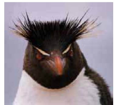
Southern Rockhopper Penguin.

www.south-atlantic-research.org/media/files/GAPNewsletter_Issue2.pdf