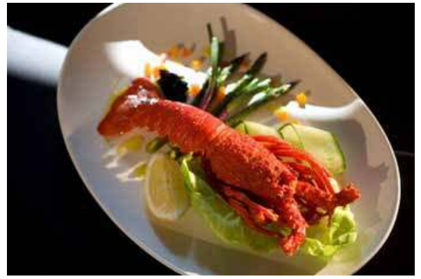
Tristan lobster is on the menu.

The Tristan lobster has travelled far afield and is now available in Central London restaurants. This famous Tristan rock lobster can be found at Roka, a group of Japanese restaurants found in the city centre, as well as in the Little Chelsea Fish Market, Kensington. Visitors can enjoy the shellfish in a variety of dishes including sashimi, tempura and with linguine! Selfridges on Oxford Street has also stocked the lobster since February 2015.