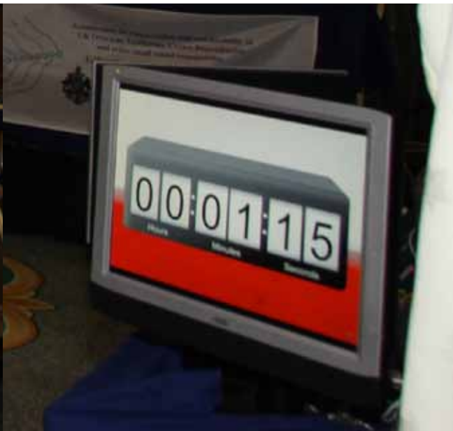
The conference organisers' (in)famous time-keeping system - which proved surprisingly popular!