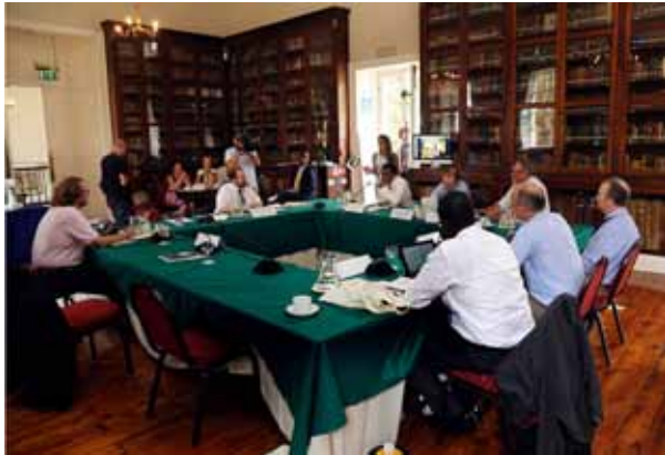
The Environment Ministers' meeting in session.