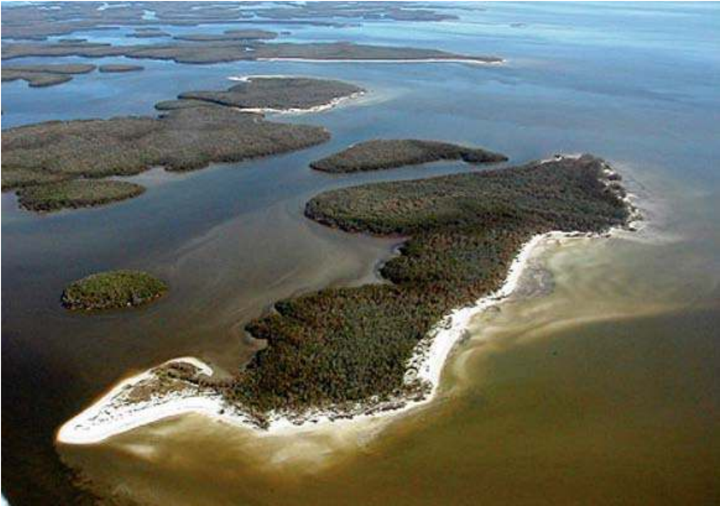
Oil from the Deep Horizon oil spill in the Gulf of Mexico.