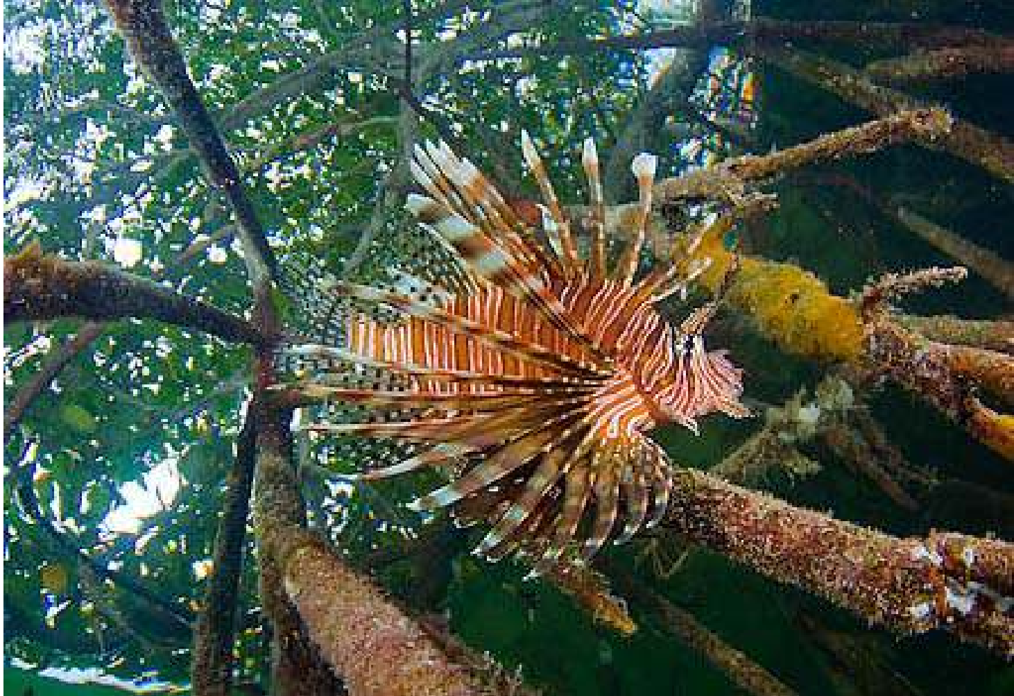
An invasive lionfish amongst red mangrove roots.