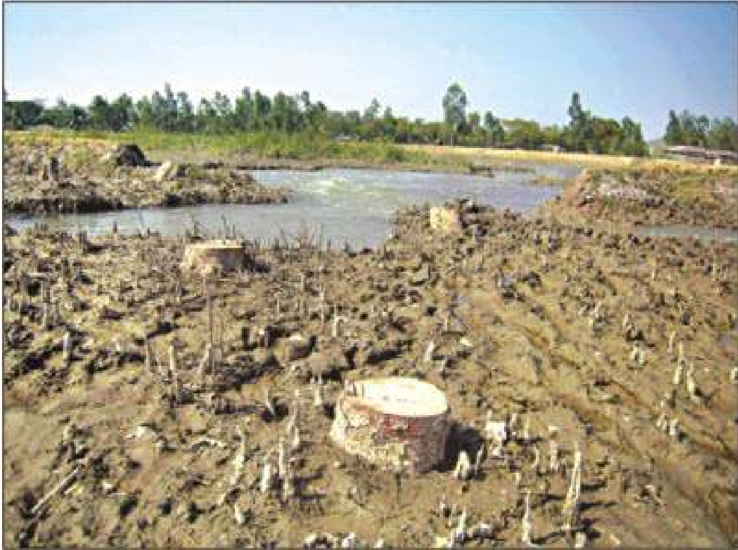
A site in Asia where mangroves were removed for shrimp farming.