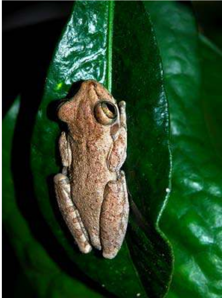
Haitian tree frog (NB - not found in a salt-water environment)