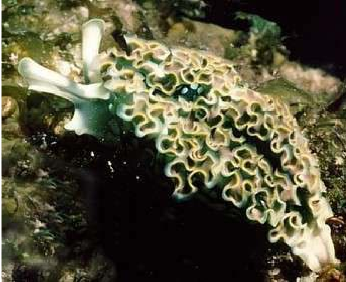
Lettuce leaf sea slug