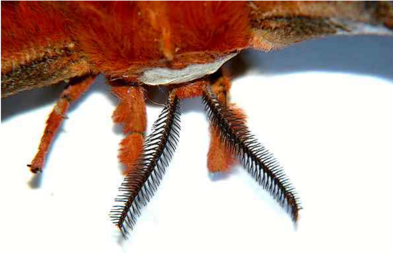
Feathery moth antennae