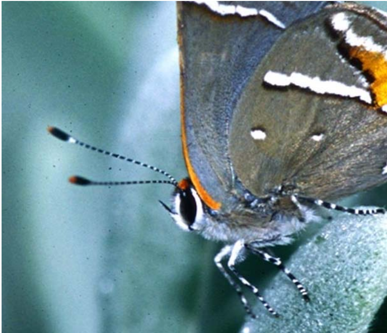
Typical butterfly antennae