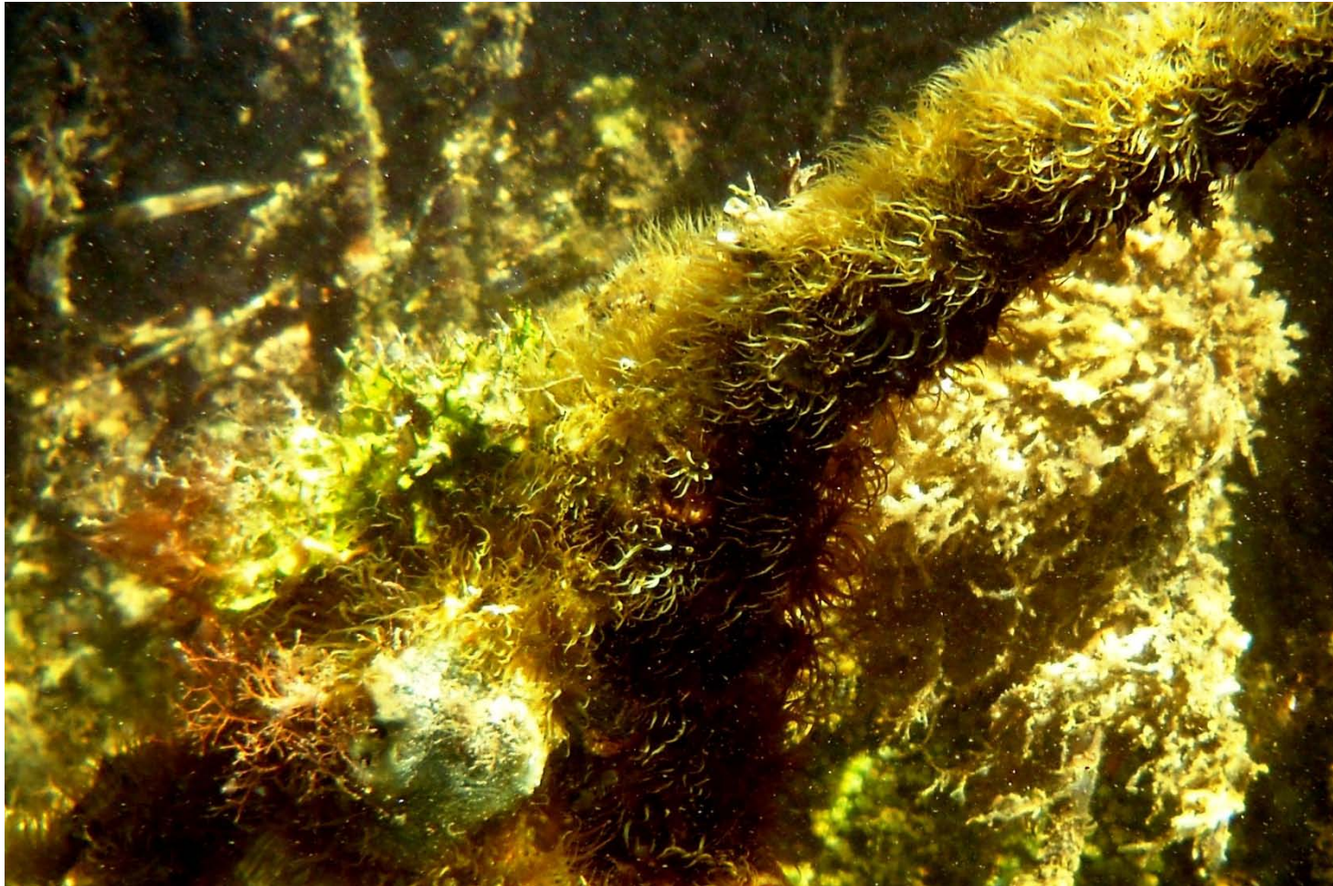
Algae on red mangrove prop roots