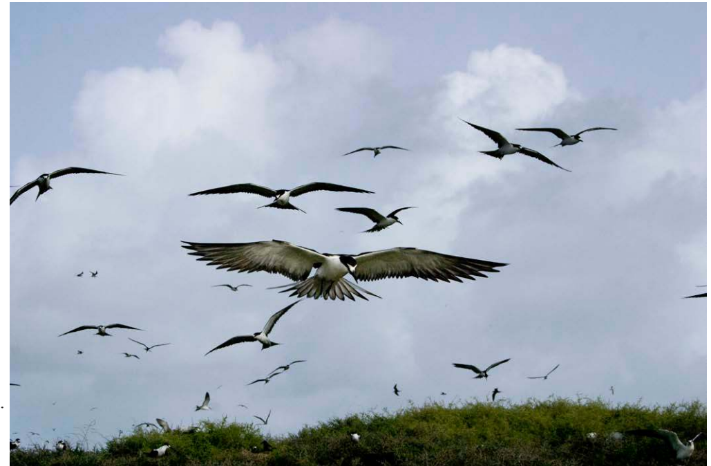
Sooty terns landing at their nesting colony, Dog Island, Anguilla