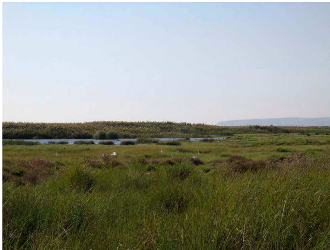
Livhadi Marshes, West Sovereign Base Area (Thomas Hadjikyriakou)

A series of baseline studies is being conducted: a topographical survey, a productivity study and population assessment for key breeding birds, and a