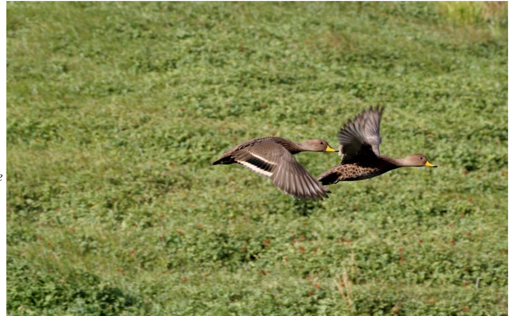
South Georgia pintails, one of the species benefitting from the restoration project

BAS continues to monitor ocean temperature around