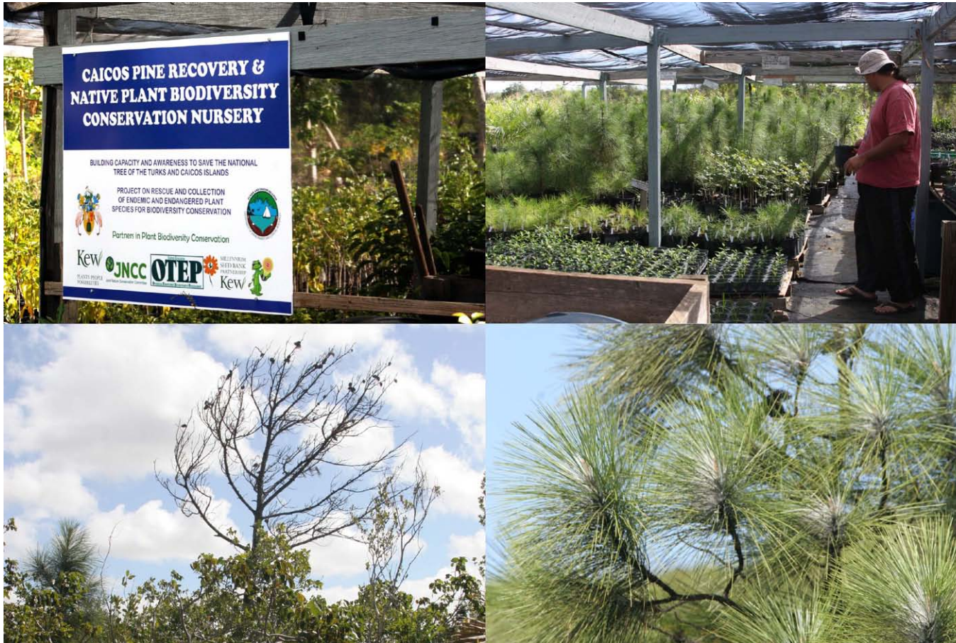
Top: the Caicos Pine Recovery Programme nursery; Lower: damage to pines caused by the invasive pine scale insect. (Dr Mike Pienkowski)

over decades though. The pine tortoise scale insect is believed to have been introduced with imported Christmas trees. A few strains of the Caicos pine have shown resistance to the scale. Seedlings from surviving trees are grown at the Government Farm on North Caicos and have been transplanted back to the original environment on Pine Cay, and seem to be doing well. In 2015, a trail was opened in the Middle Caicos pine yard to provide information on the programme.