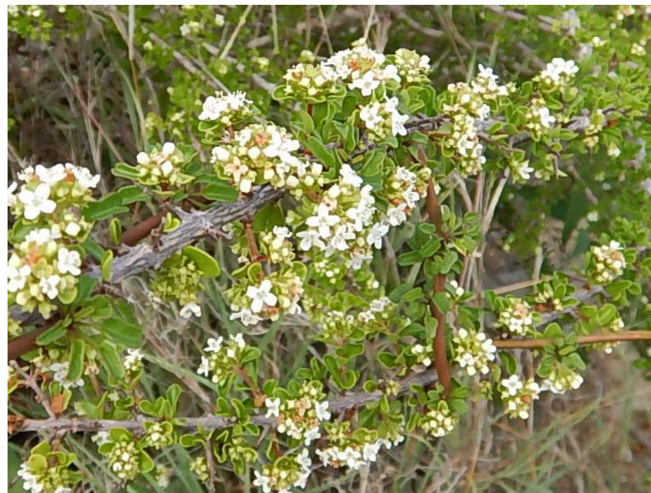
Machaonia woodburyana – a Critically Endangered plant found only in the British and US Virgin Islands (National Parks Trust of the Virgin Islands)

Other species conservation initiatives carried out in BVI include the following: