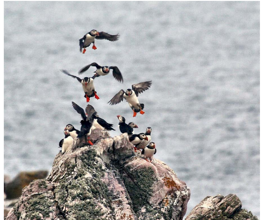
Puffins on Burhou, in Alderney's Ramsar Site

LIVE: teaching through nature; an AWT flagship project links schools with wildlife webcams ecologists and a wide range of primary teaching resources.