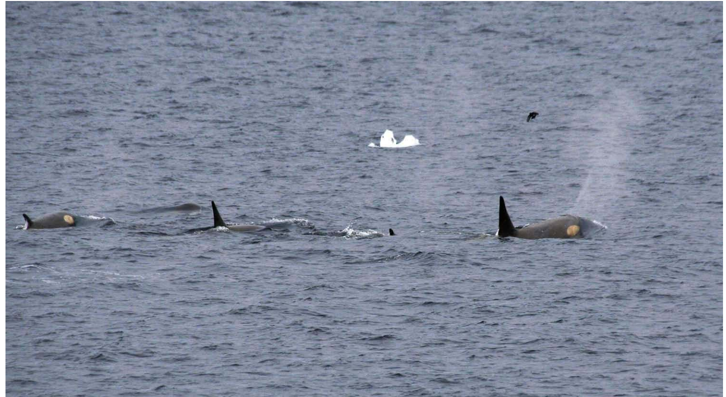
Pod of orcas, British Antarctic Territory

The Convention on the Conservation of Antarctic Marine Living Resources was adopted in 1980. The