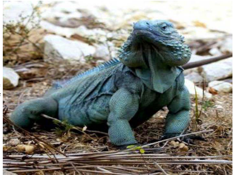
Grand Cayman blue iguana

- A paper published in the Bulletin of the British Ornithologists' Club journal has proposed that the bullfinch native to Grand Cayman and Cuba, be