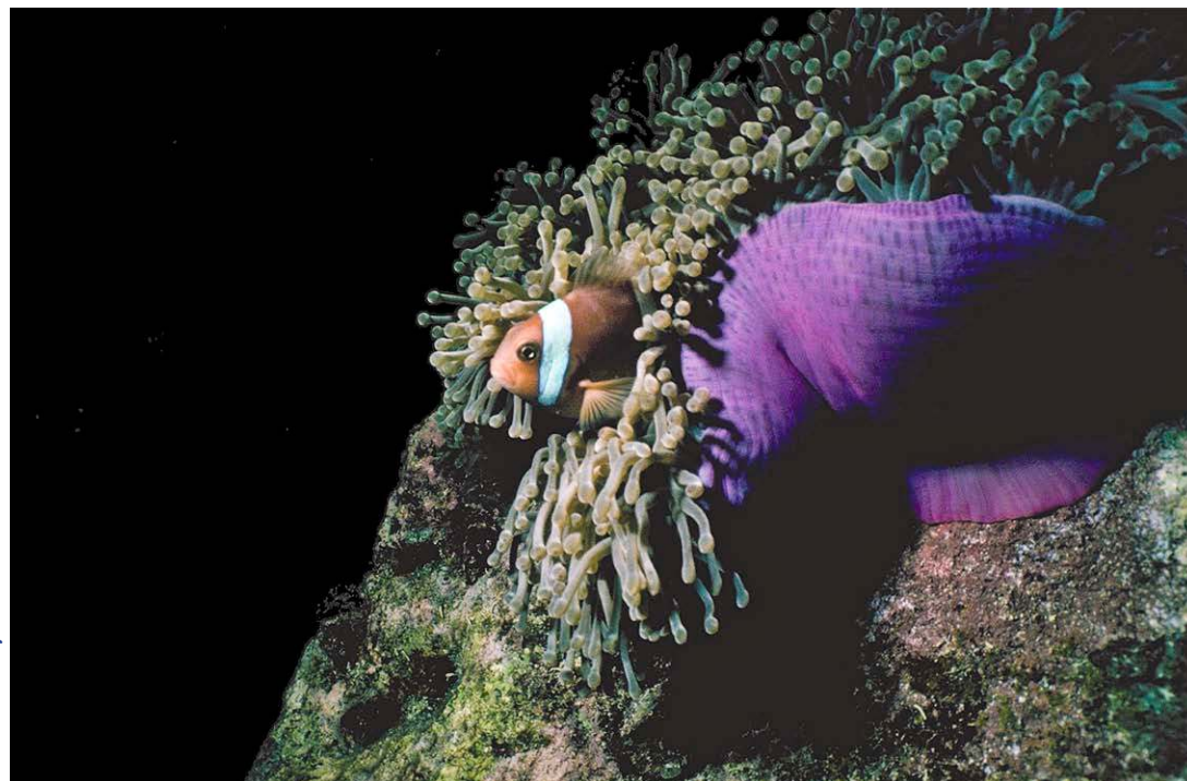
Coral reef, anemone and fish