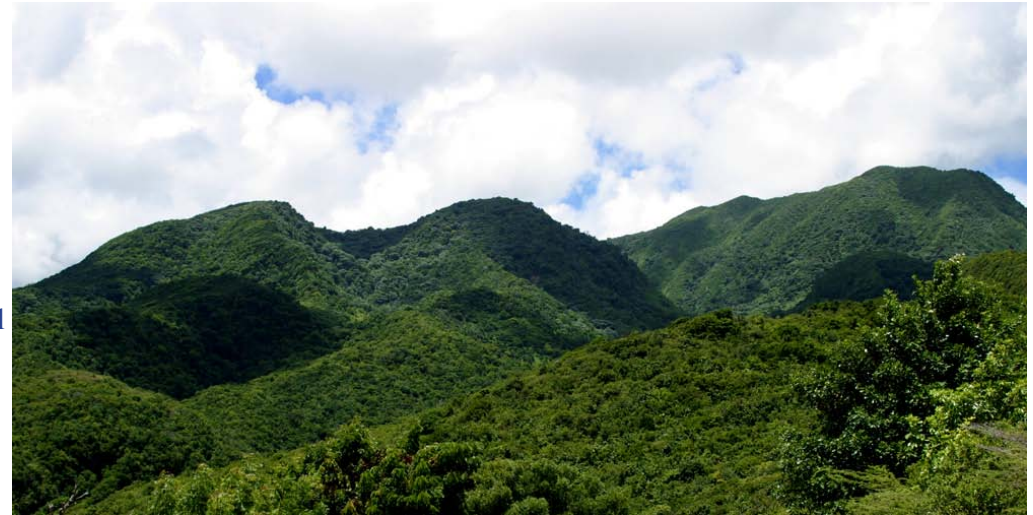
Exceptionally biodiverse forest of several types covers the Centre Hills, Montserrat

In 2014, the Organisation of the Eastern Caribbean