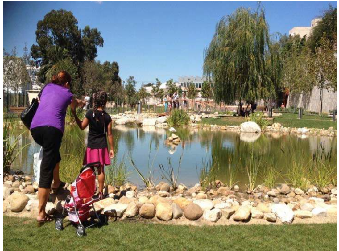
Commonwealth Park, Gibraltar – recently created from a town-centre car-park

Through the urban planting programme, a total of 158 trees have been planted around Gibraltar. The Gibraltar Commonwealth Park was created in 2014, and has become one of Gibraltar's prime recreational areas. The Department of Environment and Climate Change (DECC) has worked extensively on the maintenance and improvement of existing green areas. A GIS