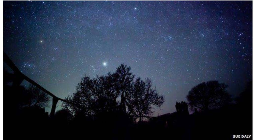
Stars shine brightly over Sark

The Development Control Committee Mandate outlines the scope and role of the Committee in relation to development planning. Performing Strategic Environmental Assessments is not a legislative requirement on Sark, and a public enquiry/policy development system needs to be developed. A Vision for Sark identifies the need to review and activate land reform legislation, establish a planning system which emphasises the needs of the environment, and