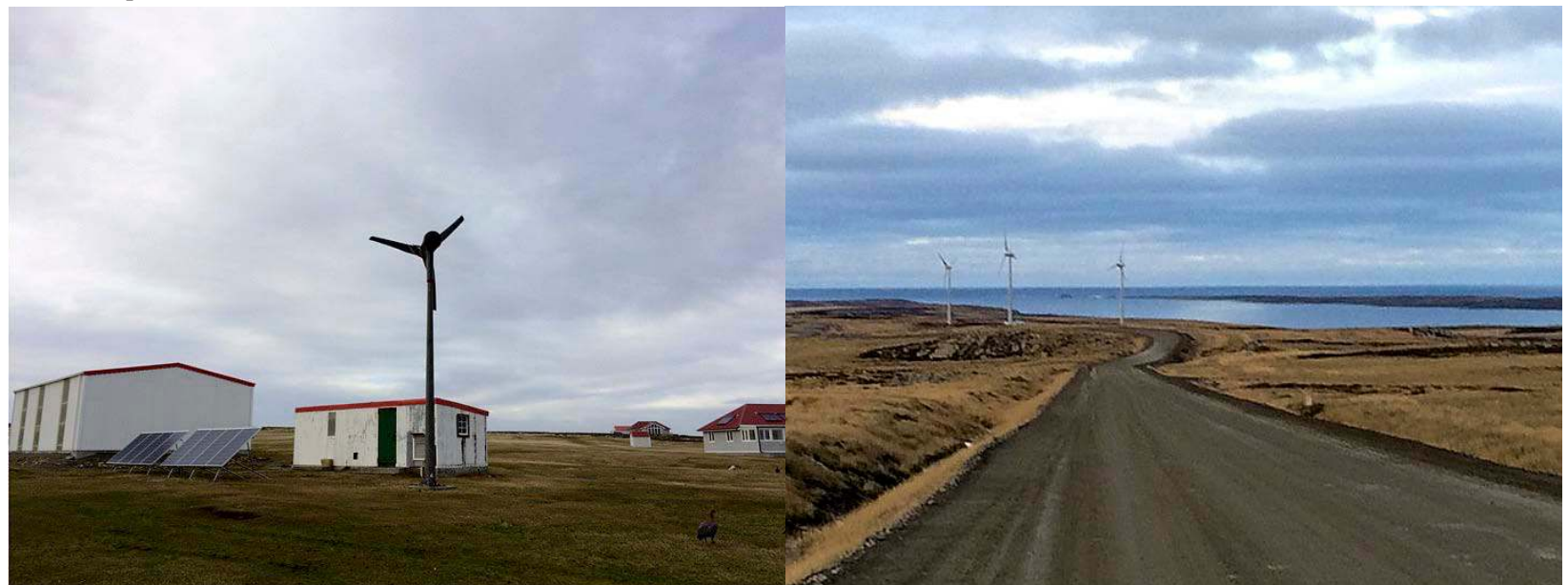
Small- and larger-scale wind-power generators in the Falkland Islands (Falkland Islands Government)

Oil pollution is managed by the Environment Protection (Overseas Territories) (Amendment) Order 1997, the Merchant Shipping (Oil Pollution) Act 1971, Merchant Shipping Act 1995 and Oil in Territorial Waters Ordinance 1987.