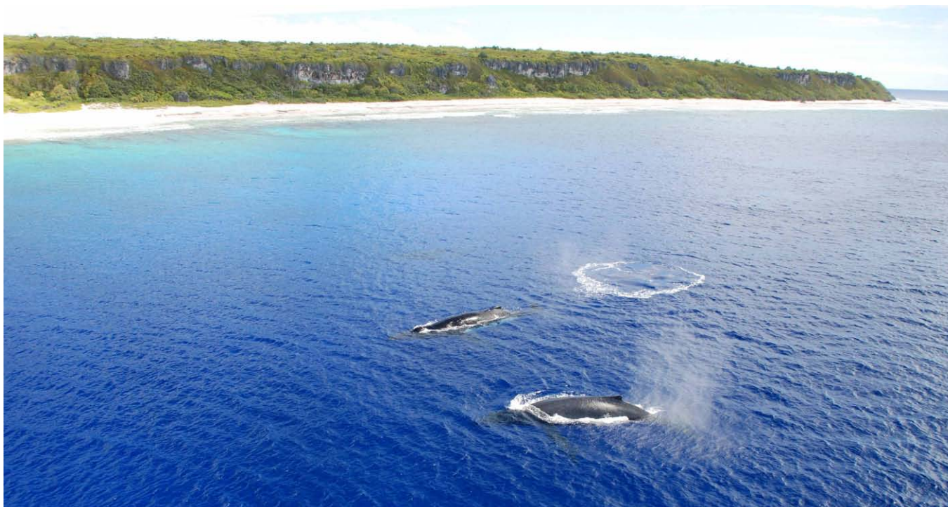
Humpback whales off Henderson Island, Pitcairn Group

Enforcement in the MPA is a major consideration. To overcome this, Pew Charitable Trusts have partnered with Satellite Applications Catapult, a UK government initiative created to help foster economic growth through the exploitation of space. The 'Eyes on the Sea' project is pioneering a system that enables government officials and other analysts to identify and monitor unlawful activities in global waters, particularly illegal, unreported, and unregulated fishing (IUU).