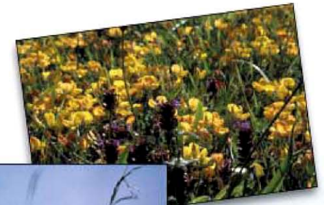
Setheal and common birds-foot trefoil

Jersey's wetlands have an important place in the natural diversity of Jersey but they are not extensive. These very special habitats are capable of sustaining a wide variety of wildlife, although many areas have been lost over the years due to the effects of intensive agriculture, urban sprawl and natural encroachment. St Ouen's pond, on the Island's west coast, is probably the most significant wetland area in Jersey. It is a dedicated nature reserve with open water, reed beds and a marshy perimeter providing a rich selection of habitats for birds, fish, insects and flowers. The reed beds are home to bearded reedlings and Cetti's warblers. In recent winters bitterns have discovered this wetland haven and hunt here for fish and insect larvae.