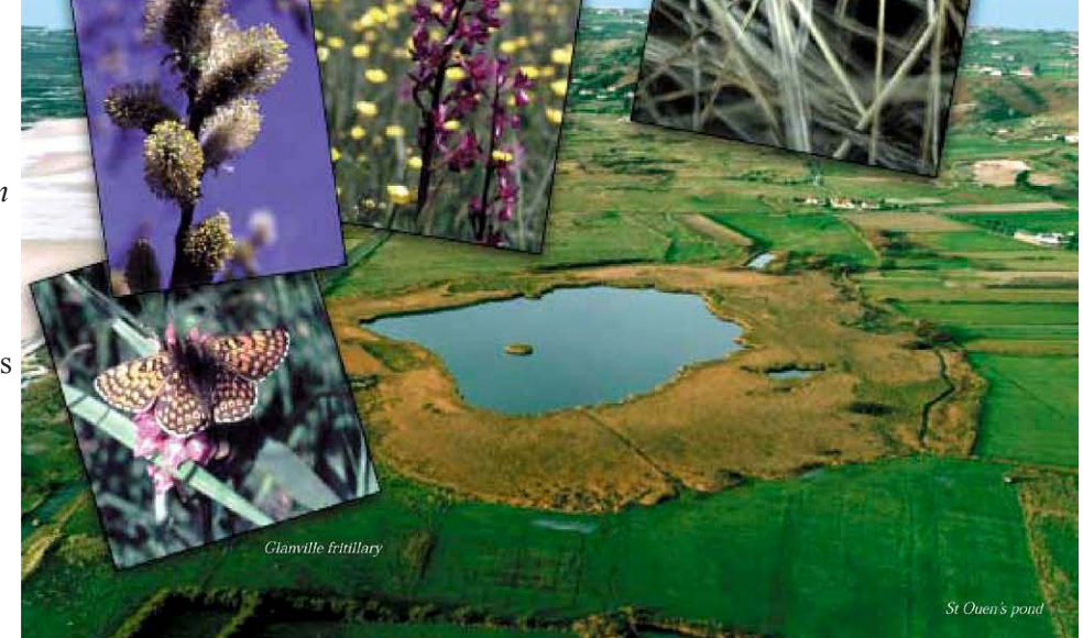
St Ouen's pond

Remaining proposed Ramsar Convention Wetland of International Importance