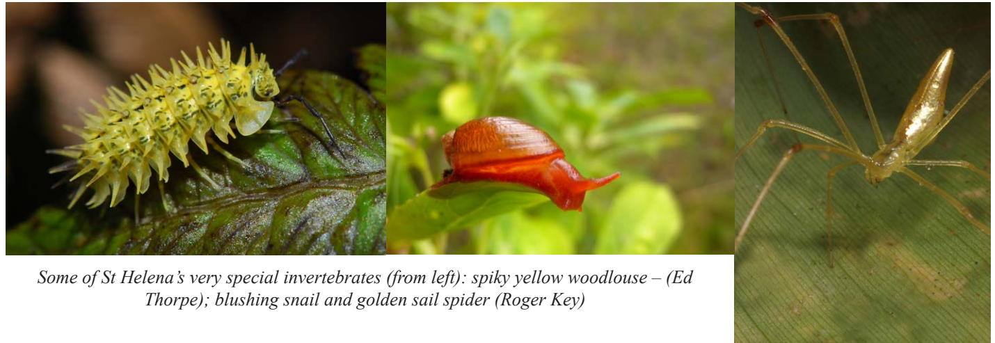
Some of St Helena's very special invertebrates (from left): spiky yellow woodlouse – (Ed Thorpe); blushing snail and golden sail spider (Roger Key)

In 2016, the first commercial flights will land at the new St Helena airport (see above). From the outset, the site for the airport on Prosperous Bay Plain, an