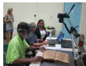
Hon. Josephine Connolly, Deputy Speaker of the House, on her visit to the museum, observing how the historical records are being digitized.

www.facebook.com/TurksCaicosNationalMuseumFoundation/