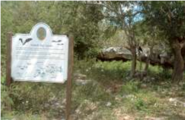
Conch Bar Caves – home to at least 4 species of bat