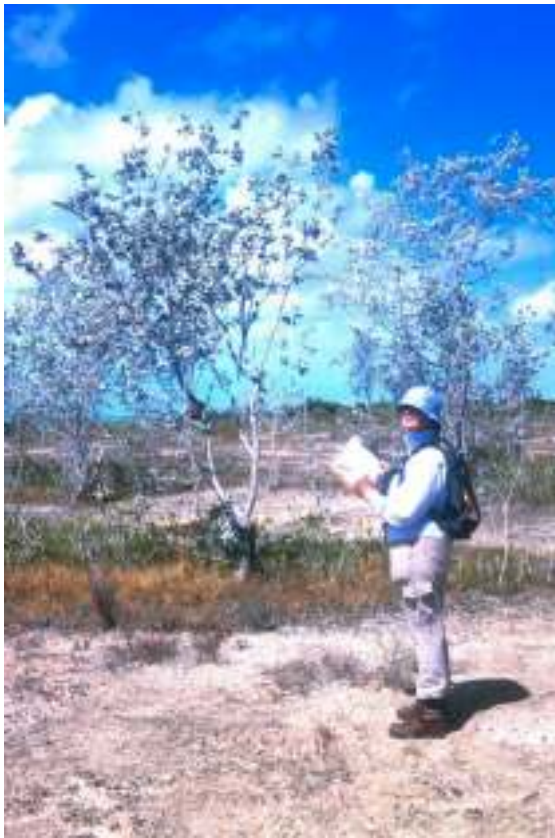
Bird survey on the salina flats of Middle Caicos

Birds move around more freely than most animals. It is often thought that they can go somewhere else if something goes wrong with their habitat in a particular place. However, recent ecological studies indicate that bird populations survive only because the birds have a network of habitats available to them – nowhere is surplus to their requirements. Fieldwork on wetland birds before and during the Darwin Project has shown that the TCI study area is very important to waterbirds and that usage is very variable. This variability is seasonal and year-to-year, and probably relates largely to weather conditions. It is important that human intervention does not make things yet more complicated. Consider the vulnerable West Indian Whistling Duck. The project has raised local interest in this important and secretive bird, and several valuable breeding observations have been made by local residents and project staff. However, one breeding site was made unavailable this season because someone burnt the vegetation where the bird nests.