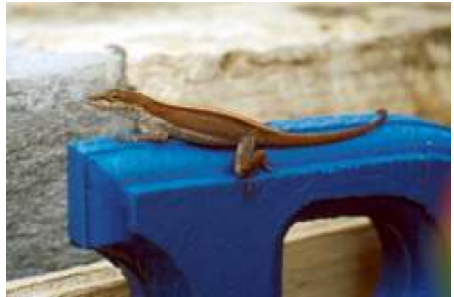
TCI supports a unique form of the Bark Anole , seen here resting on the sign which spells out the names of the three settlements on Middle Caicos

what people know about snakes in these islands, it is no wonder that snakes are often killed as soon as they are seen. Several interesting tales about snakes are common here, probably the most misleading being that they are poisonous. This is not the case with the TCI fauna - two of the three species documented are constrictors, and the third is a minuscule termite-eating worm snake. While the Biblical association of snakes with evil is common around the world, other beliefs are less widespread. There is one snake story unique to this region that is worthy of mention. It is said that a cat can kill a snake by allowing the snake to wrap around its body - the cat then inflates its body, and breaks the snake into pieces! No one has apparently ever seen this happening. . .