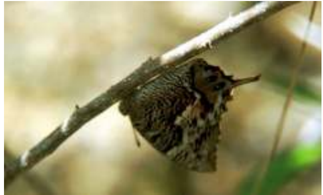
As its name suggests, when it comes to rest, the Turks Island Leaf Butterfly disguises itself as a dead leaf

predator of aphids, which is very widespread in the New World at present, although taxonomic work may split it into more than one species. Another is Diomus roseicollis , which probably feeds on scale insects, and shows a typically Caribbean distribution, from southern Florida, through the West Indies to Trinidad and South America. A third species, Psyllobora schwarzi , which probably feeds on mildews and other moulds, is more narrowly distributed, known from Cuba, Hispaniola, the Bahamas, Grand Cayman and South Caicos – making it one of the few beetles previously recorded from TCI.