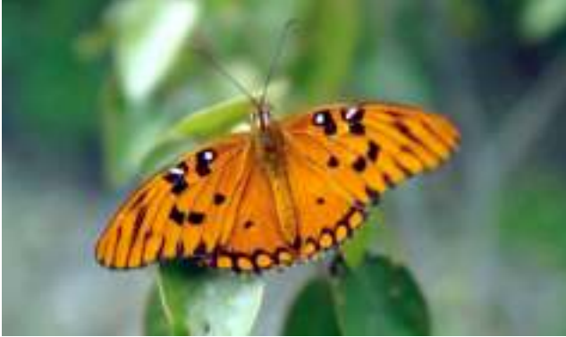
The Gulf Fritillary is amongst the most commonly encountered butterflies in TCI

The variety of insect life is astonishing. Of all the different animal and plant species known to science, over half are insects, and many new species are yet to be discovered. Although it is often the troublesome ones, such as mosquitoes, that we notice, these represent only a fraction of the insect biodiversity that occurs in the varied habitats that surround us. Many insect species go completely unnoticed, but provide essential ecological services. Plants often rely on insects for pollination, and many of the other animals surveyed by the Darwin Project would starve without a healthy supply of insects for food. Some insects, like the butterflies, are undeniably beautiful in their own right.