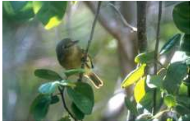
The Thick-billed Vireo, one of the special secretive birds of TCI, may appear out of the woodland to inspect visitors

Hispaniola); these include Thick-billed Vireo, Bahama Woodstar Hummingbird, Greater Antillean Bullfinch and Cuban Crow.