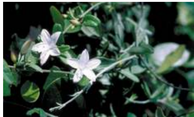
Climbing plants include Jacquemontia havanensis .

Grand Turk plant sale was particularly successful. The construction of a small temporary shade (made of local materials) was recently completed, and a large supply of used pots has been located. Plants are doing very well and more species are being propagated every week. Native plants of interest amongst those being cultivated are Frangipani Plumeria , Gumbo Limbo Bursera , Mahogany Swietenia , Necklace Pod Sophora and Geiger Tree Cordia . Plants of important cultural usage which are being grown include Burn Plant Aloe , Indian Almond Termenalia , Seville Orange Citrus , and Guinep Melicoccus . The National Trust plans to present trees to all schools throughout the islands for schoolyard plantings, and future sales will help to support the on-going propagation work.