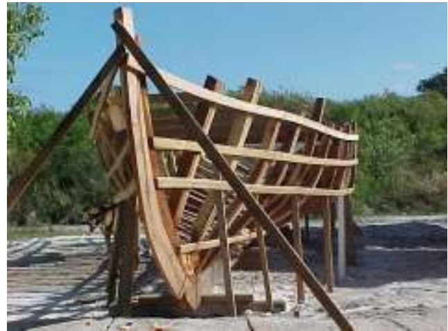
The skeleton of a traditionally built sloop

keel, and the natural zig-zags in the branch form of Locust can be used to create strong, curved ribs. Lysiloma trees need not be felled to harvest the contorted branches, as the trees do not grow much higher than twenty feet. An experienced boat builder can produce a perfectly formed rib from a raw, crooked branch of Lysiloma in a matter of minutes, first using a hatchet, then a hand plane. While the lightest of the local woods were once used to cover the ribs, imported, untreated white pine planks are the preferred material for the boats' hulls now. Once the single