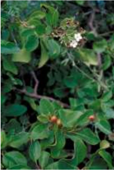
Bourreria ovata , sometimes known as Strong Back.

Plants represent some of the most important species in terrestrial ecosystems, “feeding” on sunlight by photosynthesis, and providing sustenance to the many organisms that feed on their leaves, roots, seeds and flowers. They also provide the structures in which many animals nest, hide from predators, or wait in ambush for their prey. The plant life of the Turks & Caicos is being surveyed under the Darwin Project, thanks to the efforts of our collaborators from the Fairchild Tropical