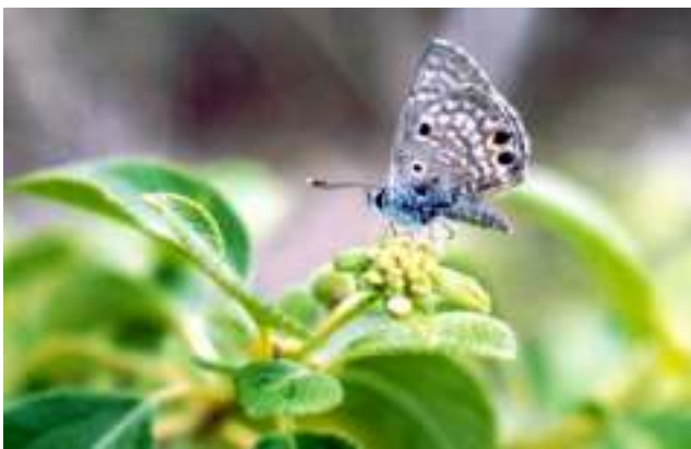
Cyclargus thomasi clenchi is one of the lyceanid butterflies (blues and hairstreaks) found on Middle Caicos