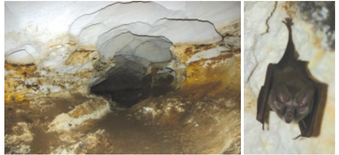
Caves like those found at Conch Bar (left) are home to a range of special creatures. These include the big-eared bat (right) and other bat species

Apart from the species mentioned above, other species of bat may occur in TCI. These include further species of Natalus , the big brown bat Eptesicus fuscus , the velvety free-tailed bat Molossus molossus , and even the fishing bat Noctilio leporinus .