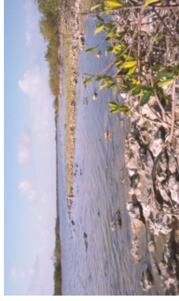
Middle Caicos and adjacent islands support many ponds (illustrated here by Armstrong Pond). Some are regularly inundated by seawater, whilst others are less saline. The aquatic biodiversity and shore-line vegetation of these ponds varies with the salinity of the water and the local topography