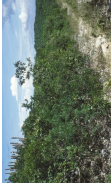
The central, inland areas of North, Middle and East Caicos are dominated by low-growing scrub. These dry shrublands support a range of evergreen and deciduous woody plants, as well as herbaceous species including orchids

As well as surveys for bats, birds, herpetiles, insects and plants, the Darwin Project has invested much effort in developing a detailed and accurate habitat map for the study site in TCI. Knowledge of the distribution of habitats, as well as species, is vital for biodiversity management planning. Fred Burton (Cayman Islands) co-ordinated the production of a habitat map for the project. A provisional map (based on satellite imagery) was prepared first, and then habitats were surveyed on the ground to ensure the map's accuracy. Input from plant specialists was important at this stage, as many habitats are distinguished from one another by their characteristic vegetation. Fred, Bryan Naqqi Manco and Dr Mike Pienkowski spent many days in the field, fighting through dense undergrowth in places, to check and record the locations of particular plant communities and the boundaries between habitat types. The survey results were analysed and refined by Fred and Mike, using specialised Geographic Information System (GIS) software, and resulted in the colour-coded map shown below. Their work also provided an accurate map of the boundary of the TCI Ramsar site – information required by the TCI and UK governments. The detailed outputs of the habitat mapping exercise form an important part of the management plan developed by the project,