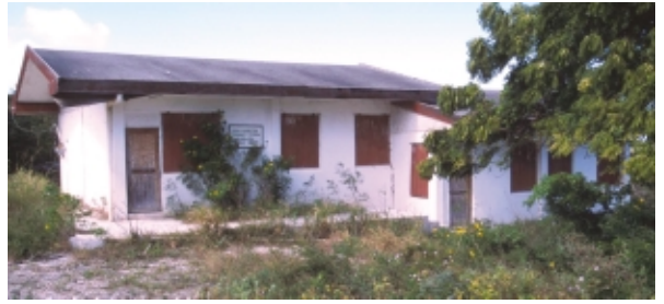
The old school buildings in Bambarra are to be converted into an eco-centre for TCI residents and visitors

In the last newsletter, we reported that the TCI Government had granted the Turks & Caicos National Trust a long-term lease on the former Vera Hamilton Primary School in Bambarra, Middle Caicos. The Trust plans to convert the old school building and surrounding land into a biodiversity study centre for local people and visitors. Since that time, the Trust has secured (mainly from local sources) much of the substantial funding needed to renovate the building. They have also developed designs for the Centre and its facilities, and building work is expected to commence shortly. Meanwhile, the Trust continues to seek funding to complete the renovation and fit out the Centre.