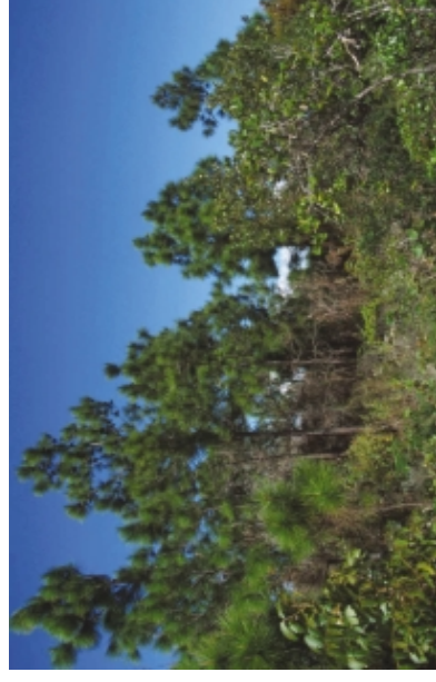
Some inland areas support extensive stands of Caribbean pine, as well as other woody and herbaceous species. These areas are typically exposed to seasonal flooding by freshwater during periods of heavy rain

Of particular interest are the complex transitional zones that occur between the diverse wetland habitats, and between these and the dryland and marine habitats. Such natural transition complexes are becoming extremely rare in coastal areas throughout the world.