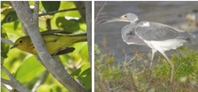
The yellow warbler (left) and tricolored heron (right), are just two examples of birds that rely on TCI's dryland and wetland habitats