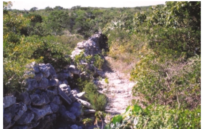
If properly managed, trails like the Haulover Plantation Field-road (above) provide ideal places for visitors to experience the biodiversity and cultural heritage of the Turks & Caicos Islands

National Park, the conservation requirements of the caves required urgent consideration. The management plan provides this, with a detailed set of recommendations for the future management of the site. This is an example of the type of plan that can be developed for specific trails and sites. Generic recommendations for management, interpretation materials, stakeholder involvement, and so on, are given for other sites, as part of the overall management plan.