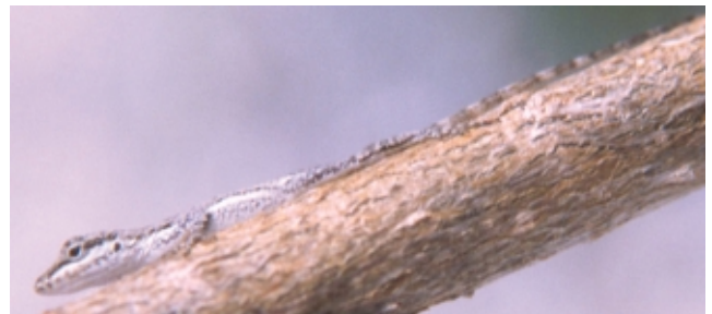
Reptiles like this bark anole can be difficult to spot amongst the vegetation, but like to keep an eye on visitors

they are found in so few places in the world, these animals are very rare in global terms, and some are already recognised internationally as having special conservation status. For example, three of the reptiles listed above are protected under the Convention on International Trade in Endangered Species (CITES), and one was recently listed as Critically Endangered by the World Conservation Union (IUCN).