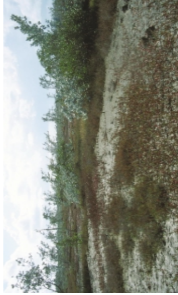
Flats and saltmarshes make up much of the habitat in the southern part of North, Middle and East Caicos. Exposed to varying degrees of tidal flooding, these habitats support characteristic vegetation, tolerant of salt water

but the main map only is reproduced here to illustrate the range and distributions of habitats across the study site.