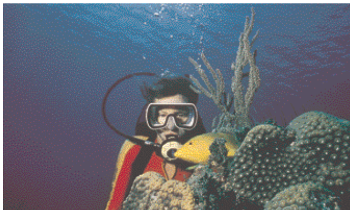
Cayman Islands Department of Tourism