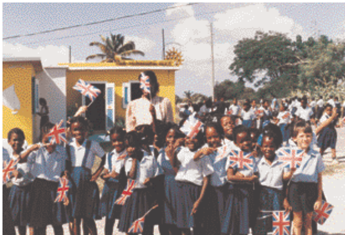
Primary school children – Anguilla