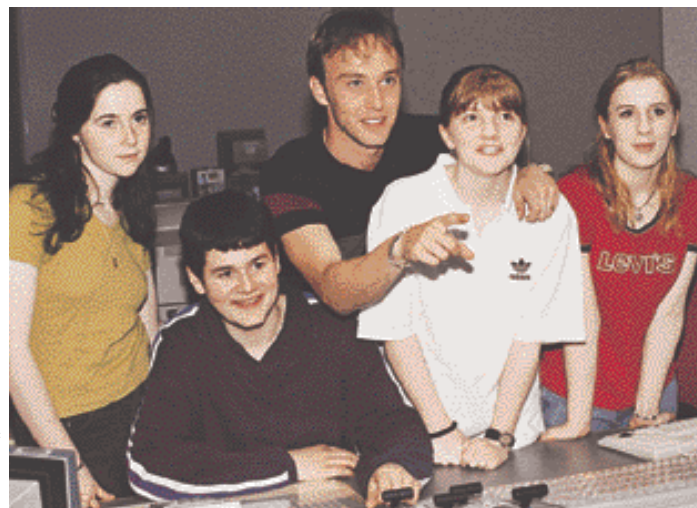
Keene Public Affairs Consultants Limited? BBC TES?