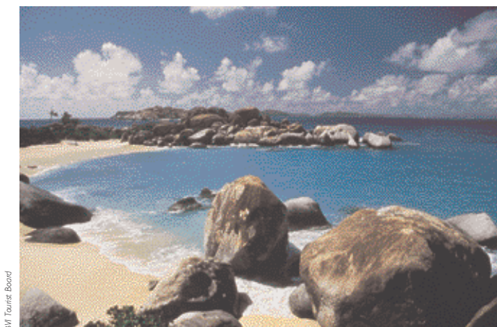
BVI Tourist Board