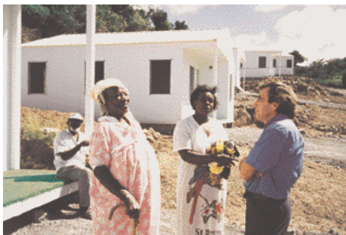
New housing project, Montserrat