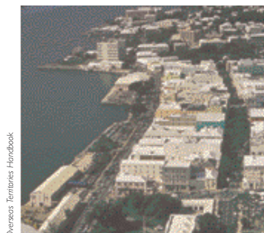
Overseas Territories Handbook

5.3 The success of the Overseas Territories has been built upon by their reputation for sound administration, effective legal systems, political stability and public order, and their association with the UK. These provide reassurance to would-be investors and business partners. It is essential for the future of the sector that this reputation for honest administration and probity be preserved and enhanced.