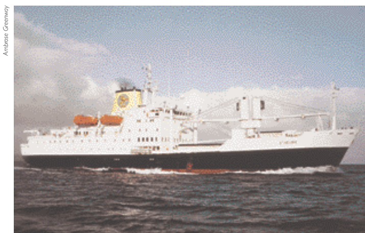
The RMS St Helena , providing passenger, mail and freight services to St Helena

7.13 Efforts will be made to diversify sources of assistance to the Overseas Territories. There is a potentially important role for the private sector in stimulating development, and we will work to establish mutually beneficial partnerships between the private and public sectors in the Overseas Territories, with particular emphasis on the tourism and financial services industries.