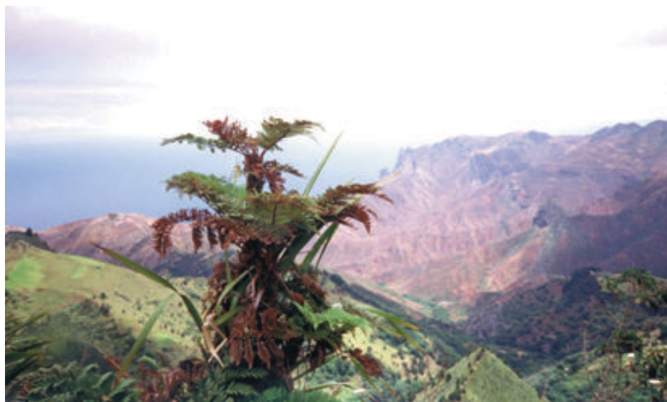
Endemic fern on St Helena