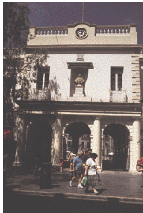
Gibraltar Information Bureau

4.4 Judicial corporal punishment remains on the statute books of the British Virgin Islands and Bermuda. It was abolished in Montserrat in 1991 and in Anguilla and the Turks and Caicos Islands in 1998. In the Cayman Islands abolition was begun in 1995 and completed in 1998. There is a belief in those territories which retain it that it provides a deterrent, particularly against hooliganism and juvenile crime. But in recent years, it has only been handed down as a sentence in the British Virgin Islands, the last time in 1996.