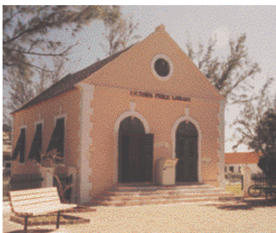
The Victoria Public Library on Grand Turk

7.6 The importance of this can be seen in the field of aviation safety. Bermuda and the Cayman Islands, who have both achieved US Federal Aviation Administration Category I status, have shown how high standards in aviation safety regulation can help in the development of a successful tourist industry. But there is a need to improve standards in other Caribbean Overseas Territories to ensure that foreign airlines can continue to operate services to those territories. The Civil Aviation Authority has agreed individual action plans with the territories that should help them reach and maintain minimum International Civil Aviation Organisation safety standards and, ultimately, UK standards.