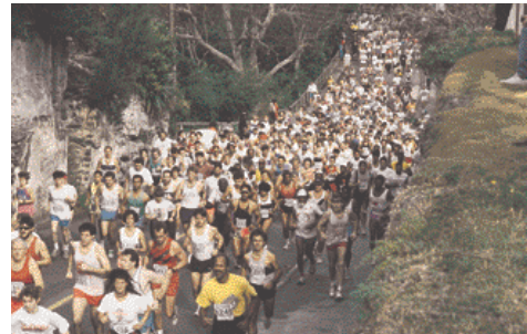
Hamilton, Bermuda: International 10 km race

Government of Bermuda Information Service